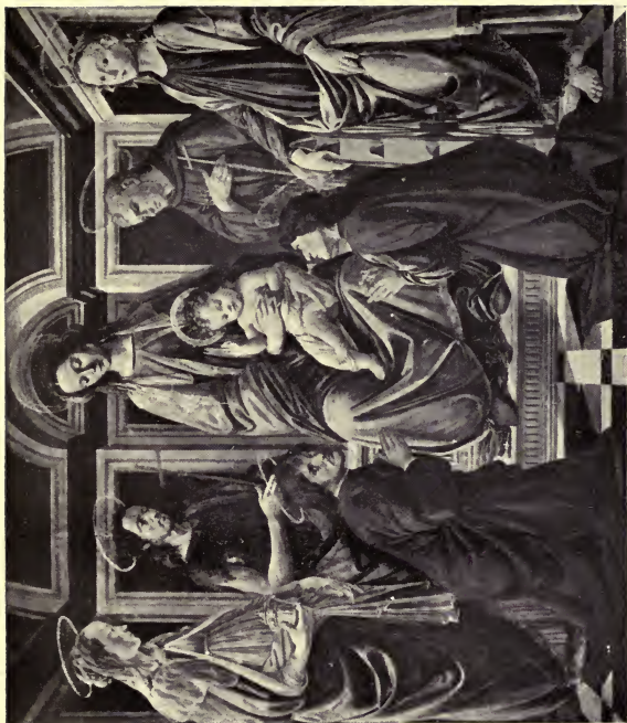
MADONNA AND CHILD ST. MARY MAGDALENE, ST. JOHN THE BAPTIST, ST. FRANCIS, ST. CATHERINE SS. COSMO AND DAMIAN