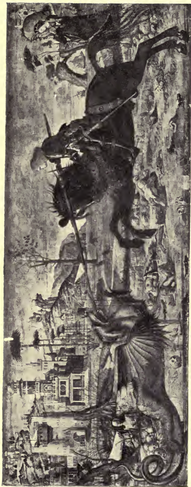
ST. GEORGE AND THE DRAGON From the painting by Carpaccio in the Church of San Giorgio degli Schiavoni, Venice