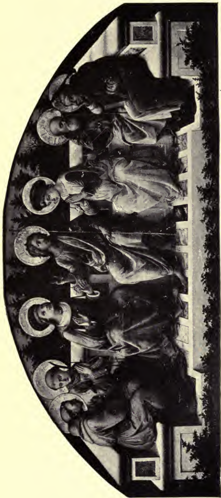
ST. JOHN THE BAPTIST ST. FRANCIS, ST. LAWRENCE, SS. COSMO AND DAMIAN, ST. ANTONY, ST. PETER MARTYR From the painting by Fra Filippo Lippi in the National Gallery