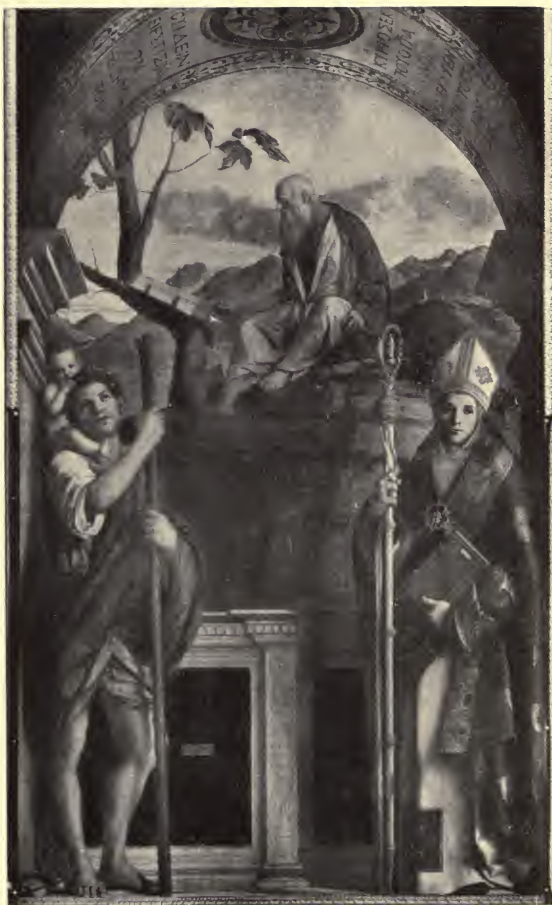
ST. CHRISTOPHER, ST. JEROME AND ST. AUGUSTINE

From the painting by Giovanni Bellini, in the Church of St. Chrysostom, Venice