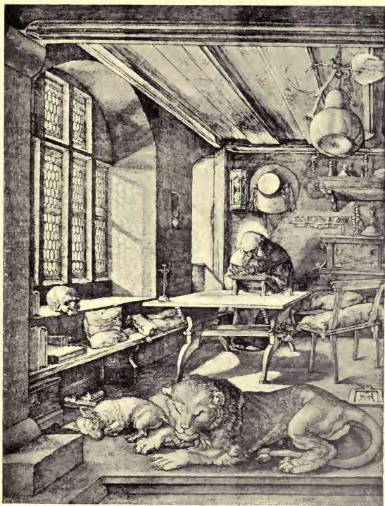
ST. JEROME IN HIS STUDY

From an engraving (1514) by Albrecht Dürer