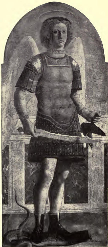
ST. MICHAEL AND THE DRAGON

From the painting by Piero della Francesca in the National Gallery