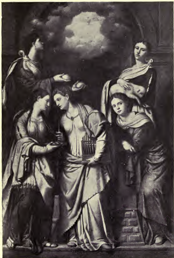
ST. AGATHA ST. LUCY