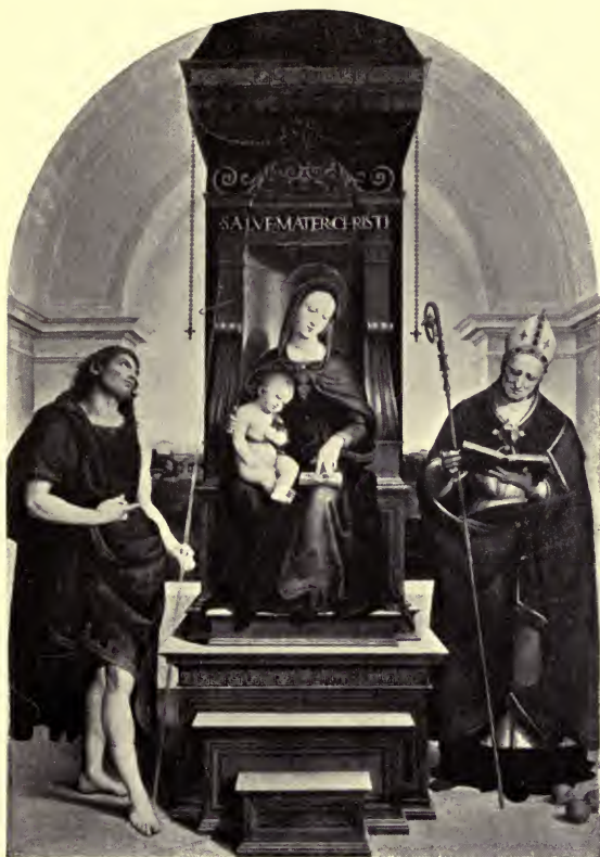
“MADONNA ANSIDEI” VIRGIN AND CHILD, WITH ST. JOHN THE BAPTIST AND ST. NICHOLAS OF BARI From the painting by Raphael in the National Gallery