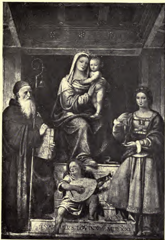
MADONNA AND CHILD WITH SS. ANTONY AND BARBARA From the painting by Bernardino Luti in the Brera, Milan