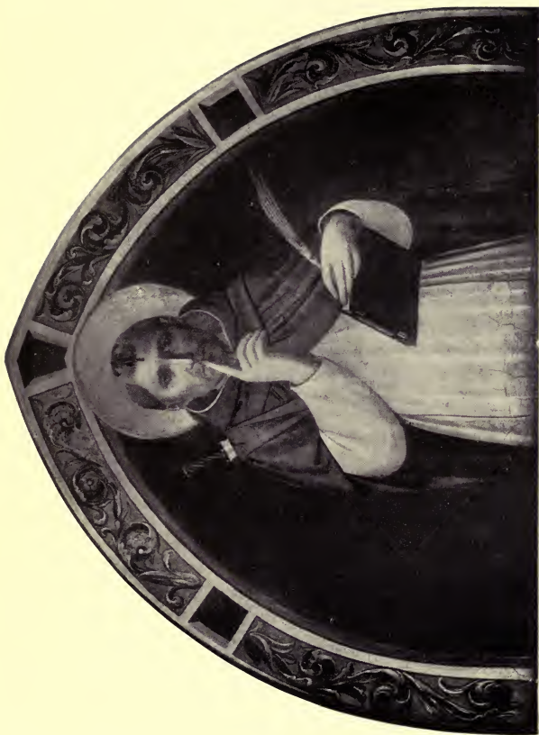
ST. PETER MARTYR

From the painting by Fra Beato Angelico in the Museum of St. Mark, Florence