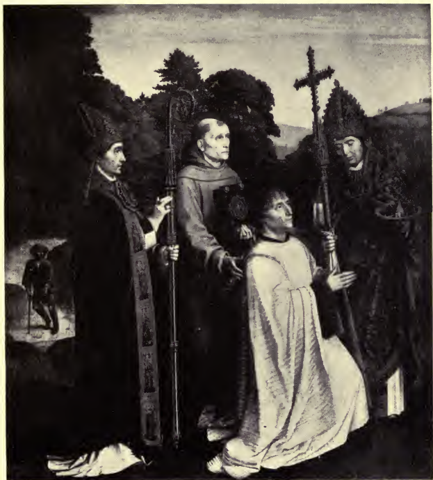
A CANON WITH ST. MARTIN, ST. DONATIAN AND ST. BERNARDINO From the painting by Ghereaert David, in the National Gallery