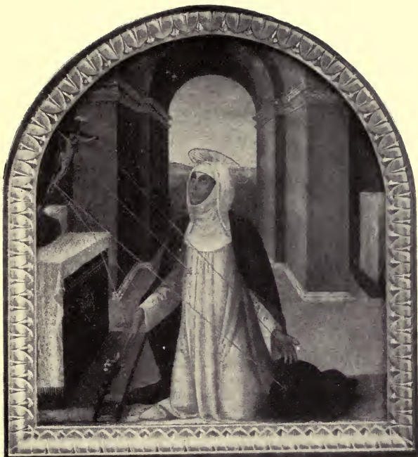
ST. CATHERINE OF SIENA

From the painting by Sano di Pietro at Siena