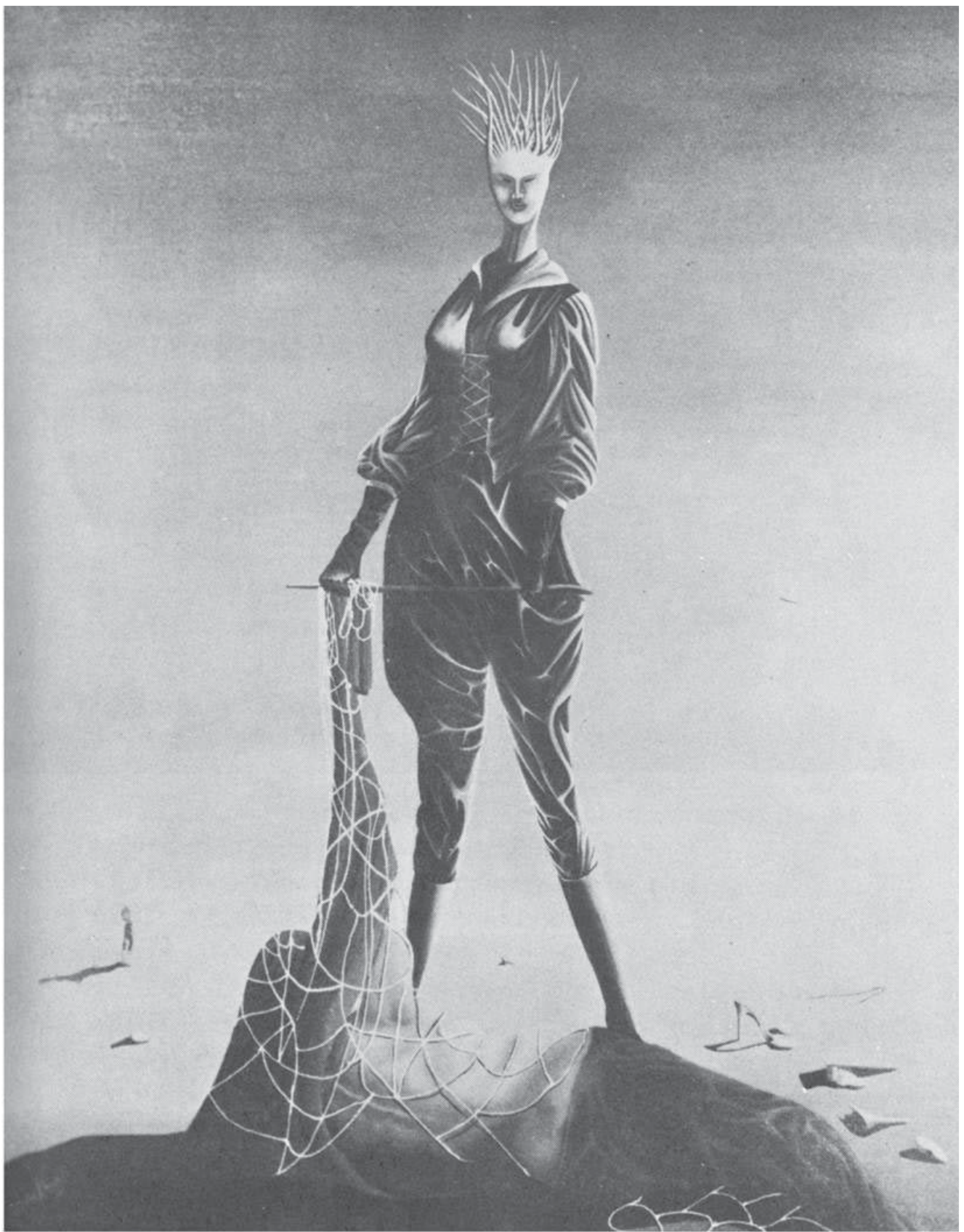
The oil painting reproduced above is part of a famous art collection in New York. This particular painting was done by a famous Spanish artist and shows a number of fetich garments being worn by the model.