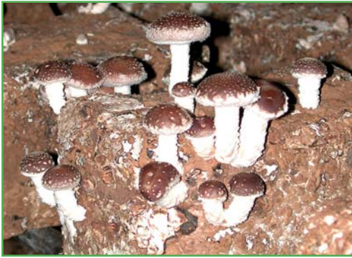
Figure 4. Hokken 600, a related strain

highly desirable shiitake strain, Hogan 101 in 1990 (Fig. 4). This fast-growing strain of shiitake has a firmer flesh and produces a higher yield than other available shiitake strains.