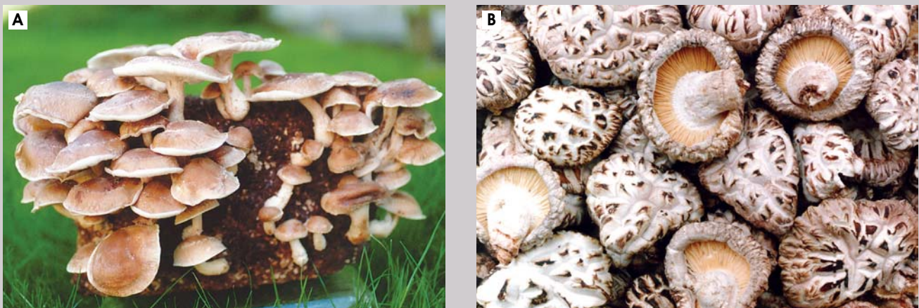
Figure 2. Consumer preference A: Light-colored shiitake B: Dried flower shiitake with white cracks on the cap (Jang-heung, Korea)

as the black forest mushroom. In France, it is known as lectin. In China, different forms of shiitake are known by various names such as xiang-gu, the fragrant mushroom, dong-gu, the winter mushroom, and hua-gu, the flower mushroom or variegated mushroom (Chen, 2001). This abundance of different local common names for the same species illustrates the importance of having a universal name that everyone understands. The scientific name for shiitake is Lentinula edodes (Berkeley) Pegler. Based on macro- and micro- morphological characteristics as well as other features including DNA analysis, L. edodes is classified in the genus of Lentinula , the family of Tricholomataceae , the order of Agaricales , and the subphylum of Basidiomycotina .