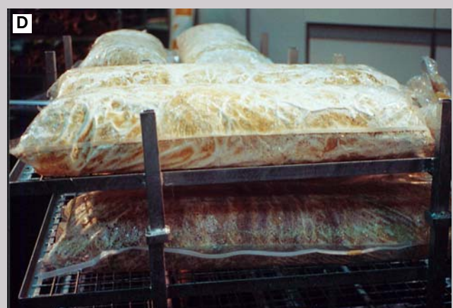
Figure 5. Various methods of shiitake cultivation A: Log cultivation B: Cylindrical synthetic log C: Sawdust substrate block D: Sawdust slate