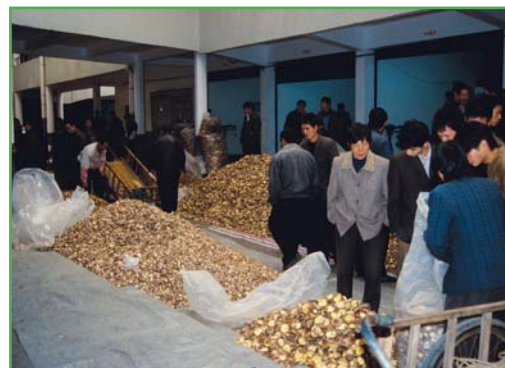
Figure 6. Market for dried shiitake in Qingyuan, China

In the light of the mission of MushWorld of alleviating hunger in poverty-stricken regions in the world by encouraging the cultivation of mushrooms, the study of shiitake production in Qingyuan county could be interesting. Qingyuan in China, declared by Chinese government as “Shiang-Gu city of China,” was the birth place of spontaneous shiitake log cultivation in 1100 A.D.. The county of Qingyuan is located in a warm monsoon climate. Such a climate is considered ideal for shiitake production at high elevations. Sixty percent of the population of less than 200,000 in Qingyuan county engage directly in growing shiitake. Today the majority of the farmers (80%) use sawdust for growing shiitake. The production of shiitake has increased from 2,765 tons in 1986 to 106,500 tons in 1997. The total value of mushroom production in 1997 reached USD46.3 million. Qingyuan is now one of the richest counties among some 3,000 counties in China. The flourishing of the economy in Qingyuan is solely due to the cultivation and marketing of shiitake. The assistance of the local government in creating a trading floor has played an important role in the growth of the shiitake industry (Chang and Miles, 2004).