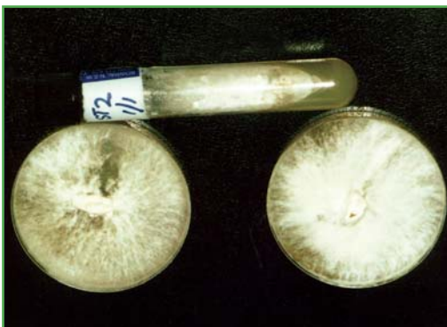
Figure 1. Shiitake culture

Native to the Far East, shiitake have been found in the wild only in such places as China, Japan and Korea until recently. Two recent findings of shiitake in natural habitats in the United States could have originated from disposed fibrous stems of fresh shiitake. Mushrooms that grow primarily in temperate climates, shiitake grow singly or in clusters in declining or dead hardwoods, in particular, Shii ( Pasania spp.), oaks ( Quercus spp.), and other Asian oaks and beeches (Stamets, 2000). In nature, shiitake are saprophytic 1 white-rot fungi that degrade woody substrates containing recalcitrant, hard to decompose, lignin components. It is due to this capacity that wood logs and sawdust are now used as substrates to cultivate shiitake.