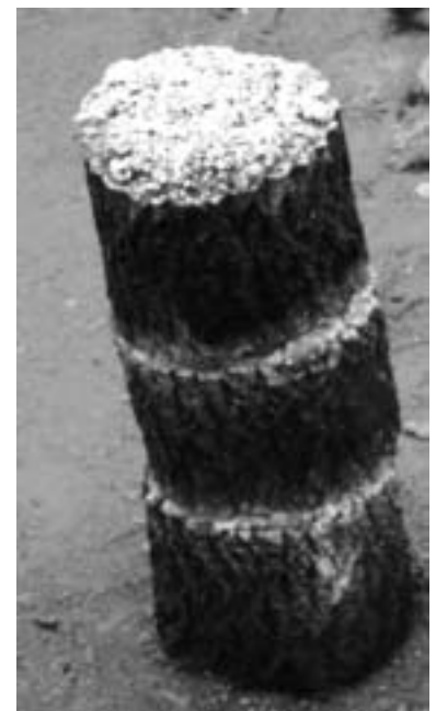
Figure 11. Spawn run

It is smart to follow up inoculation right after sterilization and cooling of the substrate to avoid uninvited contamination (Chen and Moy, 2004). New growers may not be aware that the air is full of contaminants such as uninvited fungal and bacterial spores. Inoculate under a hood in a clean place. There are two ways for spawning: “through spawning” and “localized spawning.” Through spawning involves mixing the spawn throughout the entire sterile substrate, by shaking for instance, while localized spawning involves depositing the spawn on top or on the sides of the substrate block. The choice of spawning procedures should be based on the following desirable characteristics. Growers should seek the lowest possibility of contamination by uninvited microorganisms, the highest speed for inoculation, the greatest ease for handling, the least amount of labor, the most cost-effective methods, the grower’s preference, and a fast spawn run.