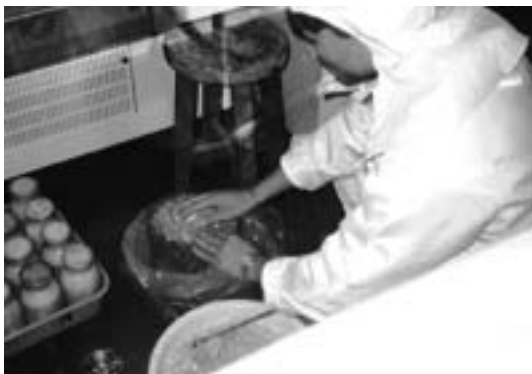
Figure 10. Spawning

Spawn is the seed inoculum used to inoculate the sterilized substrate after cooling. Many growers use grain spawn, while some prefer liquid spawn. There are also sawdust-bran spawn, dowels, skewers and grooved woody plug spawn. Choose spawn from the best strain with the most desirable qualities, including good genetic traits, stability, production of quality