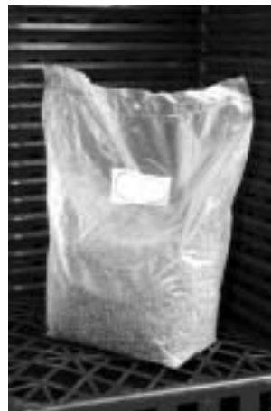
Figure 5. Heat-sealed bags with microfilter windows

Synthetic logs are made by filling the bags (heat resistant polypropylene or polyethylene) with the chosen substrate. For G. lucidum , a sawdust-bran substrate with supplements is generally used. Check the formulation of recommended substrates in Table 2 and 3. Using heat-sealed bags with microfilter windows, substrate is usually fills two thirds of the bags to leave air space for ventilation. The substrate is sterilized