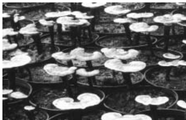
Figure 13. short logs embedded with top soil in nursery pots