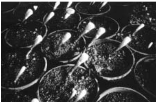
Figure 12. Tips of young mushrooms about to form caps

Embed the colonized logs directly in soil after primordia formation, leaving the primordia above ground. Then cover the soil with chopped straw to retain moisture. During fruiting, at the primordia stage, the colonized logs become resistant to microbial contamination in the non-sterile soil (Chen, 1996b). Embed the short logs vertically, with the cut surface where spawning is applied facing upwards. Soil with good drainage, such as sandy soil, should be used. Following is an example: embed only 16-21cm or 9/10th of the log in soil, leaving well-formed primordia above ground (Chen and Chao, 1997). Log moisture can be better conserved by burying the logs in soil. Embedding logs in soil also enables mushroom mycelia to absorb nutrients, particularly minerals and trace elements from the soil. Soil-buried log cultivation can be done in easily-constructed mushroom houses. Within the mushroom house, low loop frames with covers usually in 2 rows, are routinely set up. Alternatively, soil-buried log cultivation of Ganoderma species can also be carried out in the open air in the wild.