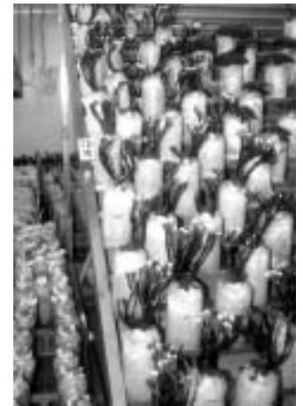
Figure 7. Antler-shaped fruit bodies

The most crucial management practice during pileus differentiation (the specialized growth for mushroom cap development) is to increase ventilation to reduce CO 2 concentration, along with high humidity and diffused dim light. When the temperature is too high, the fruiting bodies produced are very thin and of poor quality. Differentiation of Ganoderma fruiting is highly sensitive to CO 2 concentrations as these will determine whether antler-shaped fruiting bodies (CO 2 > 0.1%), or fruiting bodies with well-formed caps (CO 2 < 0.1%) will be produced. Fresh air contains 0.03% CO 2 . Aim for reducing CO 2 to 0.04-0.05%, as close to fresh air as possible, for the production of mushrooms with caps (Table 5). Humidity is provided by fine mist 1-2 or 3-4 times per day.