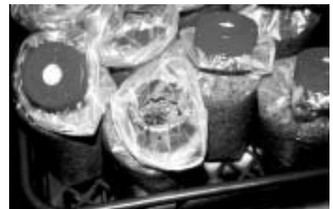
Figure 6. Cylindrical bags with plugs