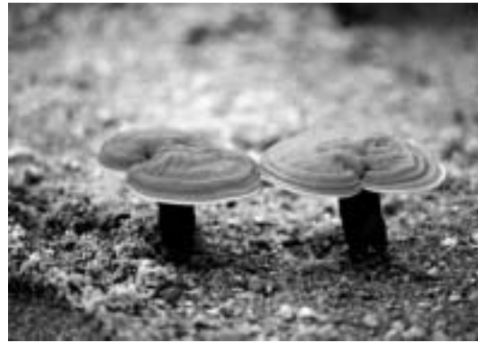
Figure 15. Ganoderma with further cap growth