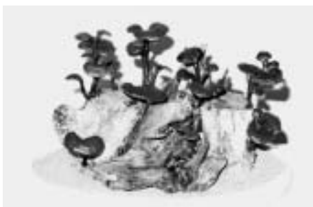
Figure 2. Ganoderma bonsai

Best known as an immune system enhancer and modulator with health benefits, G. lucidum is generally safe for long-term use. The LD 50 (lethal dose to kill 50% of the study subject) for a single intraperitoneal injection dose of Ganoderma extract in rodents was as high as 38g/kg. The LD 50 of a water-soluble polysaccharide fraction of G. lucidum in rodent was higher than 5g/kg. Since the toxic/lethal doses in rodent are quite high relative to conventional human dosages, they do not indicate significant limitations for clinical dosages of Ganoderma (Chang, 1995).