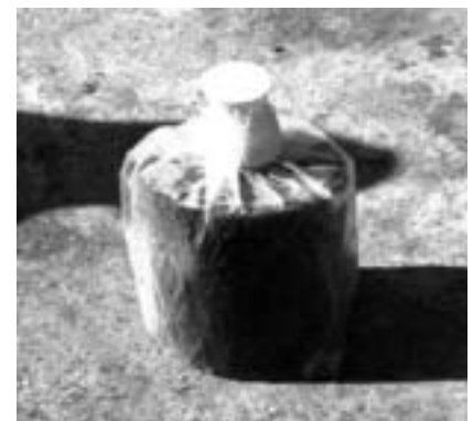
Figure 9. Short log in the bag before sterilization

Enclose logs singly in each bag, or two logs end to end in a bag having a diameter slightly larger (> 15cm in diameter), and a length of 25-50cm. Sterilize logs in bags at high pressure (1.5kg/cm 2 ) for 1.5 hours or at normal air pressure, or 100°C for 10 hours. Heat-sealed polypropylene or polyethylene bags with microfilter windows can be used. Permeation of air exchange of such bags is regulated by the size, shape, number, locality and nature of the microfilter on each bag, as well as air space above the colonized substrate in the enclosed bag.