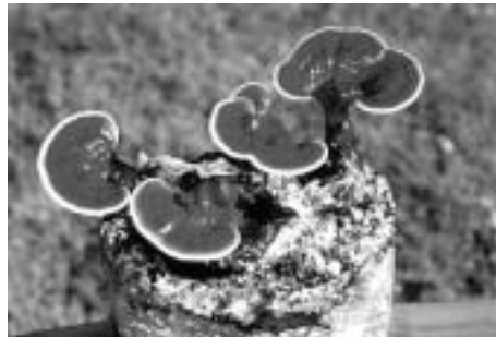
Figure 3. Reddish strain with a distinct white margin on synthetic log

It is crucial for both new and experienced growers to understand the features and qualities of the best strains. This knowledge gives a grower a good head start. The choice of a proper strain can determine success or failure. For growing G. lucidum to be used for their medicinal benefits, there are good strains from Japan, China, Korea and North America.