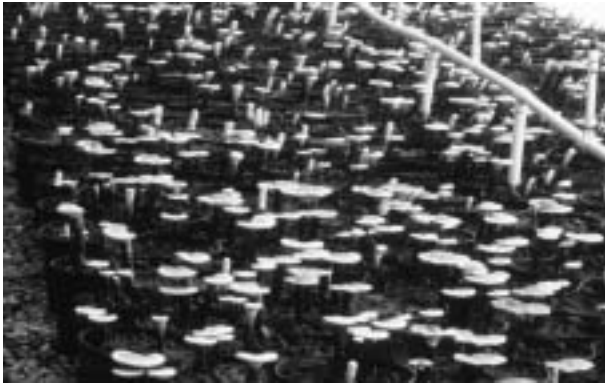
Figure 14. Ganoderma mushroom growing on Short logs