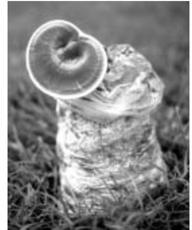
Figure 4. Yellowish brown strain with a growing edge on its cap margin