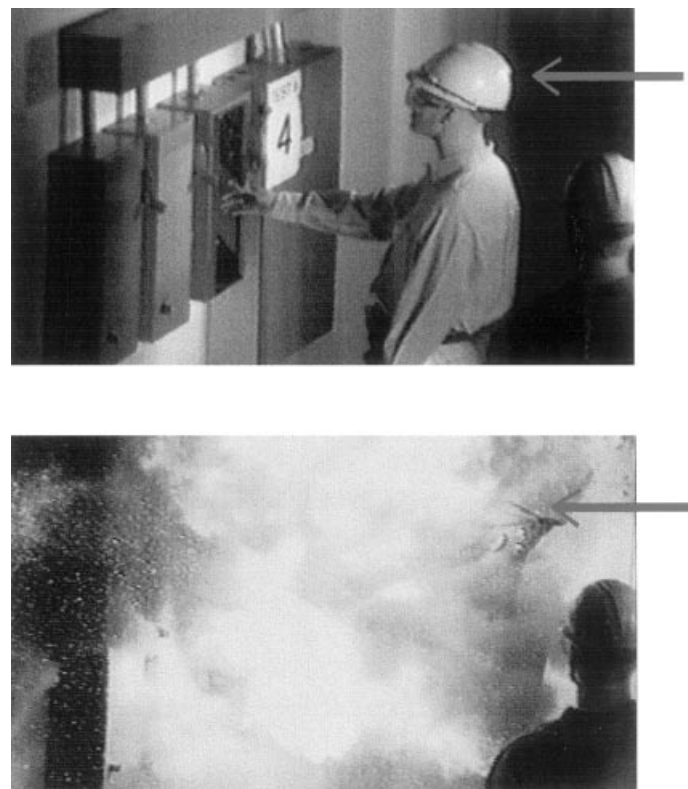
Figure 1. Staged electric shock incident. Physical contact by a screwdriver held in the mannequin worker hand (top) resulted in an electric shock and arc blast event with a characteristic flash of ionized highly conducting arc plasma.

Electric shock victims are generally categorized as "true" electrical injuries if there are focal contact wounds providing evidence of a current path into the body. They may be referred to as "flash" victims if there are skin burns on exposed surfaces and no focal contact wounds. Again, it must be kept in mind that the electric arc plasma which burns the skin of "flash" survivors is an excellent electrical conductor. Victims in the "flash" group can experience electrical effects just as victims of lightning contacts can. Even though temperatures for arcs range between 7000°C and 22,000°C, a brief (<10 ms) arc exposure of the body transmits only enough heat energy to cause a partial-thickness skin burn. This result occurs because water (a main constituent of the body) has a density