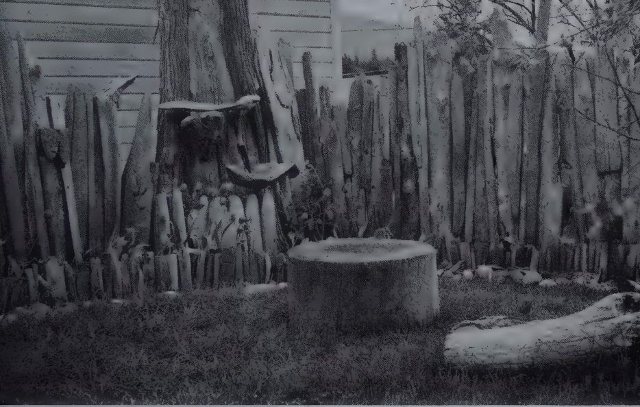
The St. Francis Grotto, adjoining Outlook Inn