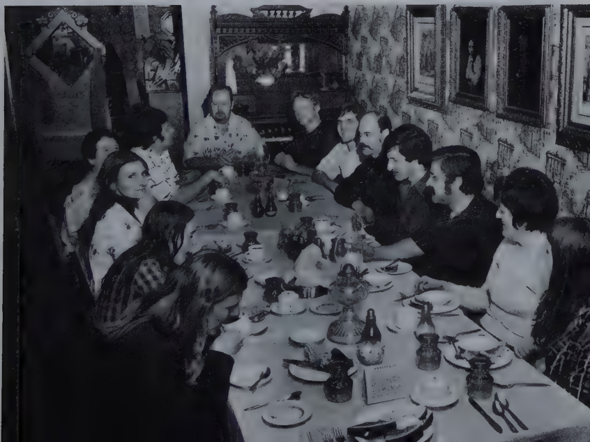
A typical evening gathering of the Foundation in the Outlook Inn dining room