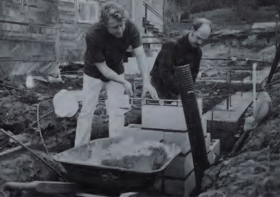
Ongoing work at the Foundation: adding rooms to Outlook Inn