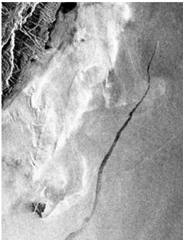
Figure 1 Radar image acquired by the synthetic aperture radar (SAR) aboard the First European Remote Sensing satellite (ERS-1) on 20 May 1994 over the coastal waters east of Taiwan. The imaged area is 70 km \times 90 km. It shows a ship (the bright spot at the front of the black trail) discharging oil. The oil trail, which is approximately 80 km long, widens towards the rear because the oil disperses with time.

can be obtained independent of the time of the day and independent of cloud conditions. This makes radar an ideal instrument for detecting oil pollution and natural surface films at the sea surface. Consequently, most oil pollution surveillance aircraft which patrol coastal waters for locating illegal discharges of oil from ships are equipped with imaging radars.