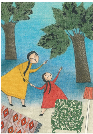
Art by Judith Clay from Thea's Tree

Beneath the mystery lay a fascinating frontier of scientific research, which would eventually reveal that this tree was not unique in its assisted living. Neighboring trees, scientists found, help each other through their root systems — either directly, by intertwining their roots, or indirectly, by growing fungal networks around the roots that serve as a sort of extended nervous system connecting separate trees. If this weren't remarkable enough, these arboreal mutualities are even more complex — trees appear able to distinguish their own roots from those of other species and even of their own relatives.