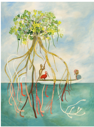
Art by Cécile Gambini from Strange Trees by Bernadette Pourquié

branch tips of a neighboring tree of the same height. It doesn't grow any wider because the air and better light in this space are already taken. However, it heavily reinforces the branches it has extended, so you get the impression that there's quite a shoving match going on up there. But a pair of true friends is careful right from the outset not to grow overly thick branches in each other's direction. The trees don't want to take anything away from each other, and so they develop sturdy branches only at the outer edges of their crowns, that is to say, only in the direction of "non-friends." Such partners are often so tightly connected at the roots that sometimes they even die together.