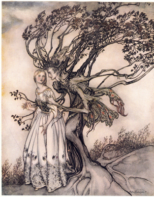
Illustration by Arthur Rackham for a rare 1917 edition of the Brothers Grimm fairy tales

astonishing language of trees and how trailblazing arboreal research from scientists around the world reveals “the role forests play in making our world the kind of place where we want to live.” As we’re only just beginning to understand nonhuman consciousnesses , what emerges from Wohlleben’s revelatory reframing of our oldest companions is an invitation to see anew what we have spent eons taking for granted and, in this act of seeing, to care more deeply about these remarkable beings that make life on this planet we call home not only infinitely more pleasurable, but possible at all.