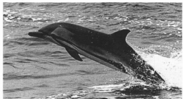
FIG. 1. Stenella coeruleoalba from the eastern Pacific near California.

GENERAL CHARACTERS. The general body plan of S. coeruleoalba is similar to that of most small oceanic delphinids: a largely fusiform body with a long beak (well demarcated from the melon), falcate dorsal fin, and long, slim flippers. It is a relatively robust dolphin; the longest recorded specimen reaching 2.56 m