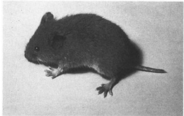
FIG. 2. Juvenile heather vole, Phenacomys intermedius . Photograph from a slide by Murray L. Johnson.

FOSSIL RECORD. The fossil record of Phenacomys extends to the middle Pleistocene (Irvingtonian) in most of North America (Martin et al., 1986), and to the Pliocene in Beringia (Repenning et al., 1987). Phenacomys intermedius currently is restricted to boreal habitats; thus it is considered to be a good indicator of past climates. All fossil specimens of P. intermedius known to Guilday and Parmalee (1972) were individual molars or tooth rows. Identification to species is difficult; the variability within the species is large enough to mask specific differences. Guilday and Parmalee