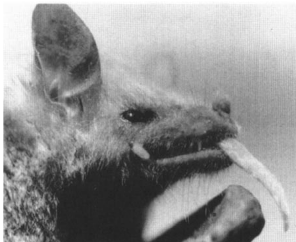
FIG. 1. Side view of facial region of Leptonycteris nivalis showing long protrusible tongue and bat fly ventral to eye. Specimen from Big Bend National Park, Texas, photographed in 1967 by D. A. Easterla.

Means for three external measurements (in mm) are: total length, 83; length of foot, 17; and length of ear from notch, 15 (Davis, 1974). Means and extremes of cranial measurements (in mm) for three adult males followed in parentheses by those for seven adult females from Texas and Mexico are (Davis and Carter, 1962): condylobasal length, 27.1, 26.5 to 28.0 (27.2, 26.2 to 28.3); zygomatic breadth, 11.4, 10.7 to 12.0 (11.3, 10.9 to 11.6); inter-orbital width, 5.3, 5.3 to 5.4 (5.1, 4.3 to 5.4); mastoidal breadth, 12.0, 11.5 to 12.5 (11.8, 11.5 to 12.0); length of palate from alveolus, 14.5, 14.0 to 15.0 (14.5, 13.3 to 15.3); maxillary tooth-row, 9.2, 8.9 to 9.6 (9.2, 8.5 to 9.5); length of mandible 19.2, 18.5 to 19.7 (19.1, 18.2 to 20.3). Means for two other cranial measurements (in mm) for six males and eight females from Chisos Mountains, Brewster Co., Texas, are (Hoffmeister, 1957): greatest length of skull, 28.1, and width of braincase, 10.7. Mandibular