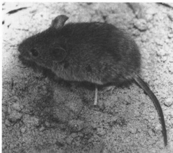
FIG. 1. The northern pygmy mouse ( Baiomys taylori taylori ).

FOSSIL RECORD. Seven fossil species have been described for the genus (Gidley, 1922; Hibbard, 1953; Packard, 1960; Packard and Alvarez, 1965; Zakrzewski, 1969). According to Hibbard