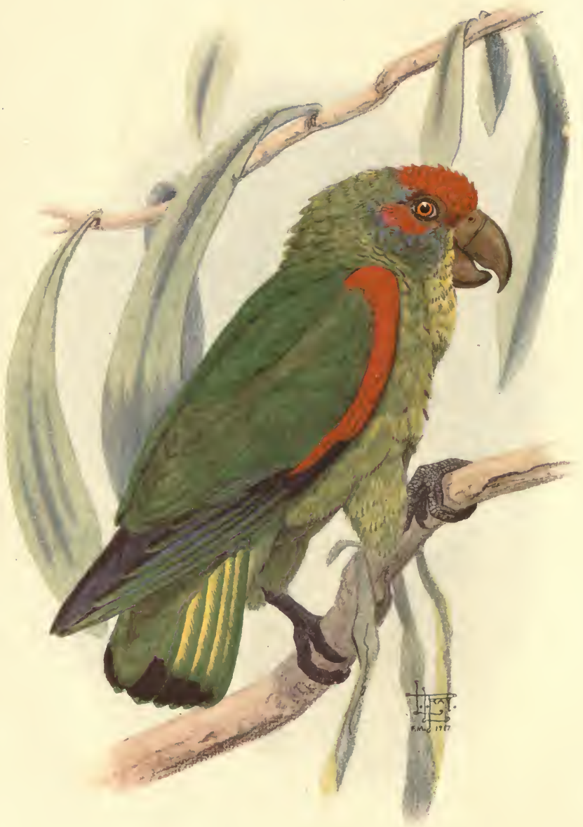
UROCHROMA COSTARICENSIS Cory