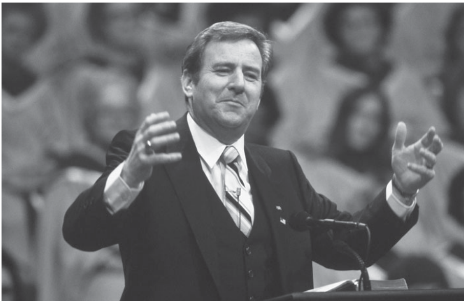
3. American TV evangelist Jerry Falwell in full fundamentalist flight