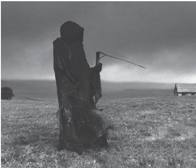
10. The Grim Reaper: a still from Monty Python's 'The Meaning of Life'

Freud set out by believing that the meaning of life was desire, or the ruses of the unconscious in our waking lives, and came to believe that the meaning of life was death. But this claim can have several different meanings. For Freud himself, it means that we are all ultimately in thrall to Thanatos , or the death drive. But it can also mean that a life which contains nothing for which one is not prepared to die is unlikely to be very fruitful. Or it can suggest that to live in an awareness of our mortality is to live with realism, irony, truthfulness, and a chastening sense of our finitude and fragility. In this respect at least, to keep faith with what is most animal about us is to live authentically. We would be less inclined to launch hubristic projects which bring ourselves and others to grief. An unconscious trust in our own immortality lies at the source of much of our destructiveness.