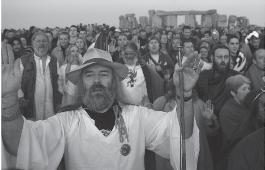
2. A 'New Age' gathering at Stonehenge