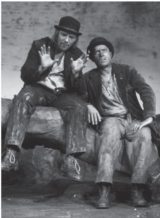
8. Vladimir and Estragon from Samuel Beckett's play Waiting for Godot