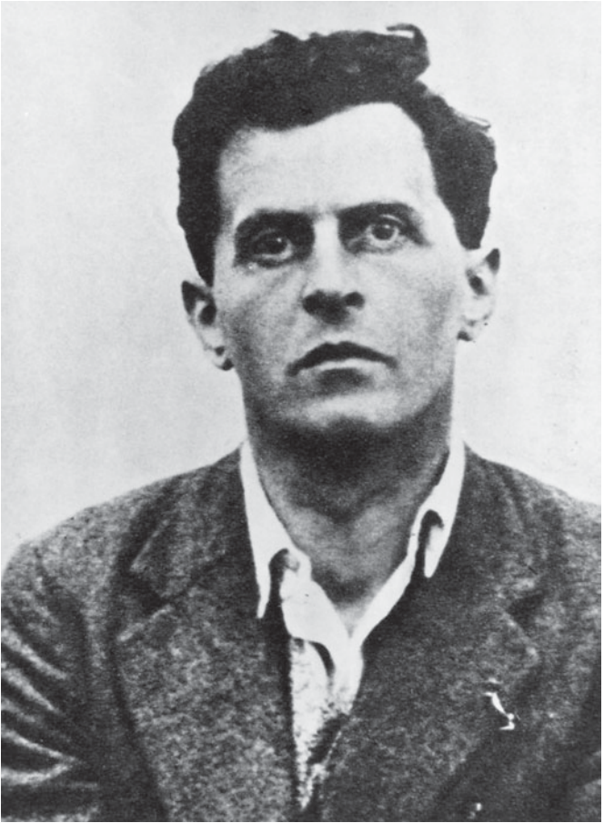
1. Ludwig Wittgenstein, commonly thought to be the greatest philosopher of the twentieth century