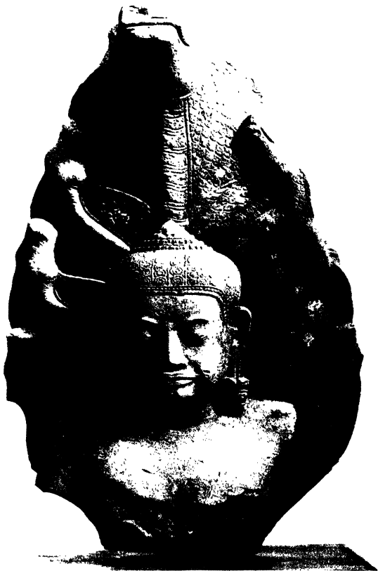
IV. Gautama Buddha, Cambodia, 11th century A.D.