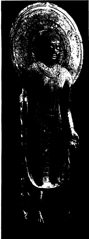
X. Gautama Buddha, Mathurā, 5th century A.D.