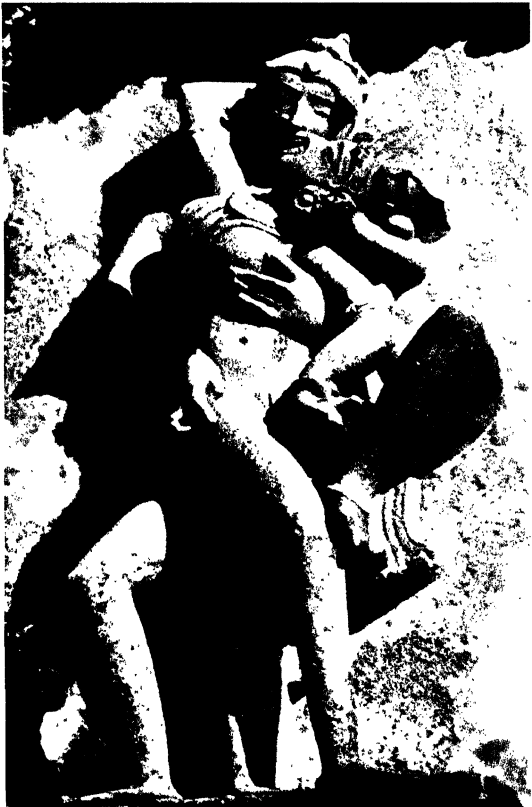
XI. Vīra and Sakti, Khajurāho, 10th century A.D.