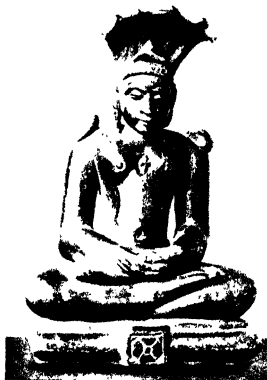
VIa. Pāśvanātha, West India, 16th or 17th century A.D.