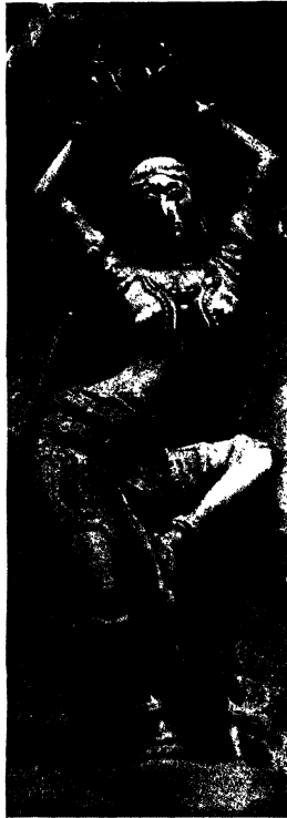
XII. Apsaras, Palampet, 12th or 13th century A.D.