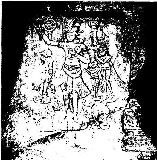
II Cakravartin, Jagayyapeta, 2nd century B.C.