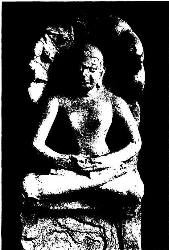
V. Pārśvanātha, Mathurā, 2nd century