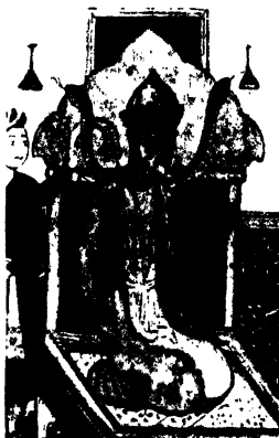
VIb. Dāhāk, Persia, 1602 A.D.