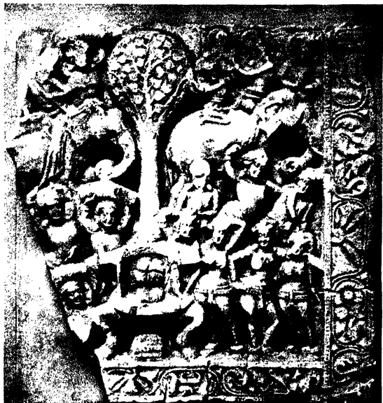
IX. The Assault of Māra, Amarāvati, 2nd century A.D.