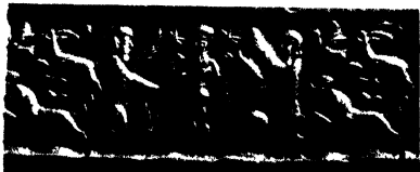
VIc. Syrian seal, c. 1150 B.C.