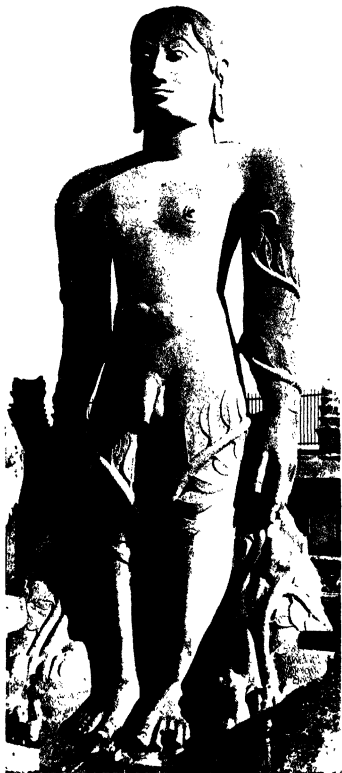
VIII Gommatas, Sravana Belgola, c. 989 AD