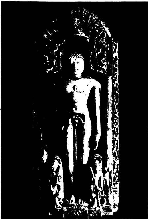
VII. Rṣabhanātha, Mount Ābū, 11th to 13th centuries A.D.