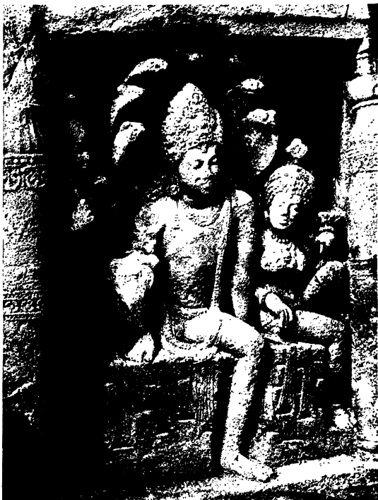
III. Nāga King and Queen, Ajaṅṭā, 6th century A.D.