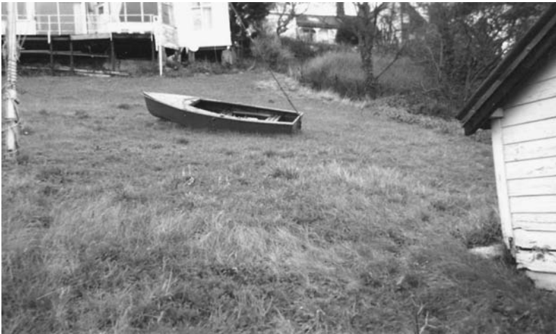
Figure 1 'Run Aground'

We left London to get away from all that and now it's following us out. (Roy, retired, 80s)