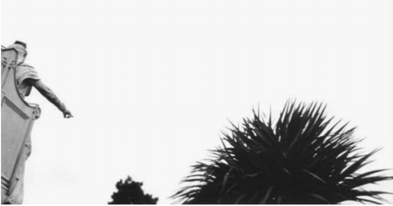
Figure 2 'In Exile'