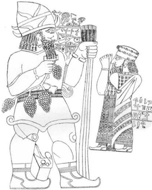
KING KON, GAN, "CAIN" OR "TUBAL CAIN" OR BAUGE (BACCHUS) OR THIO (DIONYSOS), THIAZZI OR TASCIO OR TASHUB AS INVENTOR OF THE PLOUGH.