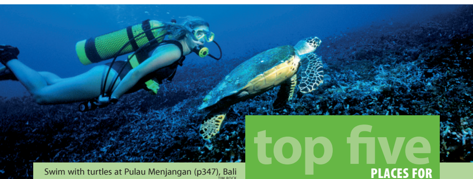
Swim with turtles at Pulau Menjangan (p347), Bali TIM ROCK