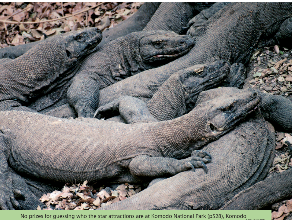
No prizes for guessing who the star attractions are at Komodo National Park (p528), Komodo