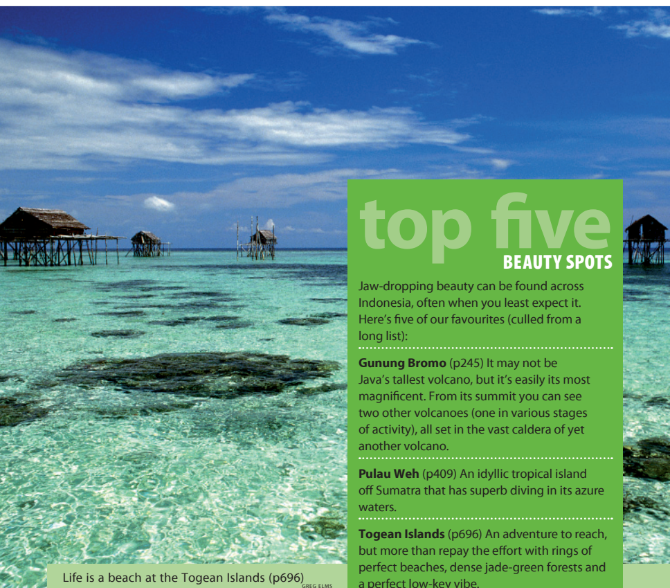
Life is a beach at the Togean Islands (p696)