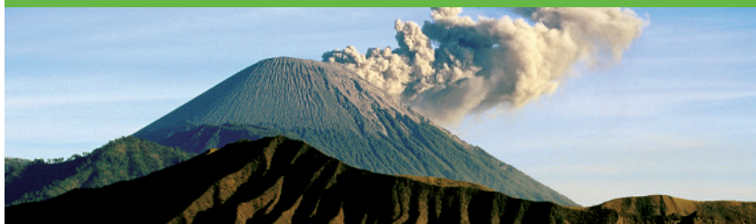
Visit the steaming Gunung Semeru (p248), one of Indonesia's most active volcanos, Java