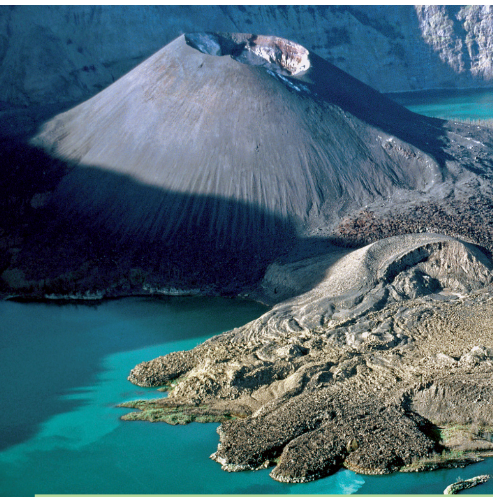
Stand in awe beneath Indonesia's second-largest volcano, the classic Gunung Rinjani (p506), Lombok