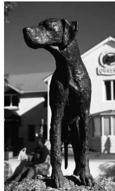
Statue of Just Nuisance (above), Simon's Town

Definitely one for naval enthusiasts, this museum nonetheless has plenty of interesting exhibits, including a mock submarine, that let you play out boyish adventure fantasies.