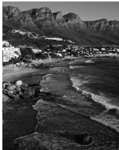
Beach, Clifton (above)

Giant granite boulders split the four linked beaches at Clifton, accessible by steps from Victoria Rd. Almost always sheltered from the wind, they are top sunbathing spots, despite the lack of local facilities. On Monday night African drummers and fire dancers have been known to gather here, although in January 2006 the crowds had grown so large that police waded in to break up the fun (see p54). Local lore has it that No 1 and No 2 beaches are for models and confirmed narcissists, No 3 is the gay beach, and No 4 is for families. If you haven't brought your own supplies, vendors hawk drinks and ice creams along the beach, and you can hire a sun lounge and umbrella for around R50.