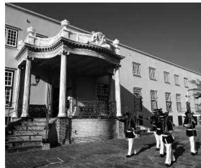
Castle of Good Hope (above)

Many visitors are quite surprised to find a castle in Cape Town. Built between 1666 and 1679 by the Dutch, the stone-walled pentag-