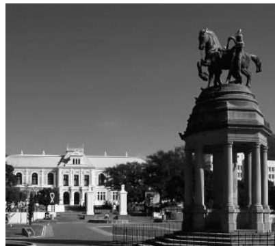
Delville Wood Memorial (p93) and the South African Museum (opposite)

Across the courtyard from the museum's exit is a good gift shop and the kosher Café Riteve . In the auditorium beneath the Cape Town Holocaust Centre, make sure you see the 20-minute documentary film A Righteous Man about Nelson Mandela's connection with the South African Jewish community.