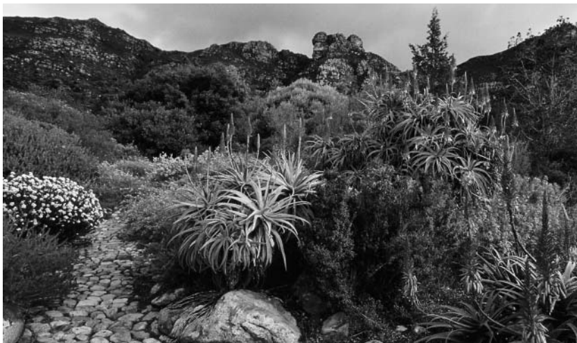
Kirstenbosch Botanical Gardens (p105)

The Dutch were not greeted with open arms by either the San (later to be called Bushmen by the European settlers) or the Khoikhoi (likewise called Hottentots); intermittent hostilities broke out. In 1660, in a gesture that took on an awful symbolism, Van Riebeeck planted a wild almond hedge to protect his European settlement from the Khoisan. The hedge ran around the western foot of Table Mountain down to Table Bay, and a section of it can still be seen in the Kirstenbosch Botanical Gardens (p105). The irony was that contact between the Europeans and the Khoisan would prove far more dangerous for the locals, who were mortally vulnerable to the guns and diseases of the colonists.