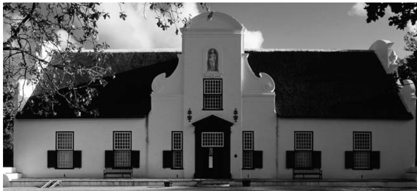
Manor house, Groot Constantia (above)

This rustic, 300-year-old estate with several fine Cape Dutch buildings is known for its excellent red wines, particularly its cabernet sauvignon and zinfandel. Cellar tours are by appointment and lunch is available (call for times, as they change according to the season). It's a good one for kids on weekends when it has horse-and-carriage rides around the estate (R10).