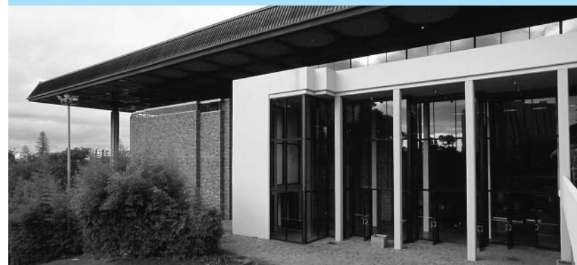
Baxter Theatre (p146), Rondebosch