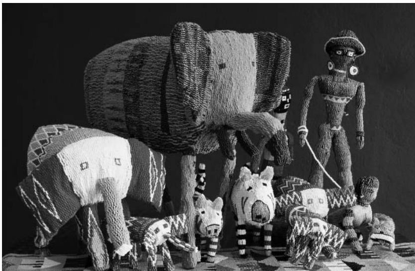
Crafts, Monkeybiz (p162), Bo-Kaap