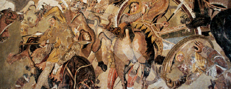
Pompeii's La Battaglia di Alessandro Contro Dario mosaic, now in Museo Archeologico Nazionale