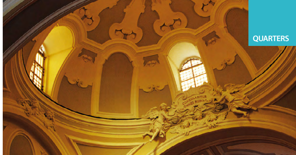
Decorative dome inside the Chiesa San Giovanni a Carbonara

Dedicated botanists will be impressed with an oxygen-rich collection of plants from the major American, African, Asian and Australian deserts, an arboreal fern section and an ancient citrus orchard.