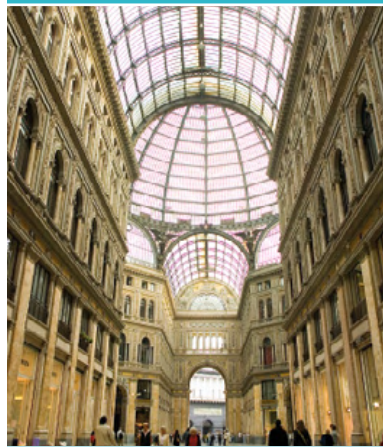
Galleria Umberto I