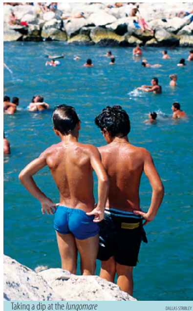
Taking a dip at the lungomare

☎ 081 66 92 94; Via Santa Maria in Portico 17; ☎ 8-11am & 4.30-7pm; 🚶 C25 to Riviera di Chiaia Craving baroque? This 17th-century church should hit the spot. Check out the fabulous