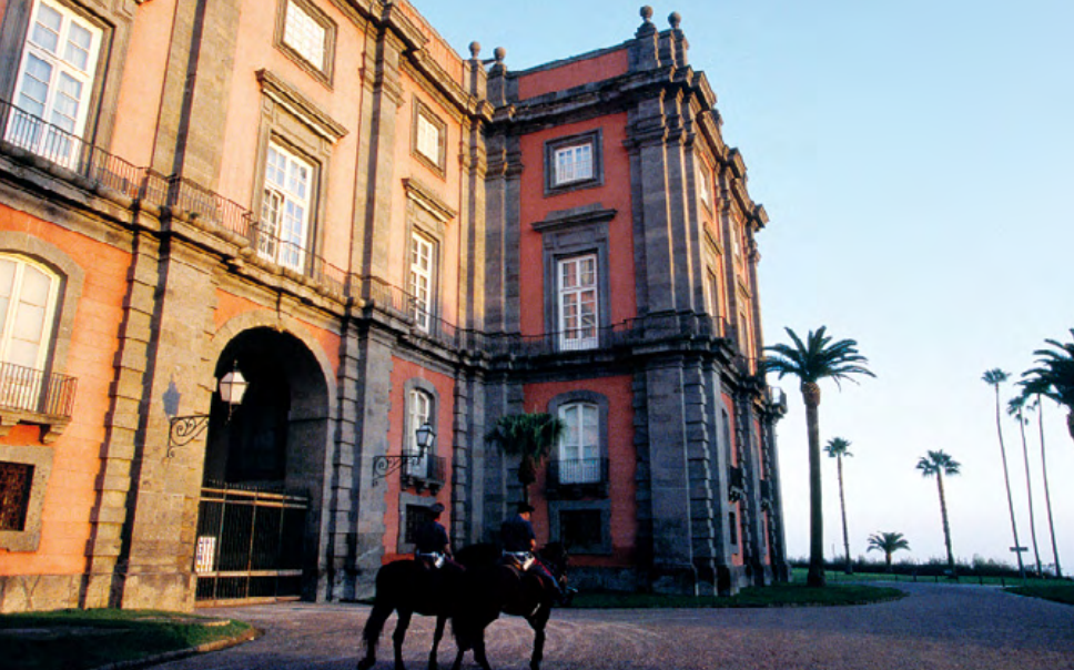
Palazzo Reale di Capodimonte