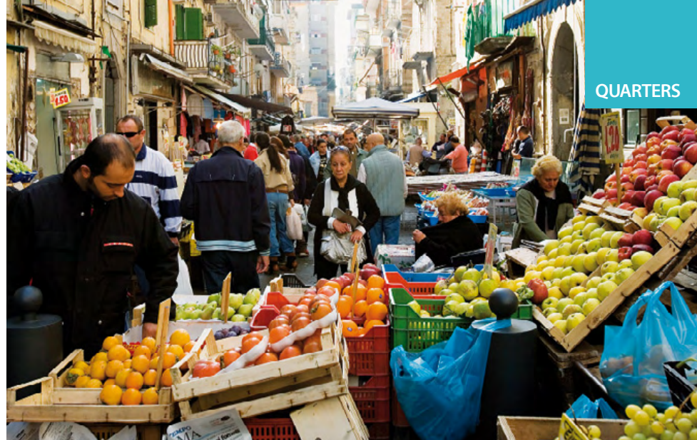
Porta Nolana market

The square sits at the easternmost point of the city's old medieval wall. To the north