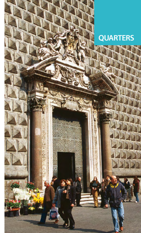
High-impact façade, Chiesa del Gesù Nuovo

Rudely giving its back to the Piazza, this vast Gothic number features a double flight of marble steps leading up to the apse. Completed in 1324 on the orders of Charles I of Anjou, it was built onto the medieval church