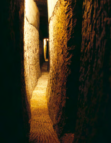
Narrow passages characterise underground Naples