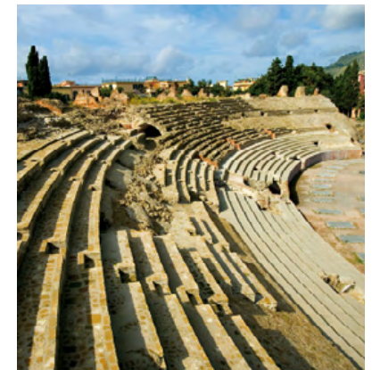
The ancient Anfiteatro Flavio

The third-largest amphitheatre in Italy, the Anfiteatro Flavio could hold over 20,000 spectators and was occasionally flooded for mock