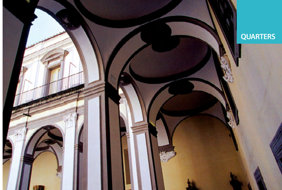
Under the archways of Chiesa di San Lorenzo Maggiore

Back upstairs, the recently opened Museo dell'Opera di San Lorenzo Maggiore houses a fascinating collection of local archaeological finds, including Graeco-Roman sarcophagi, ceramics and crockery from the digs below. Other treasures include vivid 9th-century ceramics, Angevin frescoes, paintings by Giuseppe Marullo and Luigi Velpi, and camp ecclesiastical drag for 16th-century bishops.