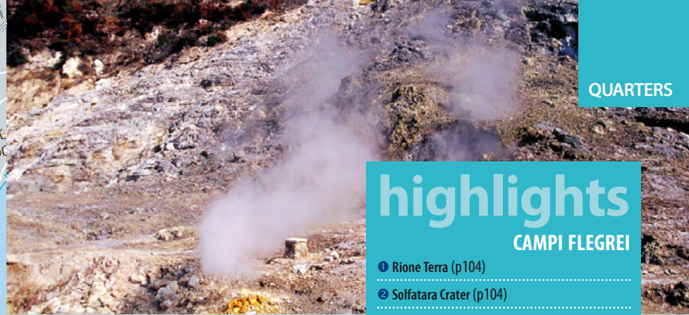
Solfatara Crater (p104), Pozzuoli

Before exploring the area it's worth stopping at the tourist office (☎ 081 526 66 39; Piazza G Matteotti 1a; 🕒 9am-2pm & 2.30-3.40pm Mon-Fri Oct-May, 9am-1pm & 4-7.30pm daily Jun-Sep) in Pozzuoli to pick up a copy of the very useful leaflet Welcome to the Campi Flegrei . Also a good idea is the €4 cumulative ticket that covers the Tempio di Serapide and the archaeological sites of Baia and Cuma.