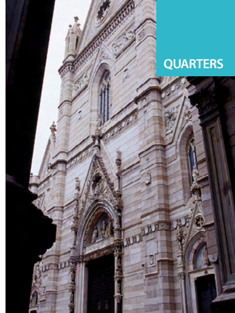
View through to the Duomo

On the north aisle the Basilica di Santa Restituta sits one of Naples' oldest basilicas, dating to the 4th century. Incorporated into the main cathedral, it was subject to an almost complete