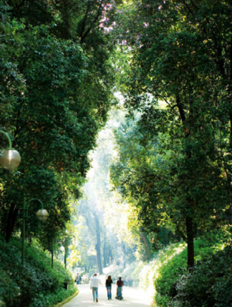
In the park at Villa Floridiana