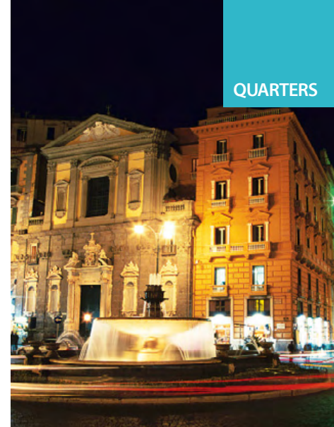
The illuminated Piazza Trieste e Trento

Rising up behind Piazza del Plebiscito, Monte Echia is the oldest part of Naples, once forming the ancient city of Parthe-