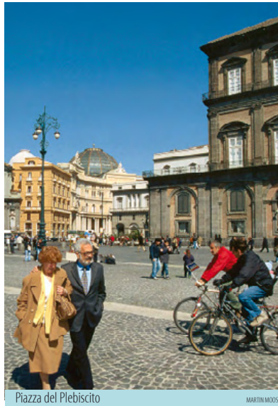
Piazza del Plebiscito

Facing the church is the Palazzo Reale (p85), with its eight statues of past kings. The royal theme continues centre square with Antonio Canova's statue of a galloping Bourbon king Charles VII and a nearby statue of his son Ferdinand I by Antonio Calì.