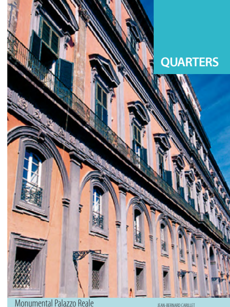
Monumental Palazzo Reale

Snigger smugly in Sala (Room) XII, where the 16th-century canvas Gli Esattori delle Imposte (The Tax Collectors) by Dutch artist Marinus Claesz Van Roymerswaele confirms that attitudes to tax collectors have changed