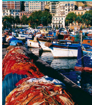
Porticciolo at Mergellina (p101)