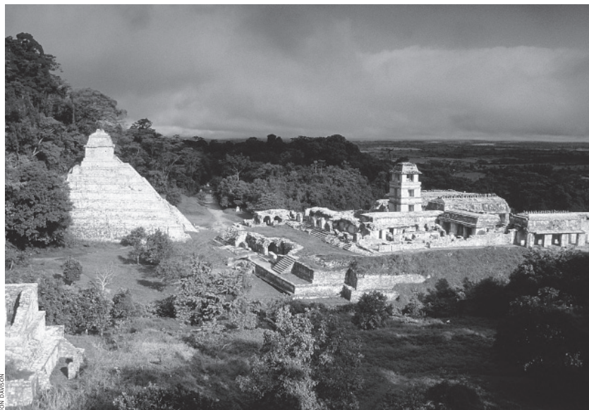
The Maya city of Palenque (p57) surrounded by verdant rain forest, Chiapas, Mexico

Easy to overlook on a map, this compact seven-country link between North and South America is a dynamo of culture, ancient ruins, wildlife and activities – a true backpackers' paradise. Nowhere else packs in as much in so slender a frame. For starters, try climbing trembling and lava-gurgling volcanoes – many perfect cones poke above the cloud line, like something out of a kindergarten drawing. Less-strenuous jungle walks lead past unforgettable, overgrown Maya pyramids or into the lairs of the puma, sloth, howler monkey and quetzal. Surfing towns are found up and down the Caribbean and Pacific shorelines, where waves slap at white- and gold-sand beaches. No excuses if you've never surfed; lessons are cheap. If you prefer getting under water, diving outfits can get you certified and bellying up with nurse sharks at coral reefs for some of the world's lowest prices. Don't fuss if you want to go somewhere other than a beach to relax. In lazy-day Spanish-colonial towns, haciendas transformed into language schools and hostels line cobbled streets where vendors in cowboy hats push squeaky-wheeled carts. Or you can arrange homestays in Maya or Mosquito villages, where many traditions live on as if the 'Conquest' were a bad dream.