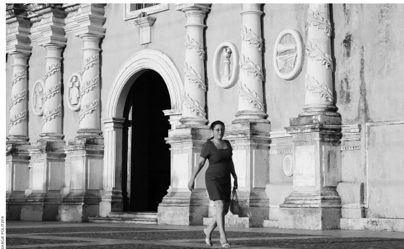
Sunshine highlights the baroque façade of the 18th-century Iglesia de la Recolectión (p482), León, Nicaragua

La Moskitia (Honduras) ■ This huge remote pocket of Honduras boasts canoe trips from Garífuna villages and frisky wildlife scenes, including sea turtles and hundreds of bird species (p429)