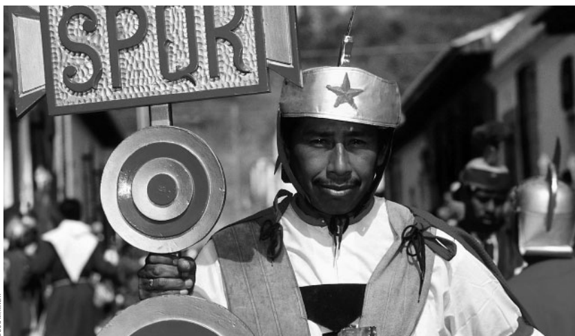
Ready for the colorful procession to mark Semana Santa (p109), Antigua, Guatemala