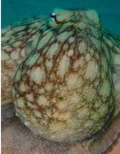
An octopus changes color to blend in with its surroundings

The little wall is a beautifully landscaped place with lots of sponge life, many small baitfish and trumpetfish roaming in and out of large growths of rope sponges. Macro critters like lettuce slugs and spotted cleaner shrimp on giant and corkscrew sea anemones make this a good place to narrow your focus. There are also spotted and golden morays in the various reef holes. Octopuses are also common here.