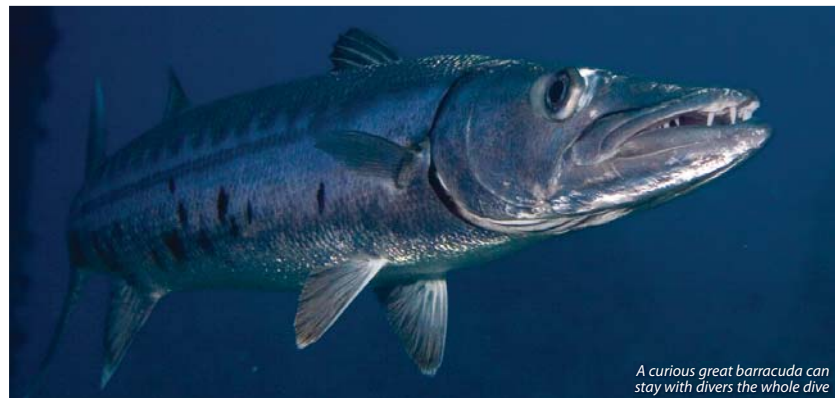
A curious great barracuda can stay with divers the whole dive

This is the house reef of the Plaza Hotel and can be dived by shore or by boat. This is also a nice snorkeling site. Entry is at one of the area's only sandy beaches