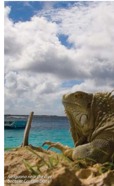
An iguana near the dive boats at Captain Don's