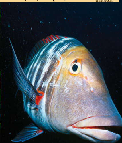
A Sweetlip Emperor eyes up dinner