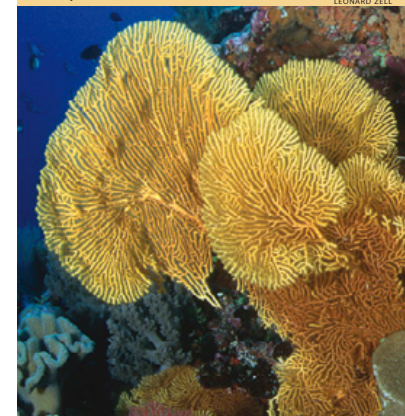
Cool sea fan coral