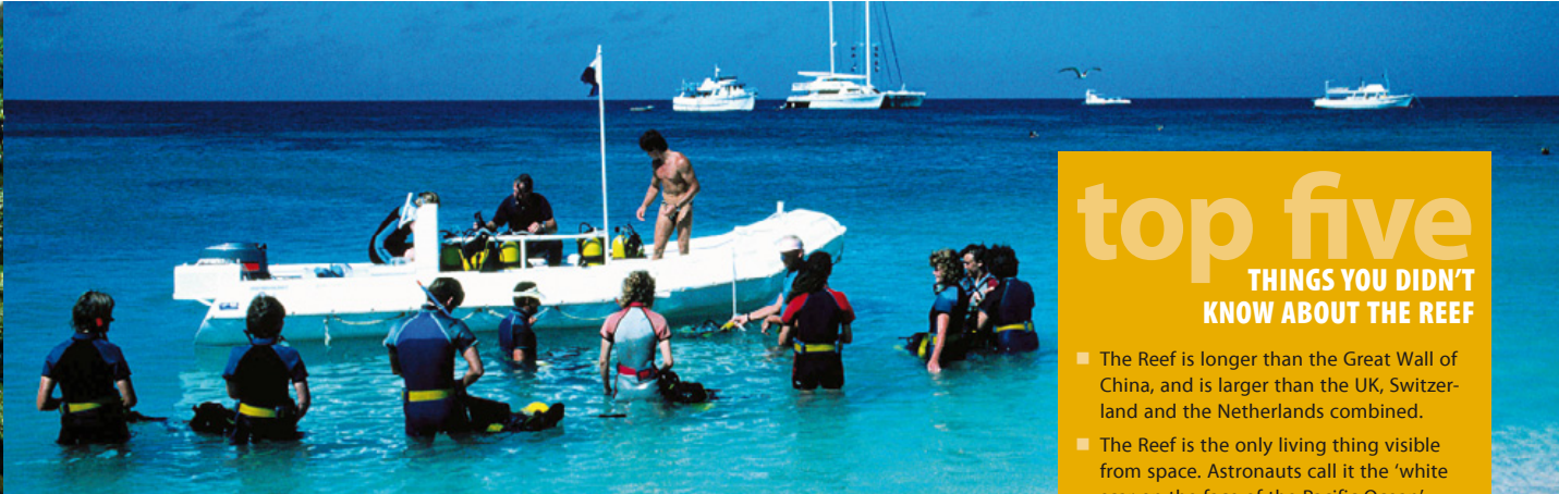
Divers prepare to plumb the depths