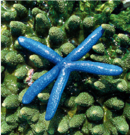
A starfish resting on Staghorn coral