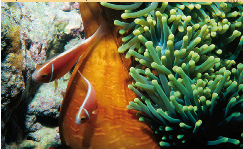
The pink anemonefish is not an enemy

There are two types of coral – hard and soft – but it's the hard corals that are the architects and builders of the Reef. Hard corals begin life as industrious little animals known as polyps, which look a little like tiny cucumbers with a mouth leading to their stomach. Polyps are soft and vulnerable, so they create an outer 'skeleton' to protect and support their bodies by excreting a small amount of hard limestone. This skeleton, with the polyp inside, is what we refer to as coral. When polyps die, their 'skeleton' remains as the architecture of the Reef, gradually building it up. Like a city in a state of constant