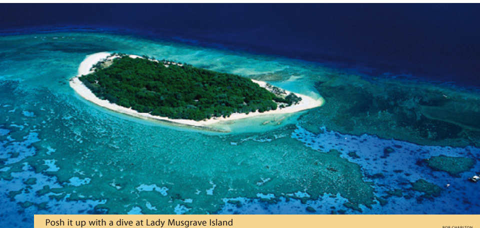
Posh it up with a dive at Lady Musgrave Island