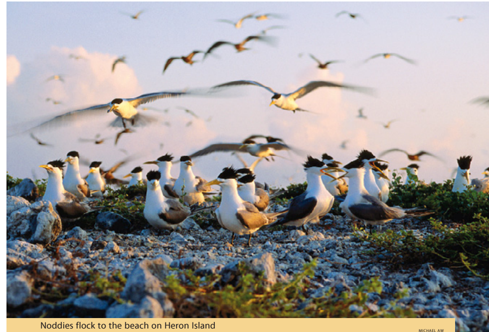
Noddies flock to the beach on Heron Island