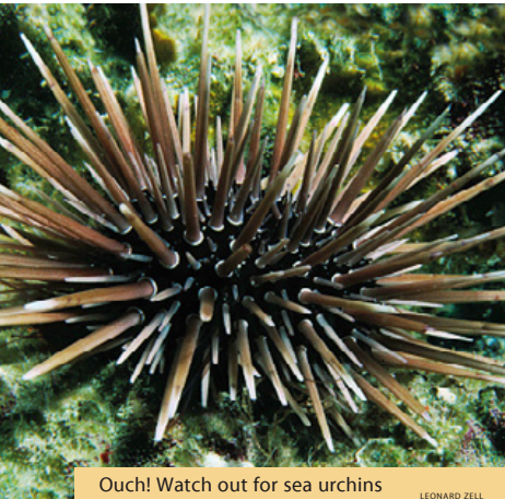
Ouch! Watch out for sea urchins