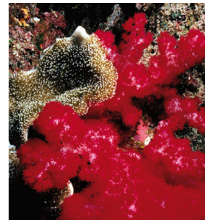
Fiery soft coral

Townsville (p298) is a renowned gateway among divers. Whether you're learning or experienced, a four- or five-night onboard diving safari around the numerous islands and pockets of the Reef is a great choice. In particular, Kelso Reef and the wreck of the SS Yongala are teeming with marine life.