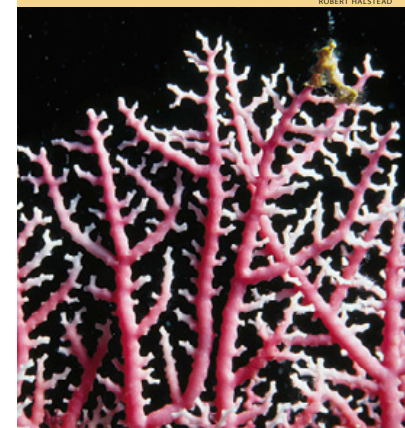
Fragile lace coral