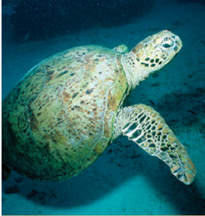
A green turtle, Briggs Reef