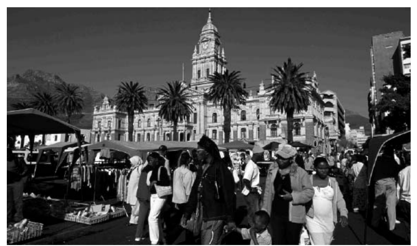
Market, Grand Parade (p117)

turn right onto Albertus St, then turn right again at Corporation St to reach Mostert St and its continuation, Spin St. On the traffic island beside Church Sq, look down to see a circular plaque marking the location of the old slave tree 5 under which slaves were sold until emancipation in 1834. In front of you is the Groote Kerk 6 (p95), mother church for the Dutch Reformed Church. Across the road is the old Slave Lodge 7 (p96), now a museum; at the back of the lodge on Parliament St look up at the sculpted relief on the pediment of an exhausted-looking lion and unicorn, a satirical comment by the stone mason on the Empire following the Napoleonic Wars.