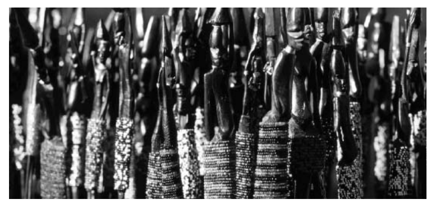
Handicrafts, stall in St George's Mall (p161)

Across Wale St is the Western Cape Legislature 16, its grey bulk enlivened by the fun stone-carved detail of animal heads. Just past St George's Cathedral 17, also on Wale St, is the entrance to Company's Gardens 18 (p93). It's a lovely place to rest and, if you have time, you can also explore the country's best collection of contemporary art at the SA National Gallery 19 (p98). Before leaving, nip out to the Queen Victoria St side of the gardens to view one of the city's favourite Art Deco buildings: Holyrood 20, an apartment block reminiscent of a vacuum cleaner.