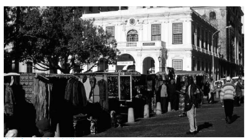
Market, Greenmarket Square (p162)

You're now in cobbled Greenmarket Square 7 (p162), created as a farmers market in the early 18th century and filled from Monday to Saturday with one of the city's best crafts and souvenir markets (p162). Three quarters of the buildings surrounding the square hail from the 1930s, the main exception being the Old Townhouse 8 , completed in 1761 and now home to the Michaelis Collection (p96) of Dutch and Flemish masterpieces.