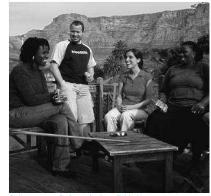
Relaxing on a deck overlooking Table Mountain

and, for much of the way, a vertical slog. Another far-trickier possibility recommended for experienced climbers only is the India Fenster (Map p68) route that starts from directly behind the lower cableway station and heads straight up. The hikers you see from the cableway, perched like mountain goats on apparently sheer cliffs, are taking this route.