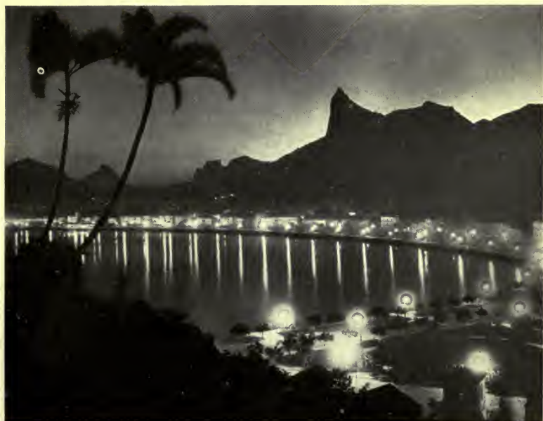
THE BEAUTIFUL BAY OF BOTAFOGA AND THE CITY OF RIO DE JANEIRO BY NIGHT SHOWING THE PEAK OF CORCOVADO IN THE DISTANCE AT AN ALTITUDE OF ABOUT THREE THOUSAND FEET