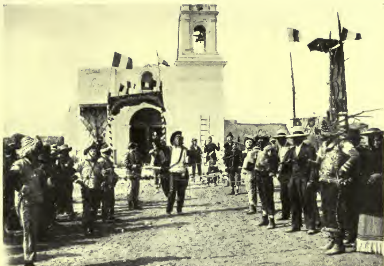
MASKED DANCERS AT CARMEN ALTO, PERU, DURING CARNIVAL