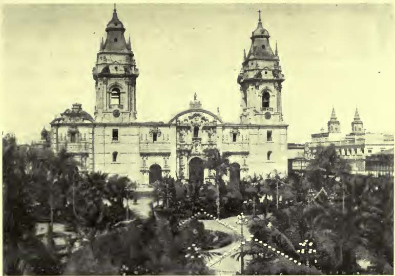
CATHEDRAL FROM PLAZA, LIMA