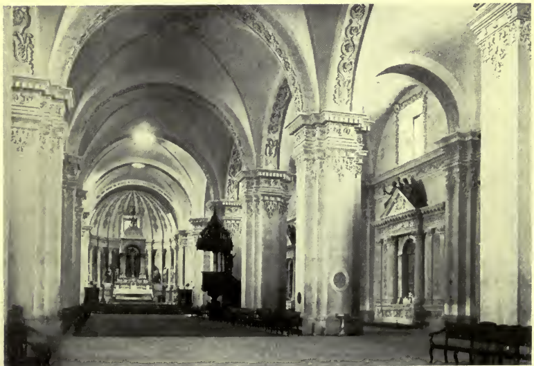
INTERIOR OF CATHEDRAL AREQUIPA