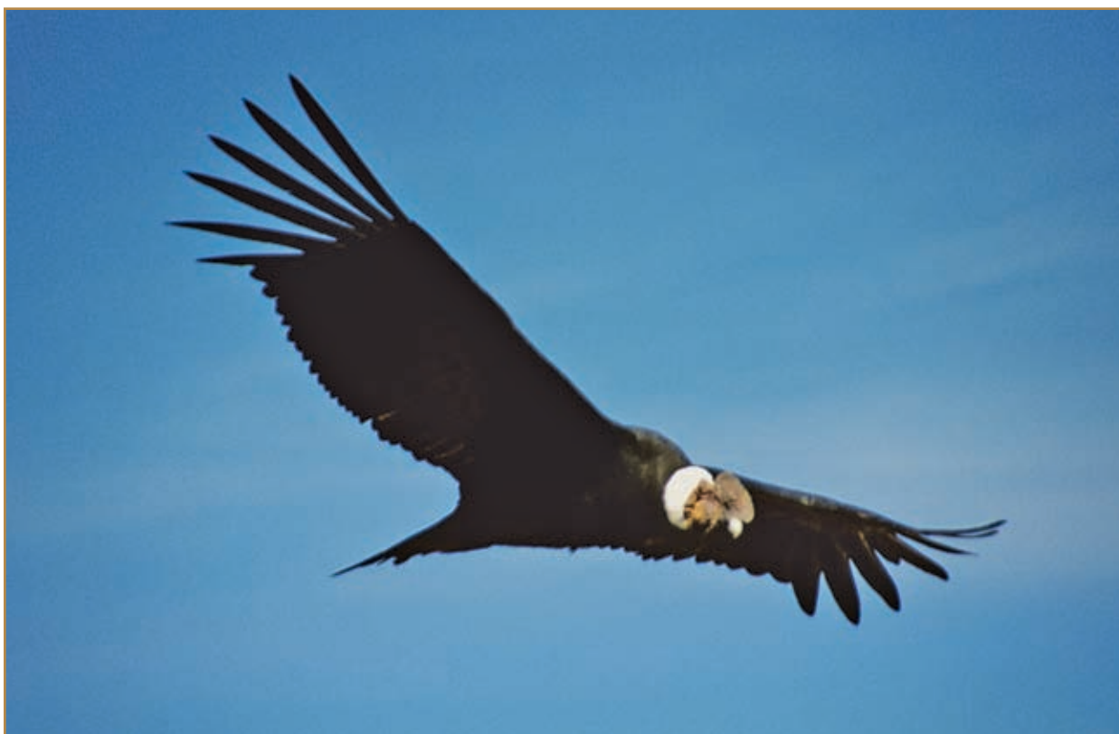
An Andean Condor soars above Colca Canyon in Peru.

his back. The view from the clouds overwhelmed the young woman, and the idea of living at the top of the mountains appealed to her, so she agreed to marry him. But after a time of eating old and decaying meat and feeling always cold with nothing but a few feathers to keep her warm, Condor's wife grew very unhappy. One day, when her husband flew off, leaving the young woman to tend their eggs on the mountain ledge (condors do not build nests), a parrot flew up. The parrot brought news of the young woman's family and of how they missed her. The young woman climbed onto the parrot's back and went home. When her condor husband came and pleaded with her to come back, she threw a pot at him to chase him away. Condor became so sad that his feathers turned black and remained so, for he was always mourning his lost love.