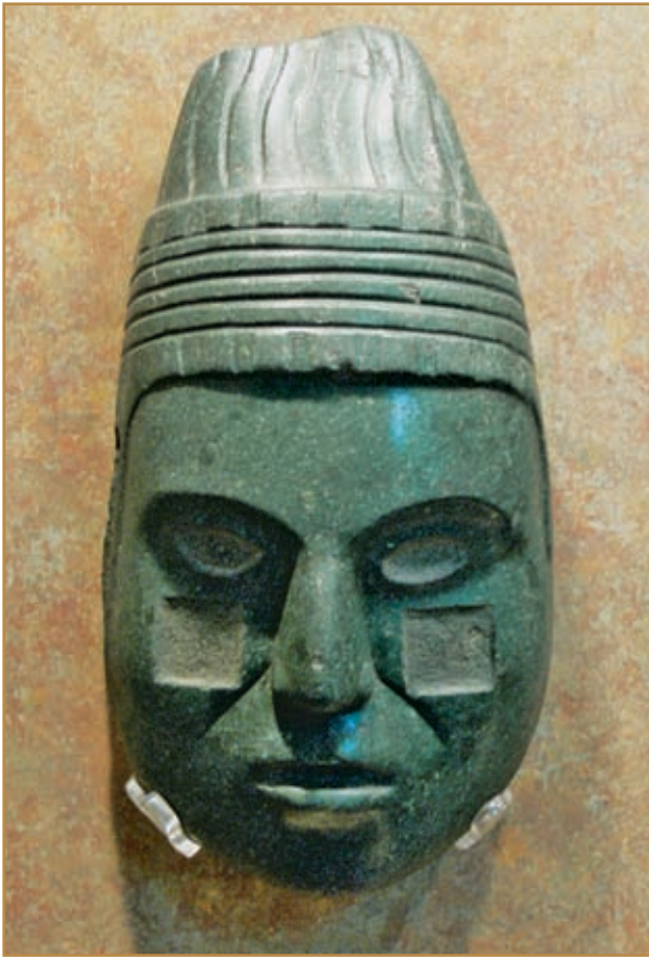
Jade mask of Chalchihuitlicue, the Aztec goddess of water, rivers, lakes, oceans, and storms.

identified as the female aspect of ATLACAMANC , the male storm god, and as Chimalma , who was the mother of QUETZALCOATL in his incarnation as CE ACATL , a god of war. Chalchihuitlicue was known as Matlalcueyeh in Tlaxcala, a small state that stayed independent of the Aztecs. See also TLALOC ; TLALOCAN .