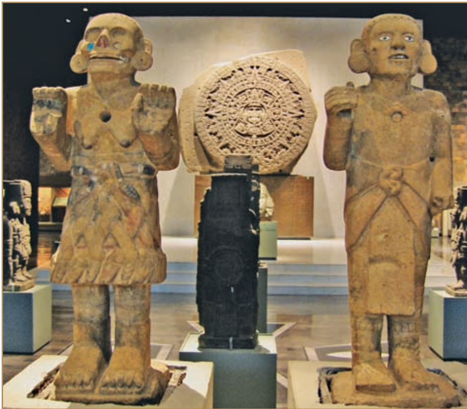
Aztec mythology revolves around the sun calendar (center), along with such gods as the earth mother goddess, Coatlicue (left), and the fire god Xiuhtecuhtli (right).

Significant writings for the Maya include four surviving codices, the POPUL VUH , and the writings of Diego de LANDA (ca. 1524–1579), a Spanish priest. There are several codices written in petroglyphs by the Aztec after the Conquest; also significant are the writings of Bernardino de Sahagún (1499?–1590), a Catholic priest whose writings in Nahuatl, the language of the NAHUA people, were later translated and are known as the Florentine Codex. Writings about the Inca include those written in Spanish by Sarmiento de Gamboa (1532–1592) and in QUENCHUA, the language of the Inca, by Francisco de Ávila (1573?–1647?); both are transcriptions of orally told myths and legends. But again, one must wonder, how well do these tell the ancient stories? The Indian perspectives on the universe and time so differed from those of the Europeans that a reliable interpretation might not be possible. Another question is, how readily would the native priests—who knew the stories best and were the scholars of a culture, responsible for preserving and protecting it—share their secrets with those bent on destroying it?