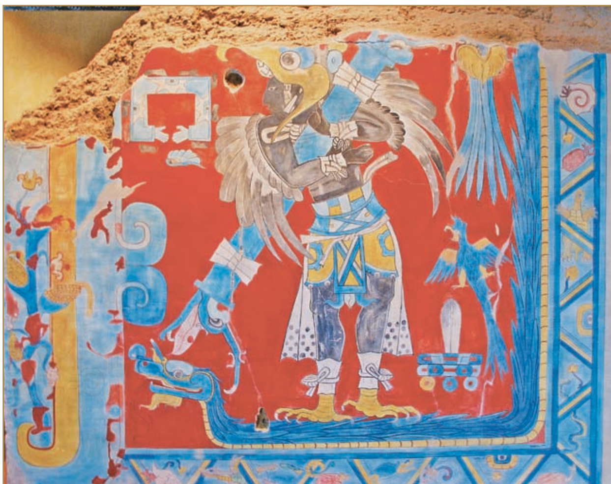
The highest order of Aztec warriors were the Eagle Knights. This pre-Columbian mural displayed at the Cacaxtla archaeological site in Mexico shows an Eagle Knight wearing an eagle mask and feathered cape, standing on the body of the feathered serpent god Quetzalcoatl.

became an Eagle Woman, helping to carry the Sun down in the afternoon sky. An eagle holding a SERPENT was the sign for the Aztec to build their city on LAKE TEXCOCO. The eagle and serpent are still the national symbols of Mexico. See also FALLING EAGLE.