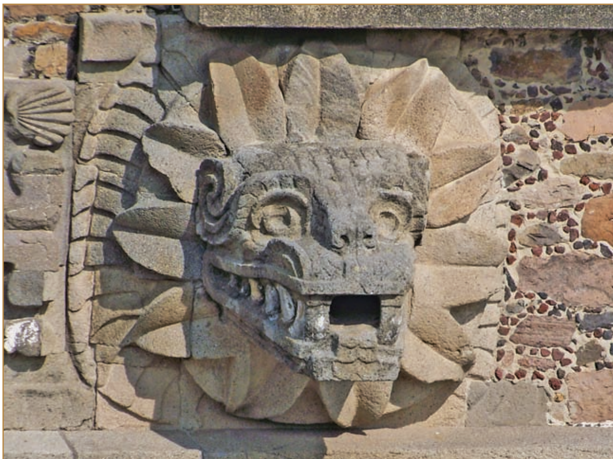
A feathered serpent head at Teotihuacan

FIRE Fire was immensely important to people in ancient South and Meso-America: It was used for cooking; for rituals, including cremating the dead; and, sometimes, for sacrifices. The INCA often threw