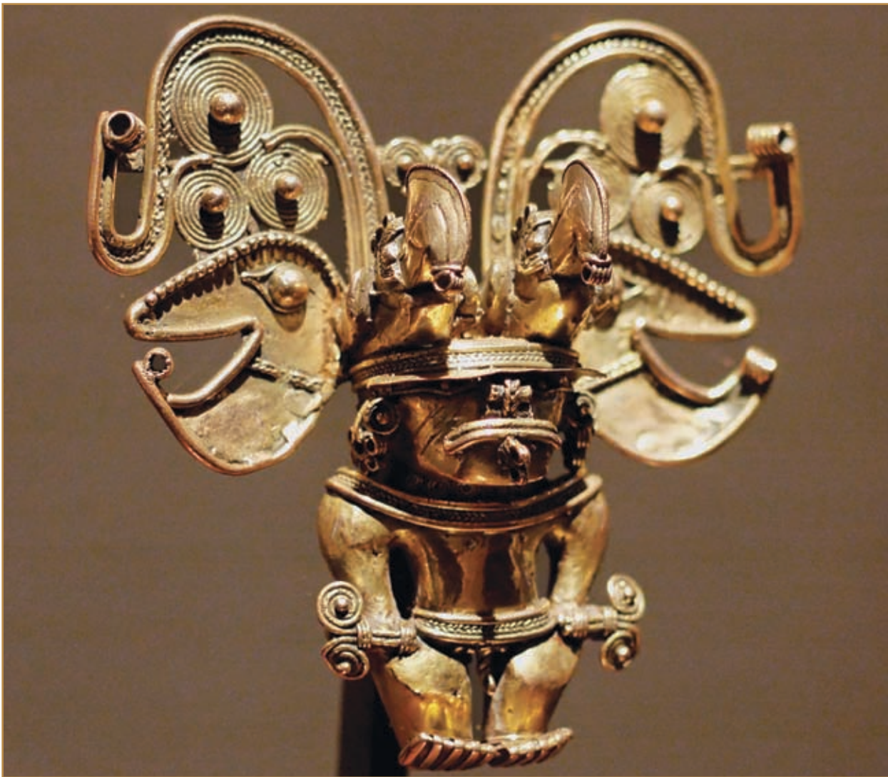
This gold pendant (10th to 15th century) was fashioned by the Tairona people from northern Colombia, known for their engineering and gold craftsmanship. Scholars believe this figure represents a shaman wearing a nasal ornament and a headdress and holding two scepters. (Photo by Jastrow/Used under a Creative Commons license)

and craftsmen of the pre-Columbian period. They lived in self-sufficient villages that practiced highly ecological farming—terraced gardens that sup-