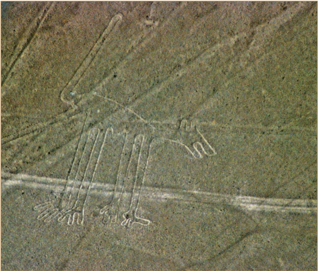
The ancient Nazca people carved many geoglyphs (huge ground drawings), like the dog shown here, into the Nazca Desert, a high arid plateau in southern Peru.

to bring water from the mountains. Many lines are part of ceremonial rituals that revolve around water or rain. Other plains or pampas along the coast of Peru and in northern Chile have similar “lines” but not as extensive as those at Nazca.