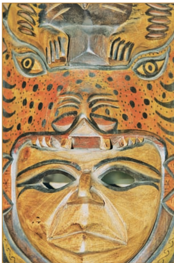
This wooden Mayan mask combines the skin of a jaguar with human features, a common image of strength and cunning for Mayan warriors.

Scholars are not sure, or at least do not agree, whether ancient Americans considered the jaguar a god. The MAYA associated jaguars with obsidian—a dark rock used for ornaments and for the cutting edge of spears and knives. They made their day IX a jaguar’s day, the day of obsidian, when “heaven and Earth embraced” (see also CALENDAR). Jaguars appear on so many objects in Meso-America that it