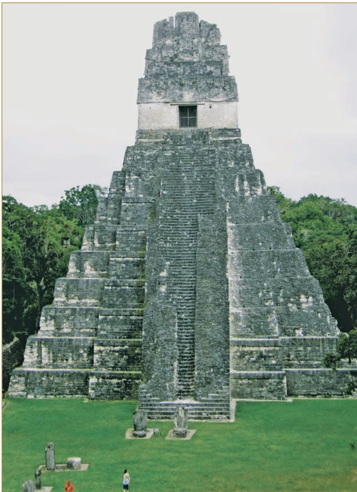
The Temple of Tiikal has nine levels that represent the levels of the underworld in Mayan mythology.