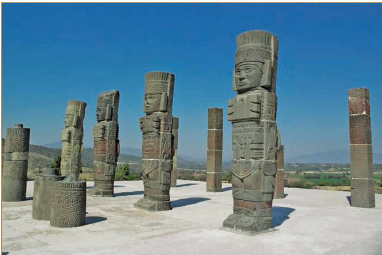
These 15-foot-high stone warriors stand on the top of the Temple of Quetzalcoatl in the ancient Toltec city of Tollan. The stone warriors were the columns that held up the roof of an outdoor shrine.

The Toltec had a highly developed culture, a contrast to the “rougher,” more warlike Chichimec who moved into the valley from the north. Once in contact with the Toltec, many groups, including