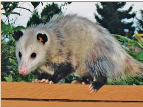
The opossum was a popular trickster character in South and Meso-American mythology.

Throughout Meso-America, the opossum was often associated with old age and sometimes with childbirth. Opossums were frequently shown in ZAPOTEC art as small figurines or in painted decorations. The MIXTEC associated the opossum with the new year, crossroads, and the ceremonial BALL GAME. QUETZALCOATL and the opossum were often connected because they had so many similarities—both stole FIRE, discovered CORN, brought rain and the dawn, and both sometimes appeared as an old man. The MAYA said the opossum was responsible for the colored sky at sunrise. The story goes that the opossum painted the sky with colors while the HERO TWINS were competing with the UNDERWORLD lords in the ball game. In some versions of the story, the colors distracted the lords and thus slowed down