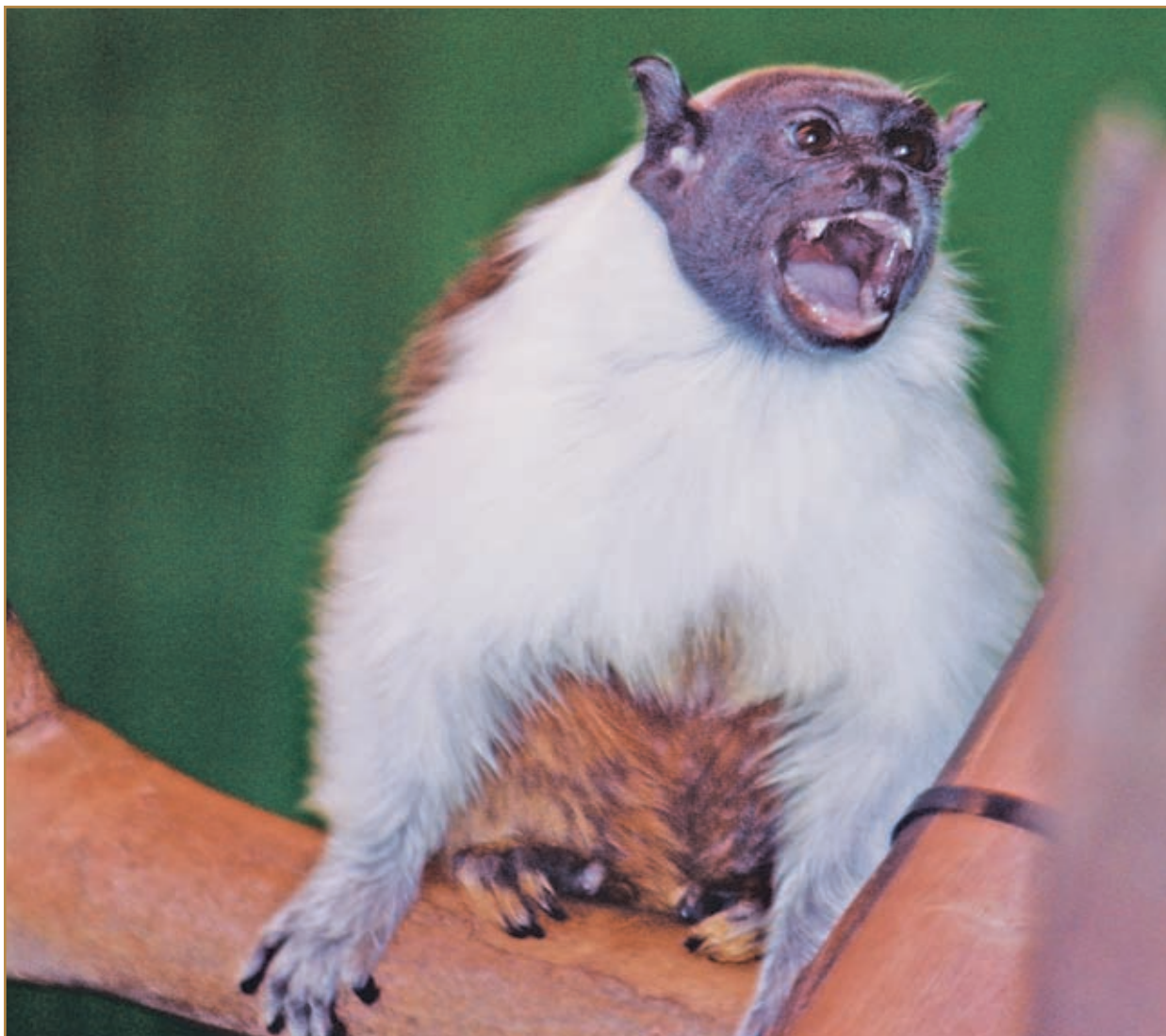
This Tamarin marmoset is a tiny monkey found in South American jungles. Monkeys were believed to have once been foolish people, whom the gods turned into chattering creatures.

MONKEY The spider monkey and the howler monkey are the two most common monkeys in South and Meso-America. Both are tree dwellers, the spider monkey particularly adept at swinging through the treetops. While the spider monkey lives in the tops of trees, the howler lives at any level and usually travels by walking along branches.