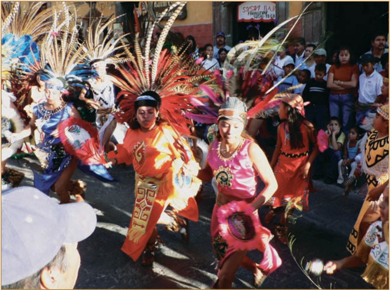
Bird feathers have always been an important part of the clothing and headdresses of the nobles, priests, and tribal shamans in religious rituals like this Aztec Sun Dance still performed in Mexico.

portrayed in an unhappy marriage story: His wife was soon disgusted by the smelly, decaying carcasses he brought home.