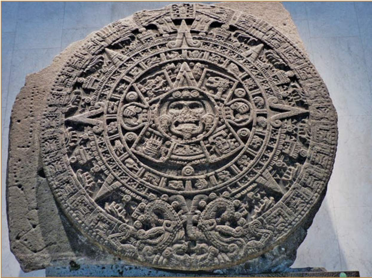
The Aztecs carved round stone calendars using hieroglyphic symbols to keep track of time and seasons.

For other Meso-American stories that involve the Sun, see COCOPA , DAUGHTER OF THE SUN , EHECATL , HUICHOL , and IX CHEL .