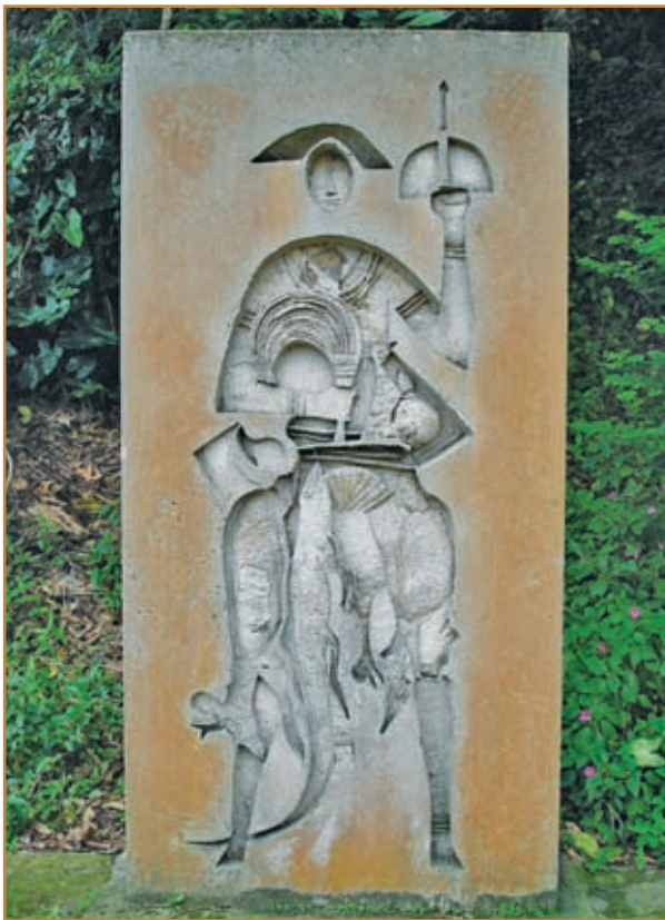
The sculpted tablet of hunter god Oxóssi, who displays the animals he has caught with his bow and arrow, is one of the orixás worshipped in Afro-Brazilian religions. The tablet stands in the public Catacumba Park in Rio de Janeiro, Brazil.

flourished within the slave community, eventually filtering into mainstream Brazilian culture.