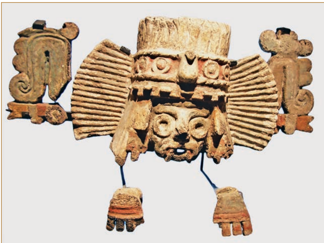
This brazier depicts Tlaloc, the Aztec and Toltec god of rain. He is dressed in a heron-feathered crown. The rain clouds represented on either side nurture all growing things.

life written from interviews in the mid 1500s by the Spanish priest Bernardino Sahagún (1499?–1590).