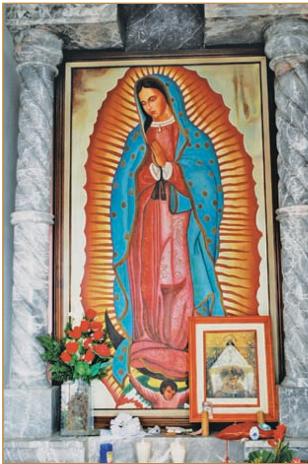
Shrine dedicated to the Virgin of Guadalupe at the Nuestra Señora de las Misericordias Church in Milpa Alta, a borough of Mexico City.

seen in the midst of fresh rose petals that covered the ground. Juan Diego took the rose petals to the bishop, who accepted them as proof of the Virgin's appearance, since the hillside where she was seen was rocky and barren and roses would not have been blooming in December. The bishop ordered a small shrine built at that site. In a historical irony, this same bishop had once ordered that a shrine honoring the Aztec Earth goddess be destroyed.