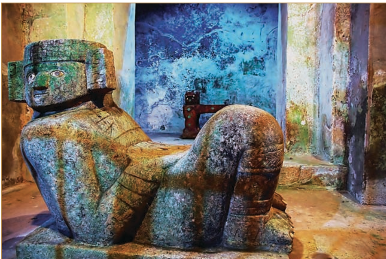
This stone chacmool inside the pyramid at Chichén Itzá features a human body with the head turned sideways. Bowls holding sacrificial offerings to the god Chac were placed on the chacmool's stomach.

which an offering bowl was placed. In others, the abdomen is carved out slightly to form a built-in bowl. In the Yucatán MAYA center at CHICHÉN ITZÁ, there are more than 12 chacmools .