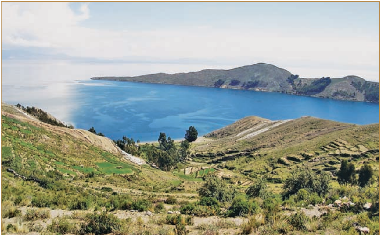
Lake Titicaca and its Island of the Sun is considered a sacred place.

died. In Mexico, Llorona and MALINCHE are considered the same figure; some scholars believe her roots are in the AZTEC creation myth of the giant Earth monster TLALTECUHTLI who cries out for blood at night.