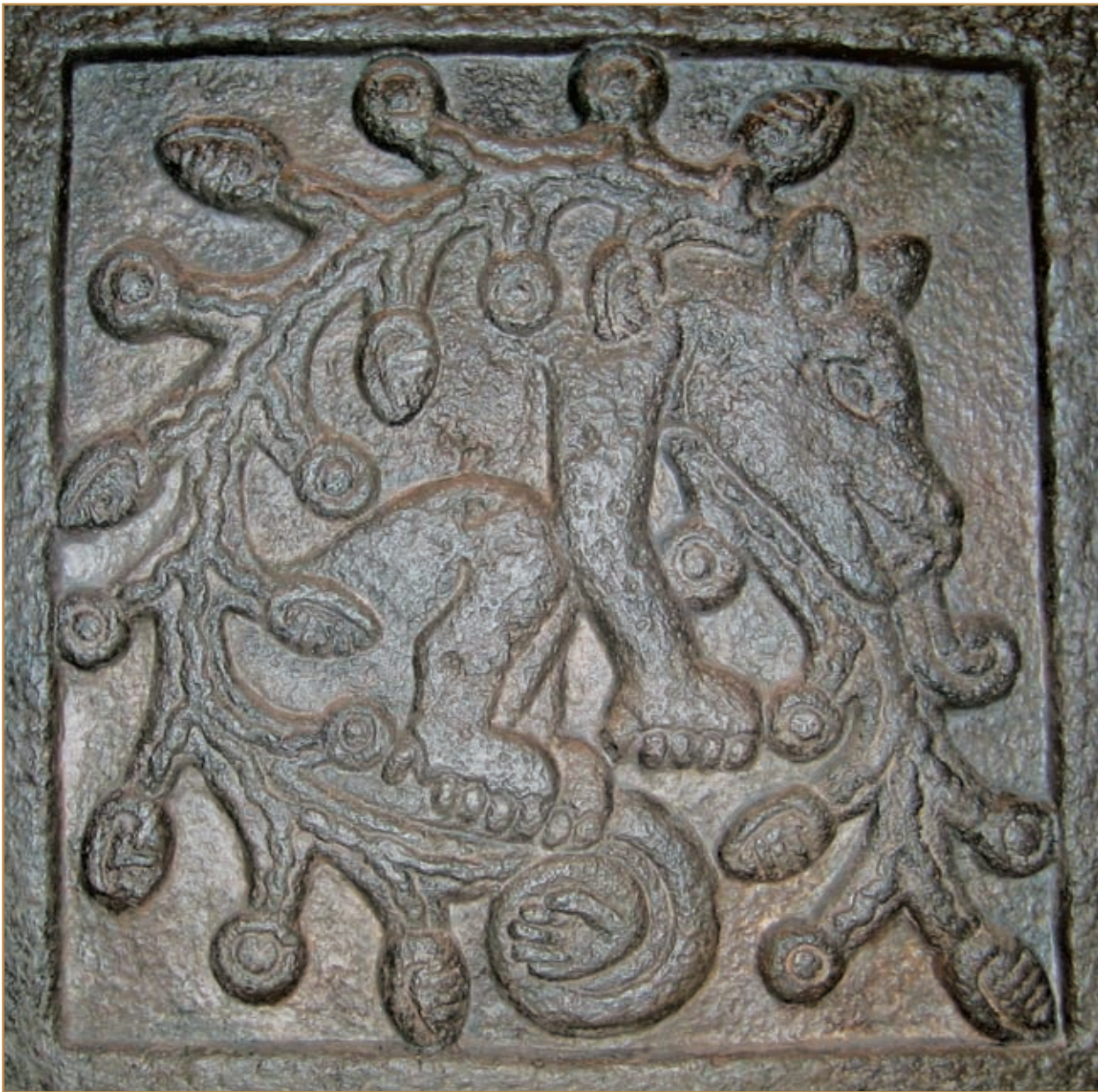
This animal glyph stands for the name of Aztec emperor Ahitotl. It was found in a temple at Tpoztlan near Mexico City.

The writing system of the MAYA was made up of more than 800 glyphs, or signs, that represented words or syllables. Many were representational. The glyph for JAGUAR , for example, was the head of the cat. Words or ideas that did not have an easily pictured symbol were usually represented by a picture for a word that, when spoken, sounded the same as or similar to the intended word (a homonym). So readers could tell the difference, another symbol, a complement, was added to the picture for the homonym. That way, when the