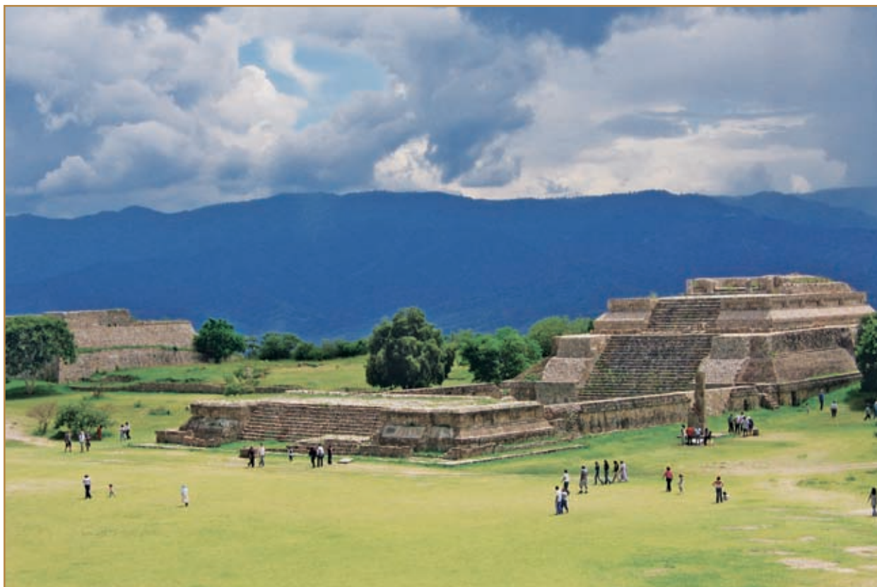
The Zapotecs (1500 B.C. to 750 A.D.) built their capital city of Monte Albán as a series of terraces connecting pyramids, palaces, observatories, and temples. After the Spanish conquered Mexico, they plundered the buildings, taking many of the stones to build their own churches and buildings. (Photo by Raymond Ostertag/Used under a Creative Commons license)

temples, and observatories on a mountaintop. This was a wealthy empire, which was reflected in the city's elaborately carved monuments and public buildings. The Zapotec were the first people in Meso-America to make written texts and the first who knew and followed the movements of the planets Mercury, VENUS , and Mars (and possibly Jupiter and Saturn as well), which they believed ruled certain times. The PRIESTS made and consulted the CALENDARS to determine good