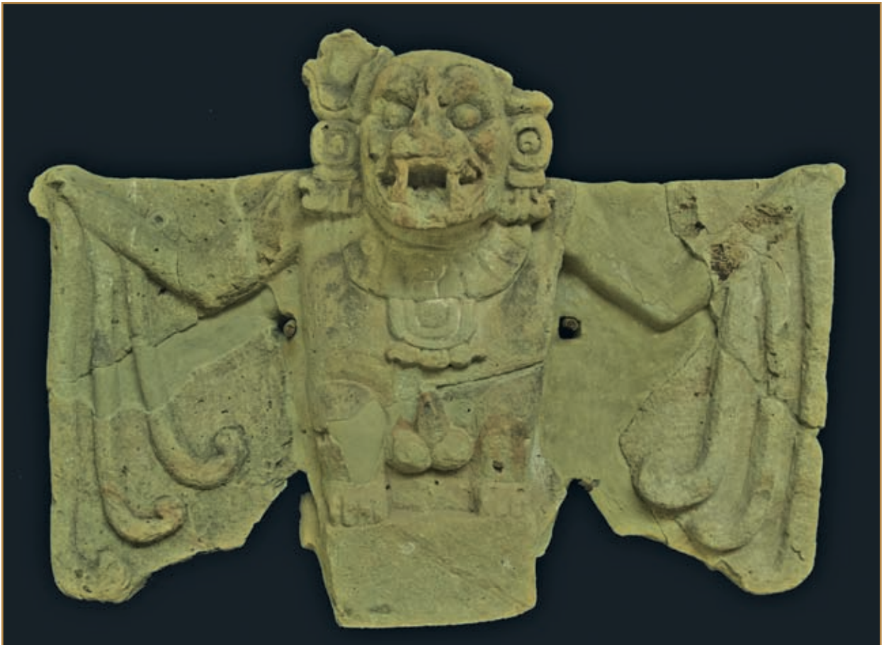
This ancient Maya sculpture shows the vampire bat god, Camazotz.

After the gods created the Earth, Sun, Moon, sky, and animals, they decided to make people out of wood to worship the gods and appreciate the world. But the wooden people insulted the gods by ignoring them