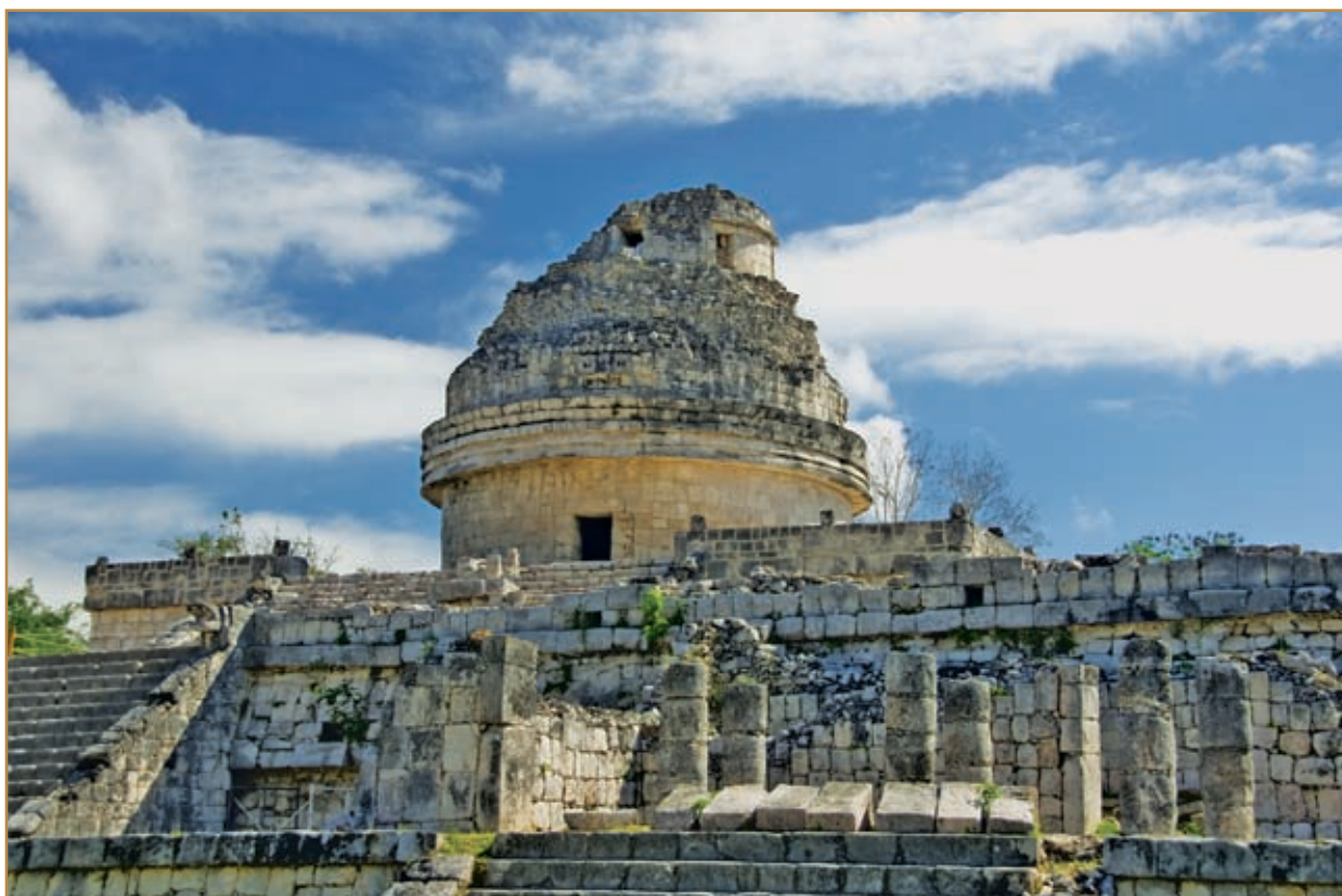
El Caracol is an astronomical observatory in the ancient Mexican city of Chichén Itzá. It was built by the Maya in the 12th century. Some scholars believe it was used to study the movements of Venus, which the Mayans regarded as a dangerous wandering star.

In Meso-America, Venus was thought to be dangerous. It was the Mayan patron planet of war