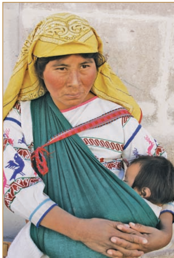
This woman and child are members of the Huichol tribe of Zacatecas, Mexico, who still live much as their ancestors did.

Spiritually, the Huichol still follow ancient traditions. They are the largest group in Mexico that has not been greatly affected by Catholicism. Where Catholicism is practiced among the Huichol, it is not