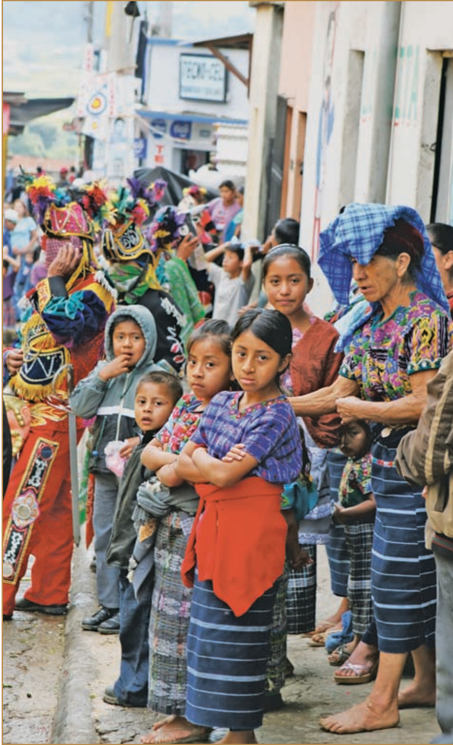
Dressed in colorful clothing, these Guatemalans watch a Mayan celebration in their village, just as their ancestors did thousands of years ago.

rituals with Catholic practice. For many, the significant aspects of the gods and goddesses and the power of the stories surrounding them have not significantly changed. An omnipotent god rules, regular ceremonies and rituals keep the presence of a belief system intact, and the telling of stories helps link the people to their heritage.