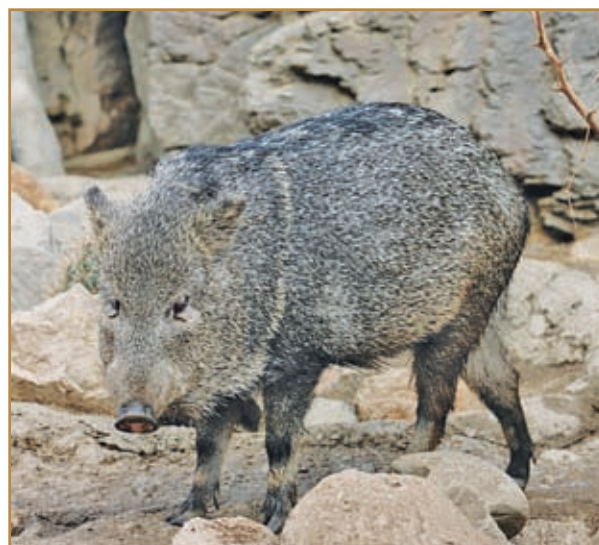
The peccary, or wild pig, is native to South and Meso-America.

WILD PIG (peccary) The only native piglike mammal in South and Meso-America, the peccary is not related to the European pig. Peccaries have hooves and long, prong-like teeth. These sharp teeth protect them from most predators. Another natural defense mechanism is their strong, musky odor, which they release when they are frightened. Peccaries live in a wide range of habitats, from the Sonoran Desert to the deep rain forests of the AMAZON River region. Mythically speaking, the AMAZON tribes of eastern BRAZIL believe that wild pigs were once human beings who insulted the hero god MAÍRA. The god's breath turned their houses to stone and turned the ungrateful people into pigs. When the door was left open, the pigs ran into the forest and became wild. This is an example of a myth that attempts to explain why there are so many wild pigs in the jungles of the Amazon rain forest.