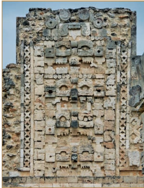
An entire wall of elaborately carved Chac rain god-heads can be seen at the nunnery at Uxmal, a site containing Mayan ruins in Mexico.

The colors are standard for the directions throughout Mayan mythology. Each of the four parts of Chac is responsible for providing rain from that direction. Chac's closest companions were frogs that croaked before rainstorms. During rainstorms, Chac threw stone axes to the ground to make thunder and lightning and emptied gourds of WATER to make rain. Today, in a Mayan Ch'a-Chak ceremony for rain, four men who represent Chac sit at the four corners of an altar. They clap sticks together, roar thunder, and sprinkle water on young boys who hop around as frogs do in a rainstorm. A shaman tends a smoky fire in the center of the altar and offers prayers as he moves around them all.