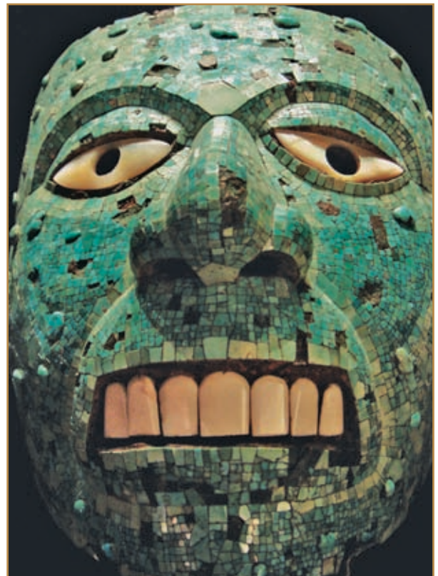
This mask depicts the Aztec god of fire, Xiuhtecuhtli, or Turquoise Lord. He was considered the force behind all life. This mosaic mask is overlaid with tiny pieces of jade, turquoise, and other gemstones.

According to the Quiché sacred book, the POPUL VUH , the creator gods knew what they wanted humans to be like—walking, talking, worshipping creatures who would follow the sacred CALENDAR of the heavens. After failing in their first two attempts to create humans, the gods consulted Xmucane and Xpiyacoc, who were older than the creator gods, asking this old couple if wood would be a good choice. Xmucane and Xpiyacoc consulted the calendar before agreeing that wood might work. The wooden humans, unfortunately, were not quite right; they walked and talked but they did not follow the sacred calendar and they did not worship the gods. So the gods wiped them