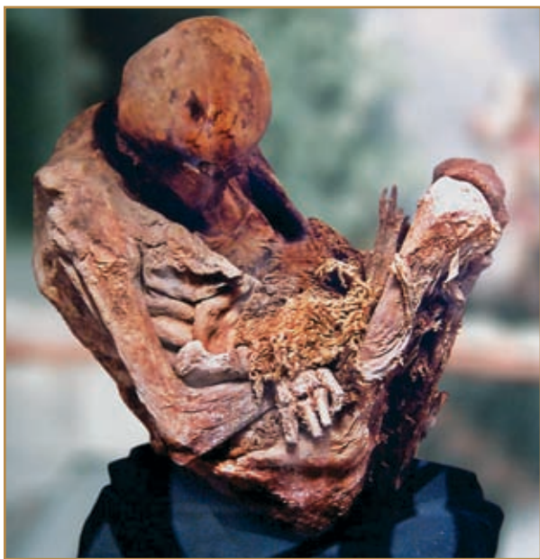
A Moche mummy from the Andes Mountains in Peru.

MUMMY A dead body that has been treated with chemicals or herbs to keep it from decaying. The INCA mummified the bodies of their rulers because they believed them to be direct descendents of their supreme god, INTI, the Sun. Once mummified, the body would be placed in front of the statue to Inti in the CORICANCHA —the Sun Temple in the Inca capital