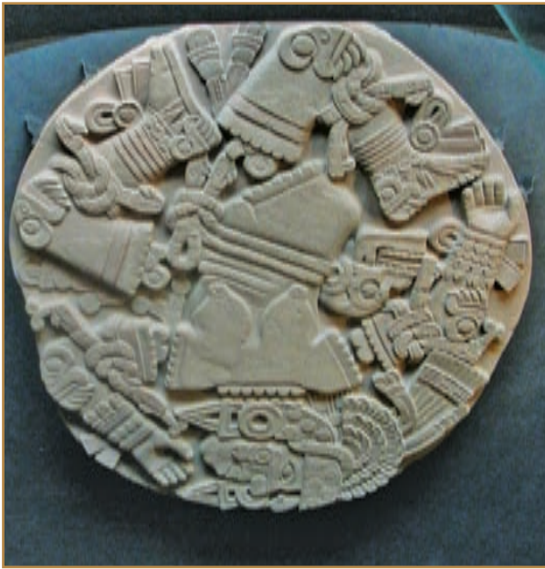
A disk of the dismembered Aztec moon goddess Coyolxauhqui, found during construction in Mexico City in 1978. Its discovery led to the excavation of the Templo Mayor.

chopped off his sister's head and threw it into the heavens to be the Moon. Thus Coatlicue could always look to the heavens to see her loyal daughter.