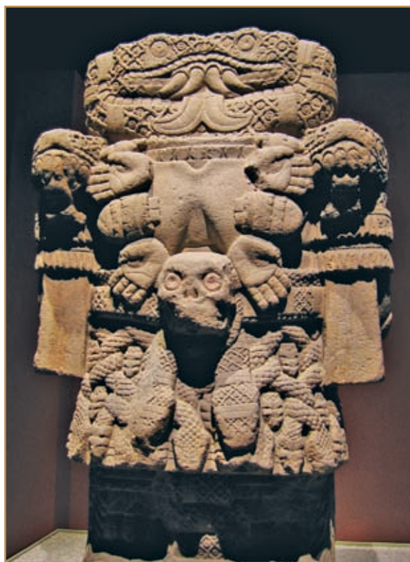
Aztec statue of Coatlicue, goddess of the Earth, who wears a skirt of serpents. The serpents represent fertility.

In one myth, a large ball of feathers floated from the sky and landed at Coatlicue's feet as she swept out her home one day. She picked it up and tucked it in her pocket. Doing so made her pregnant. Ashamed and horrified that their mother had so mysteriously become pregnant, Coatlicue's 400 sons, led by their sister COYOLXAUHQUI, prepared to attack her. But before they could, Huitzilopochtli sprang from her womb, fully grown, and killed them all. (In another version of this story, Coyolxauhqui is loyal to her mother, but Huitzilopochtli does not realize this and kills her along with her brothers.) Huitzilopochtli sent them all to the sky, Coyolxauhqui to be the Moon and her brothers to be the stars.