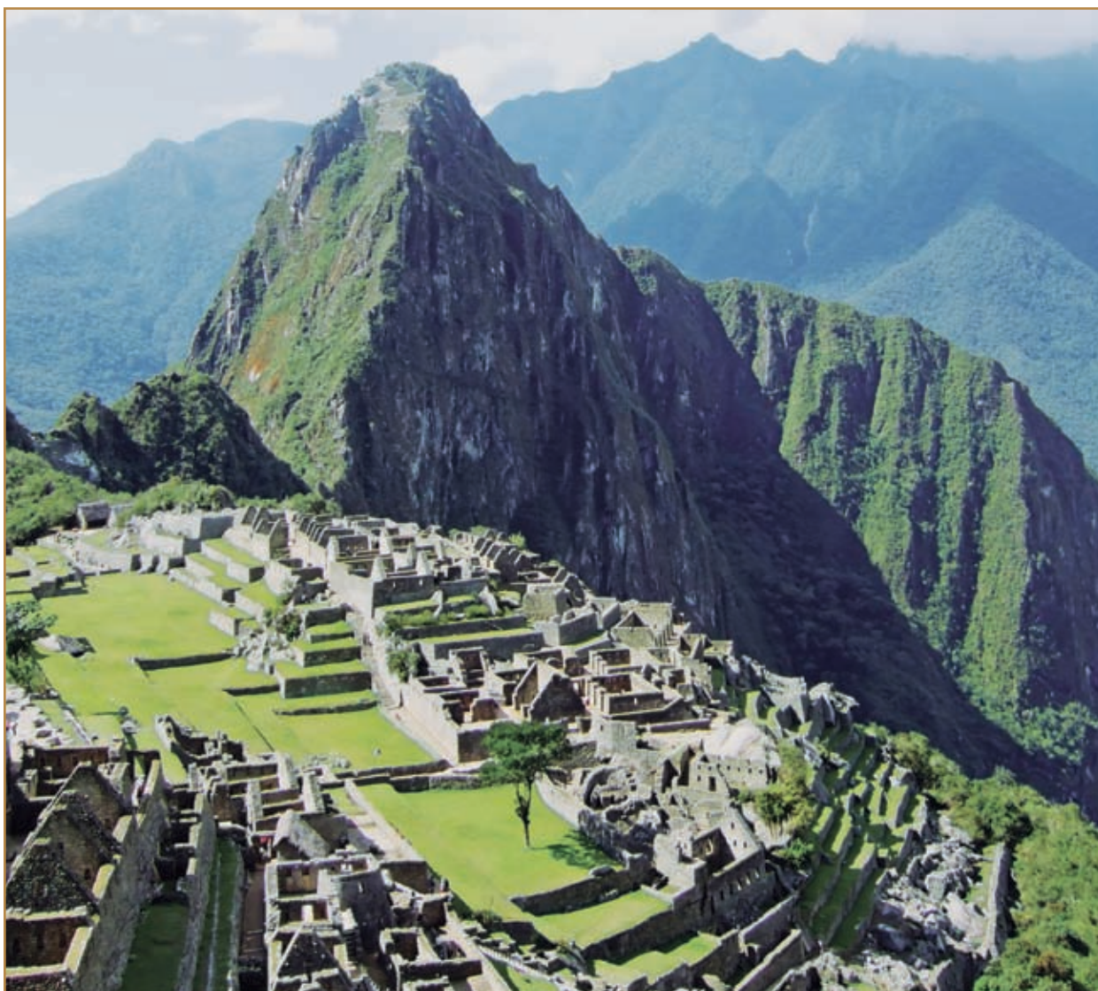
The ancient mountaintop city of Machu Picchu in Peru is one of the world's great historical sites.

never found Machu Picchu; an American archaeologist located the ruins in 1911. The site contains about 150 houses, palaces, temples, gardens, baths, and storage