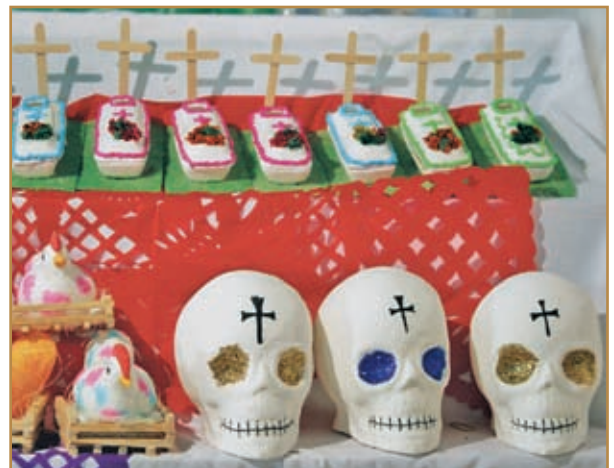
Traditional sugar figures sold for the Day of the Dead, celebrated throughout South and Meso-America.

The Day of the Dead celebrations may include food, offerings, flowers, and new clothes. Central in many houses in Mexico is an ofrenda , an altar honoring the dead. The altar may include flowers;