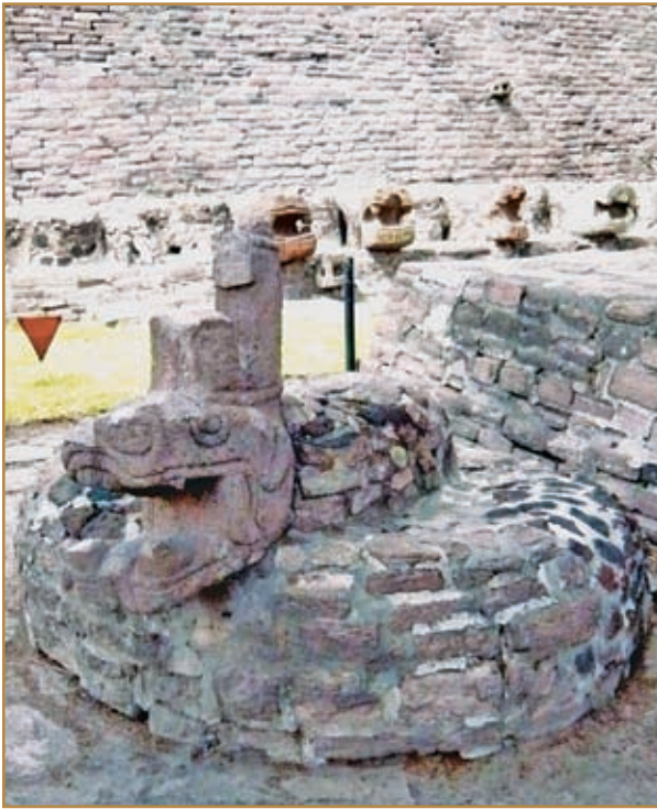
A stone statue of Xiuhcoatl, the flaming serpent. The Aztec god Huitzilopochtli used the flaming serpent to kill his sister.

use of Xiuhcoatl to kill Coyolxauhqui symbolized the triumph of light over darkness.