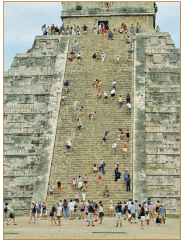
Tourists climb to the top of a pyramid at Chichén Itzá in Mexico.

CHICCANS Giant snakes thought by the Chorti, the MAYA of eastern Guatemala, to hold up the world. Chiccans lived in lakes at the four corners of the world and, like the Mayan wind gods, the BACABS, were associated with a direction and color. An infinite number of smaller chiccans lived in lakes, running streams, and rivers but spent the dry seasons deep in the Earth in natural mountain springs. When the rains came, they returned to their lakes and rivers, causing them to flood if too many were in the water at once. The Chorti also believed the chiccans caused earthquakes when they turned over as they slept in the mountains. The Yucatán Maya believed the earthquake god MAM caused earthquakes as it slept.