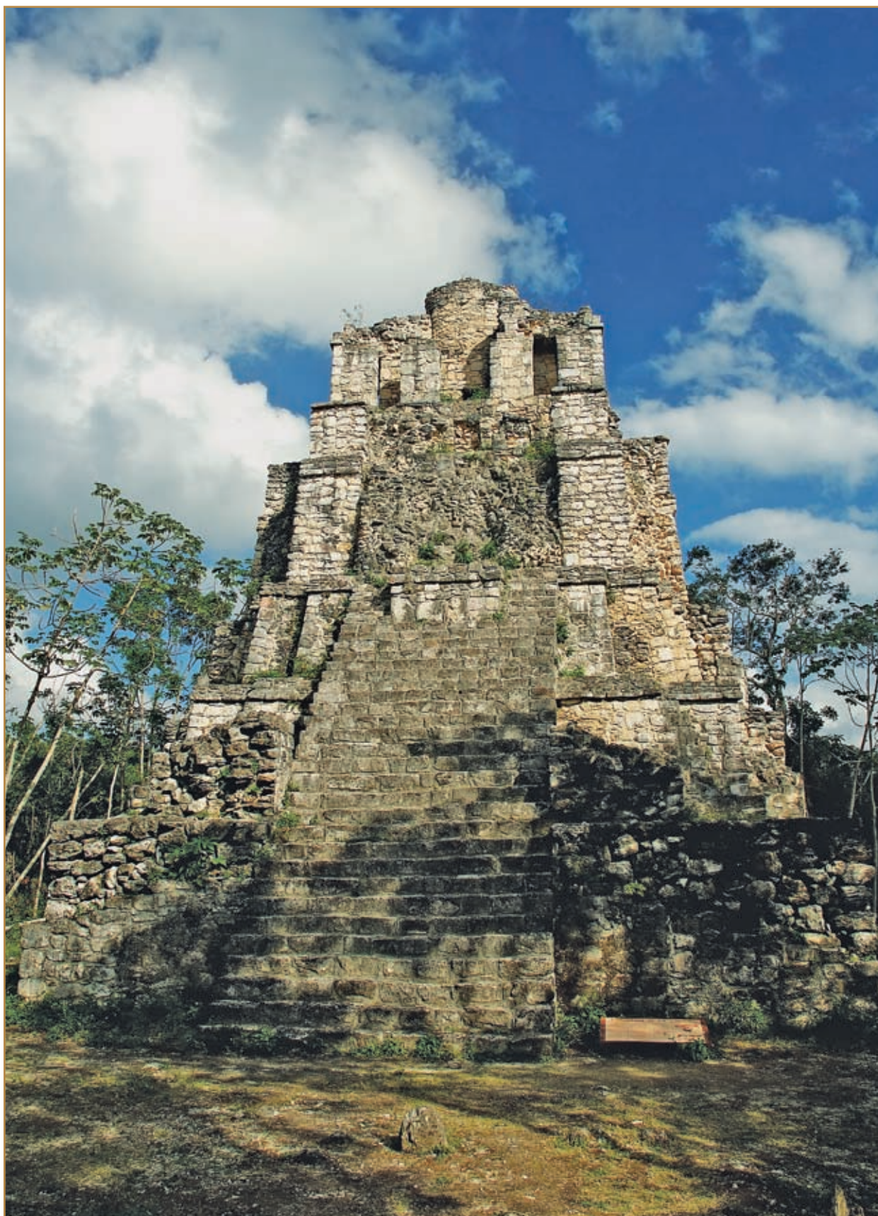
El Castillo is a 56-foot-tall pyramid in the deserted Mayan ruins of Mytil, in Playa del Carmen, Mexico.