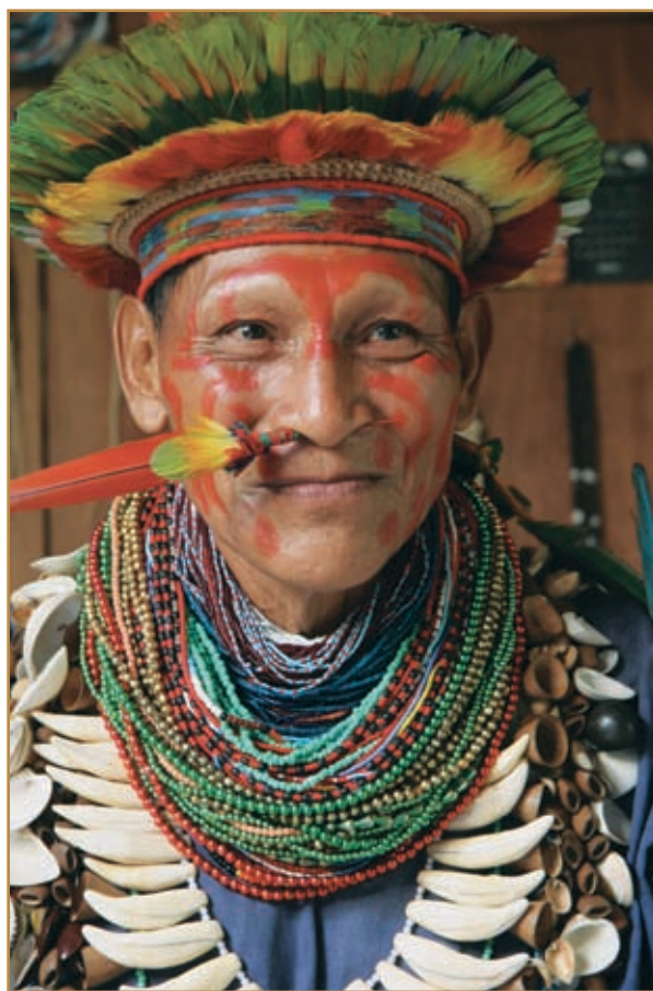
A shaman or religious priest from a tribe in the Amazon forest

SHAMAN An intermediary between humans and spirits who performed duties that included curing, healing, interpreting messages from the gods, guiding souls after death, and performing sorcery. Shamans were, and still are, both revered and feared because of their power. Some are thought to transform themselves into spirits, particularly animal spirits. In some societies shamans are also judges and interpreters of moral codes. They obtain their insights from dreams, trances, and vision quests, and they often use hallucinogens. Many wear JAGUAR skins, headdresses, or necklaces of jaguar teeth, and some are thought to change into jaguars after death.