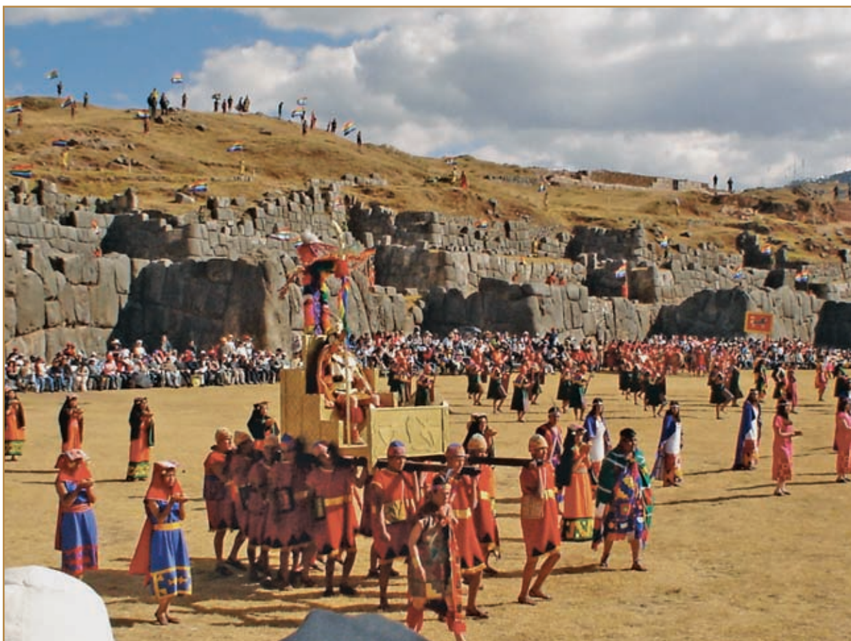
Inti Raymi, the ancient Incan Sun Festival, celebrates the beginning of a new solar year. The rituals associated with the festival are still performed in front of huge crowds each June at Cuzco, Peru.

Sun returns to provide warmth for all life. Traditionally, the Incan kings sacrificed llamas as offerings to the Sun during the festival. Today, Inti Raymi draws tens of thousands from all over the world. Among South American celebrations, it is second only to festival in Rio de Janeiro. One of the highlights is the portrayal of Inca nobility by 500 actors who are adorned in gold and silver, as befits their rank. The actor portraying the Sapa Inca blesses the day and gives a speech in Quechua (the language of the Inca) that honors the Sun and all that it provides.