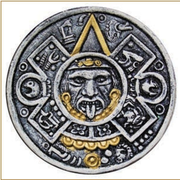
The face of Tonatiuh, the Aztec and Mixtec Sun god, is often found in the center of Sun Stones or Aztec calendar stones.

to get him moving. On his daily journey, Tonatiuh was thought to rise as an eagle and was helped along by warriors. As he descended in the afternoon, the spirits of women who had died in childbirth provided their help.