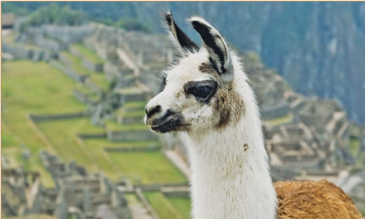
Llamas are a common sight throughout Peru.

LORD OF THE GREEN GOURD OR BLUE BOWL See AH RAXA TZEL.