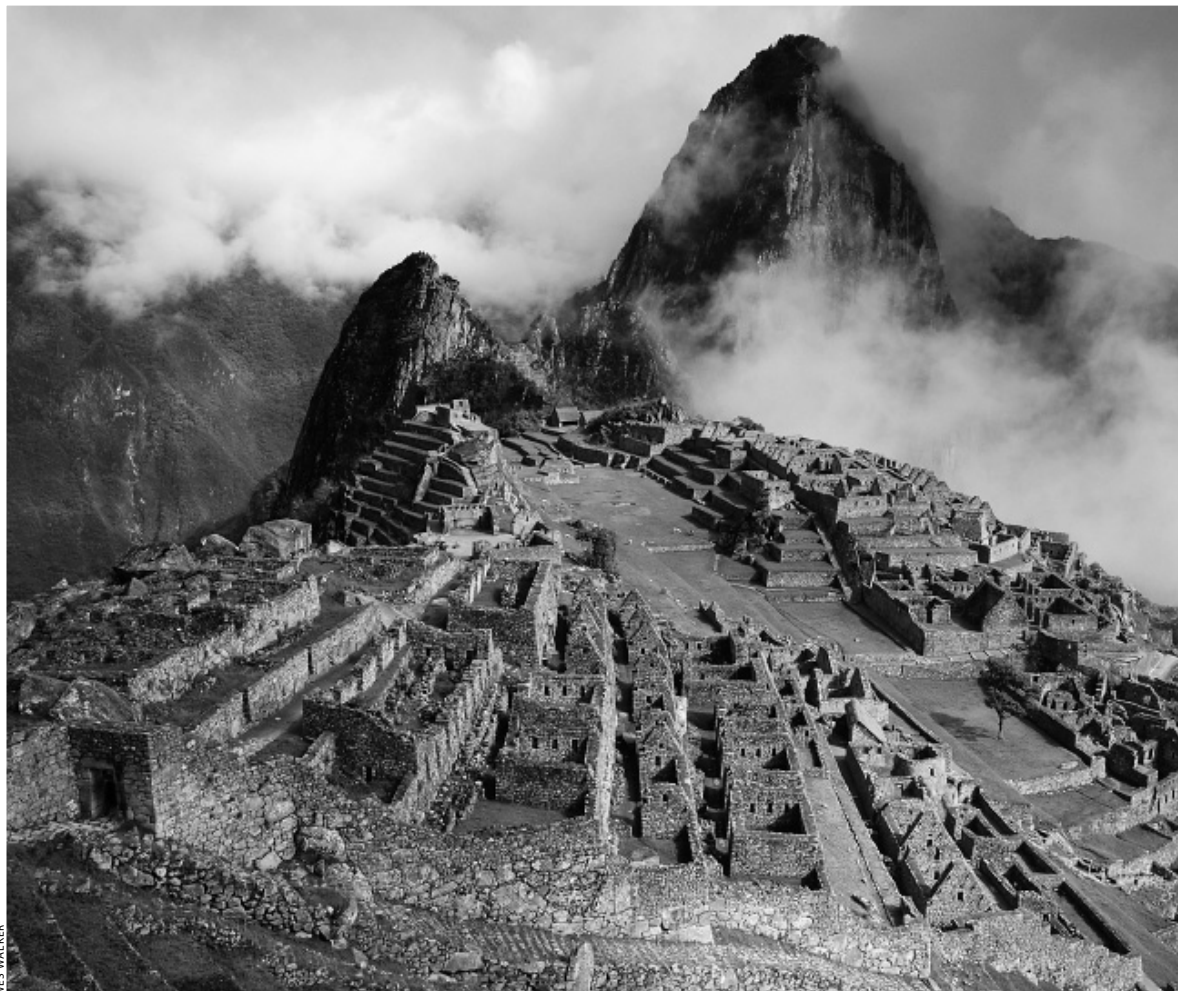
Machu Picchu (p884) overlooking the Río Urubamba valley, Peru