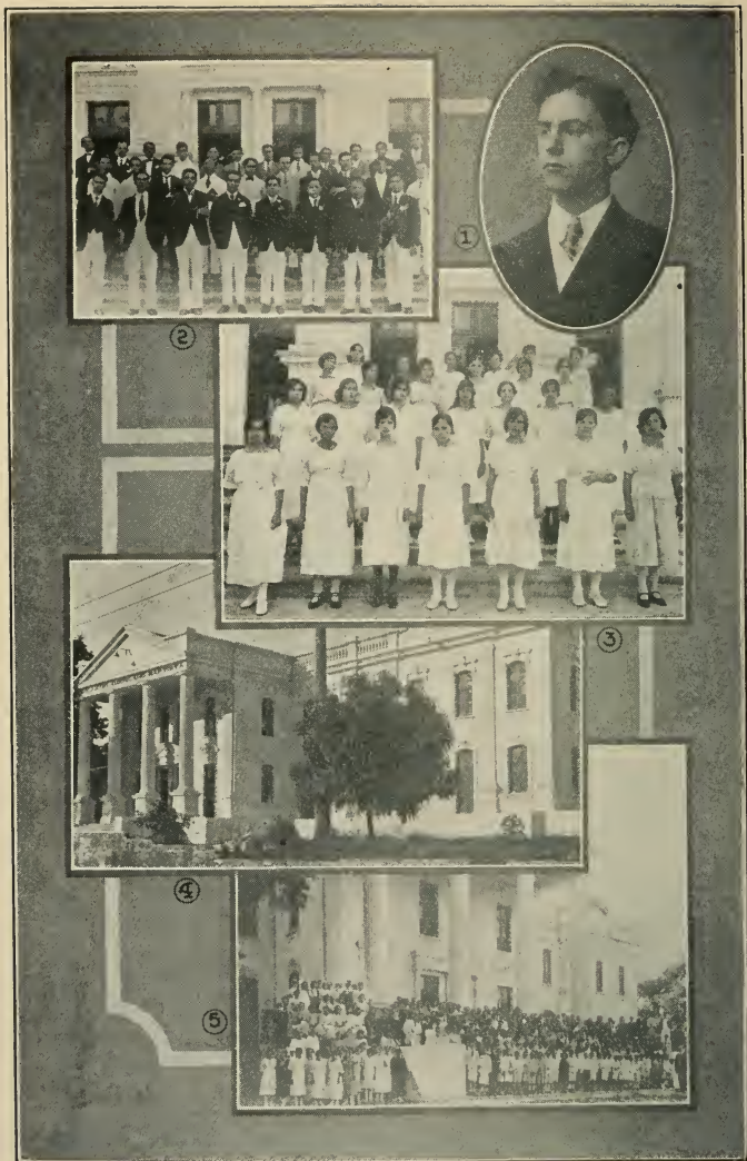
PLATE VI. SCENES, PERNAMBUCO COLLEGE.