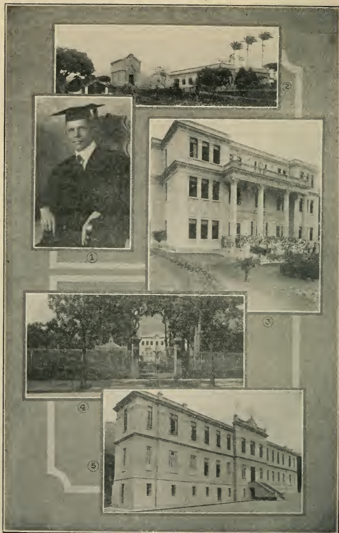
PLATE VII. RIO BAPTIST COLLEGE AND SEMINARY, RIO.