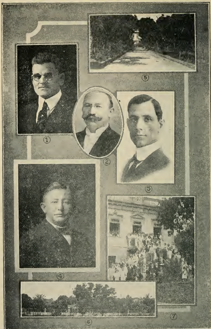
PLATE III. J. S. CARROLL MEMORIAL BAPTIST PUBLISHING HOUSE, RIO.