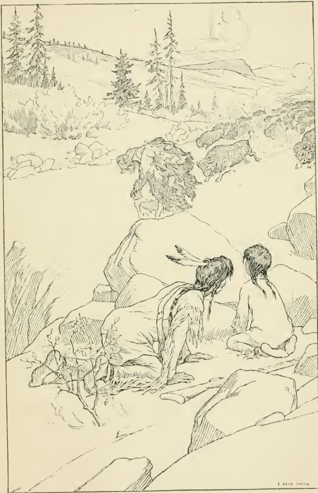
THEN IT WAS THAT HE SUDDENLY TURNED