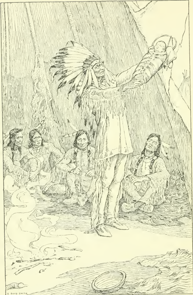
“I CALL HIM SINOPAH!”