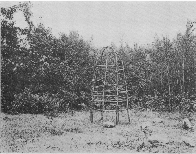
Fig. 2. Framework of a Je'sakan.

In the evening, just about sundown, the performer's clients appear, bringing liquor for him to use; partly to pour libations to the gods, and