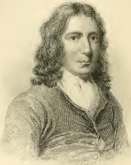
Portrait of [Name]