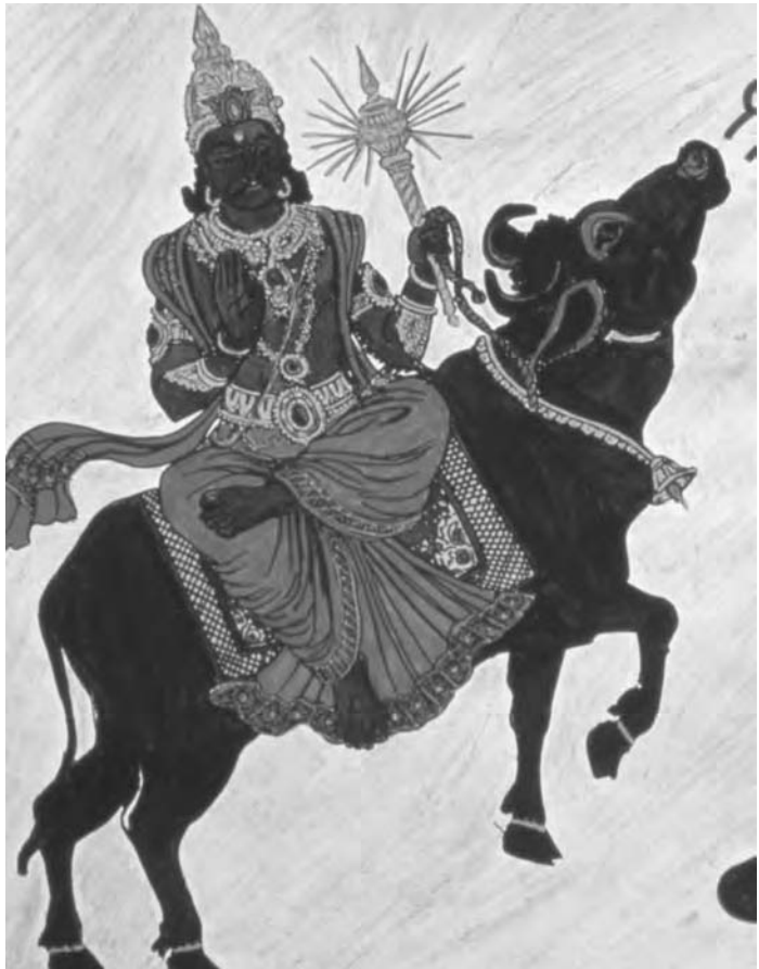
Yama, lord of death, riding his vâhana, the water buffalo

Yama came to be the god of death in later mythology, but he had wide range of roles in the earlier mythology. In the Rigveda Yama was one of the first pair. As such he was referred to as the first mortal (later being called the first human). His twin sister Yamî wanted him as her partner, but he refused. Later mythology charged him with incest. In the earliest mythology he was the son of Vivasvat, an early solar deity. Later he was assimilated into Dharma, god of social order, and made one of the guardians of the four corners of the earth (Lokapâlas). Yama was personified in the Katha Upanishad , and his talk with the youth