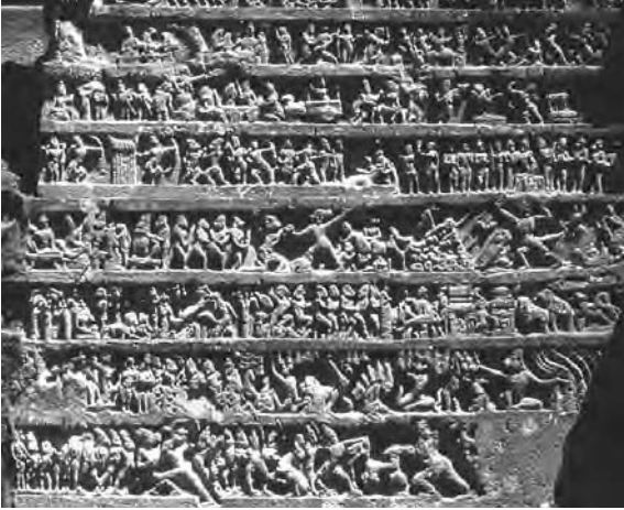
Battle scenes from the great or Mahâbhârata war

ally been said to have been dictated by the sage Vyâsa to his divine scribe, Ganeśa, who wrote it all down using his single tusk as the stylus. It is currently divided into eighteen parts, with two important appendices: the Harivamsha and the Bhagavad Gîtâ .