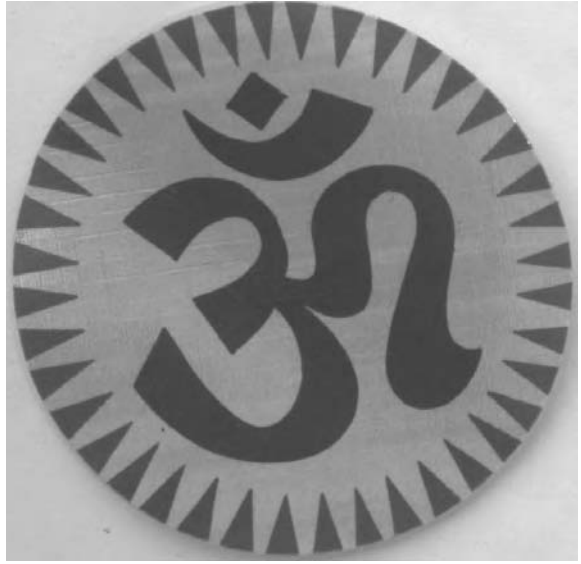
Om or Aum, the most sacred mantra of Hinduism

his life with his brother Nara. Nârâyana and Nara’s tapas heated up Indra’s throne, so he was determined to bring their tapas to an end. Indra arrived at their aśrama on his elephant Airāvata and roared that he would give the sages a boon ( vara ). But they ignored him. Next Indra sent frightening animals, and finally he sent his best—an army of apsaras (celestial damsels) and their attendants. The apsaras included Rambhâ, Menakâ, and Ghritâcî. The sages came out of their meditation and enjoyed listening to the singing and watching the dancing. Then Nârâyana decided to teach Indra a lesson. He slapped his thigh ( ûru ) and created a young woman more beautiful than all of Indra’s army of beauties. He named her Urvaśî (the one from a thigh). Indra’s beauties became afraid in the presence of such powerful sages. They apologized and propitiated the sages, who sent them all away with Urvaśî as a gift to Indra.