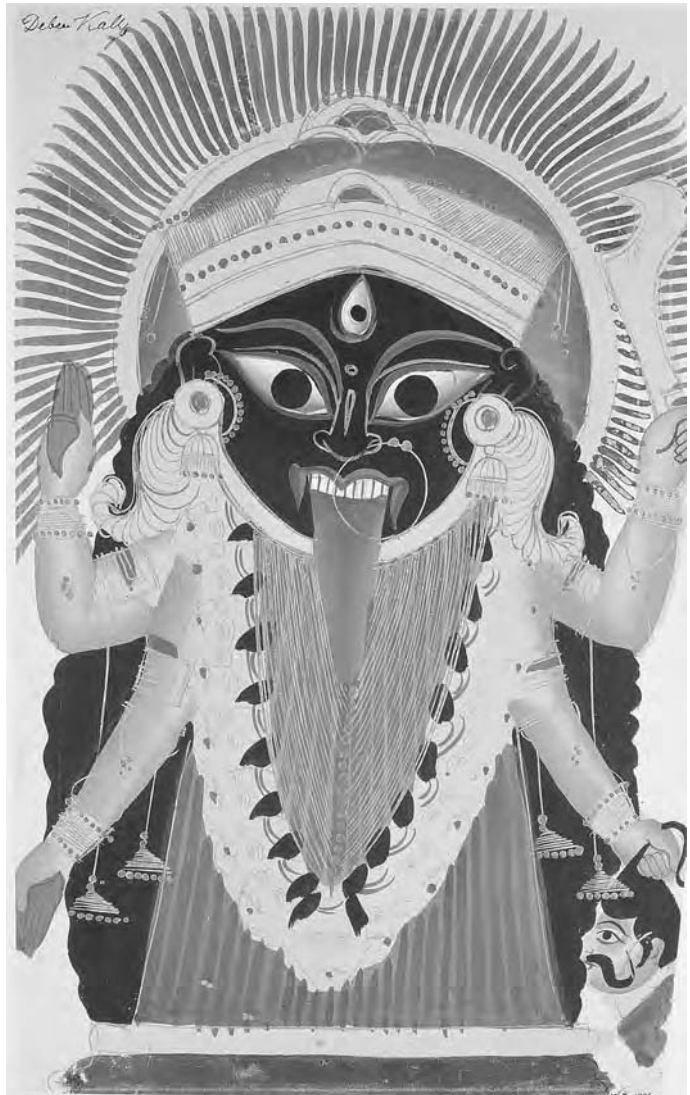
Kâlî, Hindu goddess of destruction, in an Indian painting from the nineteenth century

In some myths Kâlî appears as a voluptuous woman enticing both