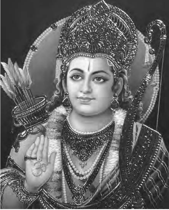
Śrī Râma, divine king and an avatâra of Vishnu

from raping her as he had done to so many women, including his nephew's wife. Râvana took Sîtâ to Lanka. Râma won the aid of Hanuman and Sugrîva and their monkey armies. (Was this a disguised reference to South Indians, Dravidians, helping Râma?) Hanuman built a causeway or bridge from the Indian subcontinent to Lanka, and Râvana was finally defeated. Technically, the reason for Vishnu's incarnation was complete. However, the myth's significance for modern India continued, with Râma's return to Ayodhyâ and setting up of his divine rule there. (In 1992 and 2002 Ayodhyâ was the focus of communal killings in the hundreds provoked by a desire to set up another period of ideal Hindu rule from Râma's birthplace and capital.)