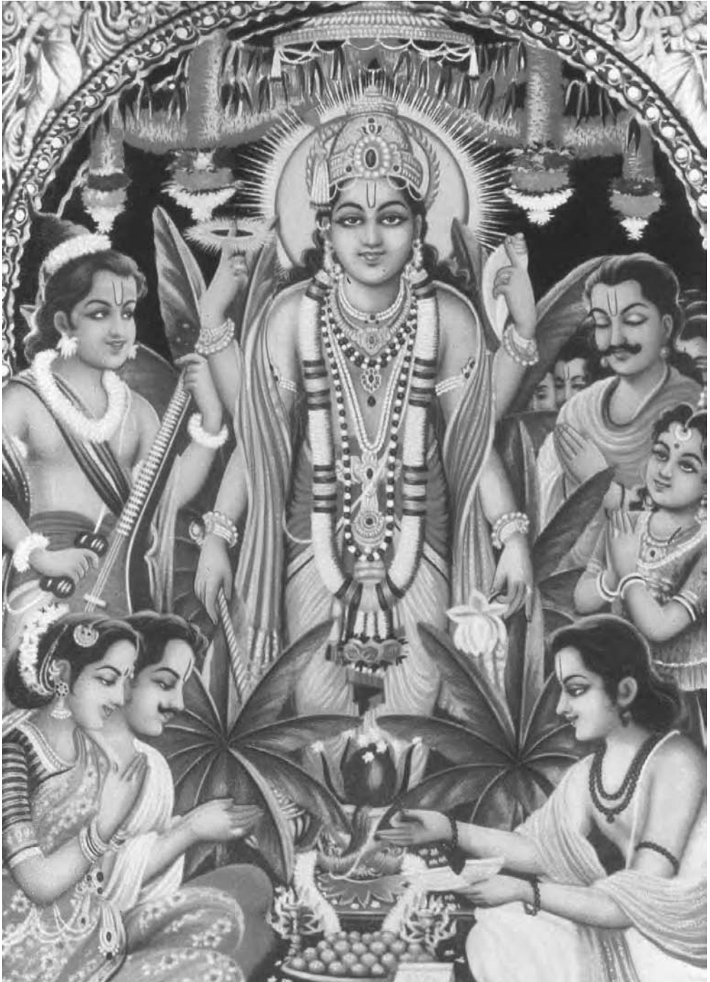
Vishnu, the preserver, who incarnates in time of need to bring righteousness back to earth (TRIP)