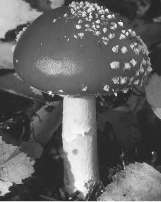
Soma, an ancient solar deity (the moon) and the drink of immortality, possibly from the pressings of a poisonous mushroom (TRIP)

driven away, reenacting the primordial combat between gods and demons or the conflict of the demons with the later guardians of soma, the gandhârvas .