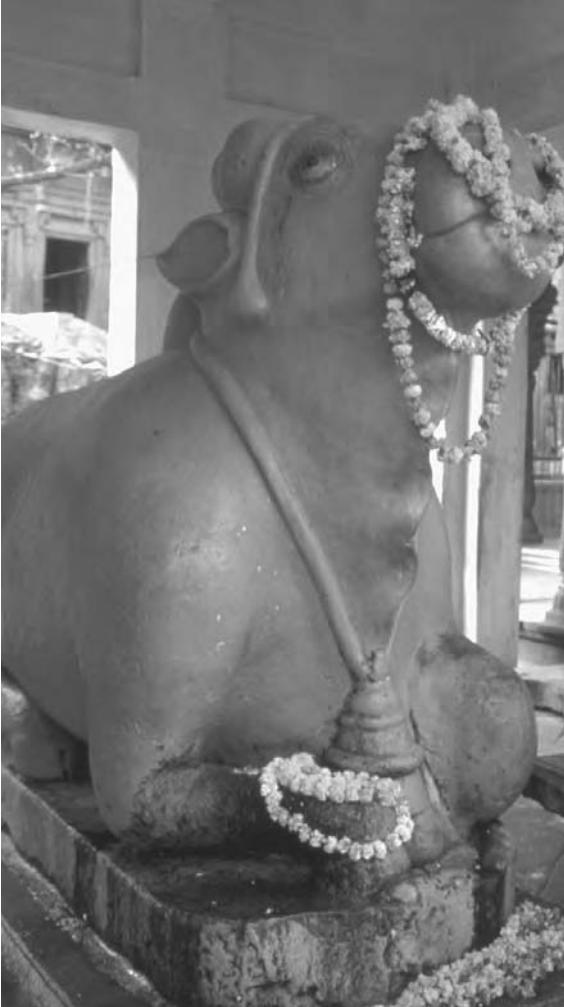
Nandi is Śiva's vâhana, his vehicle or mount.

In their next birth the two brothers became two trees in Ambâdi (Gokula) near the home of Śrî Krishna. One day as baby Krishna passed between the two trees, the two brothers received back their human forms.