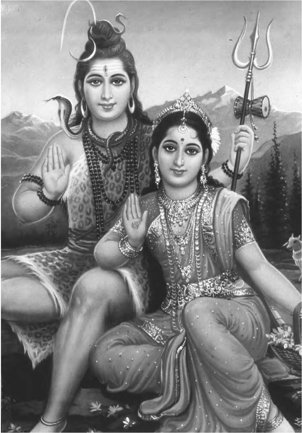
Pârvatî, daughter of Himalaya, wife of Śiva, and one form of the Mother, Devî (TRIP)