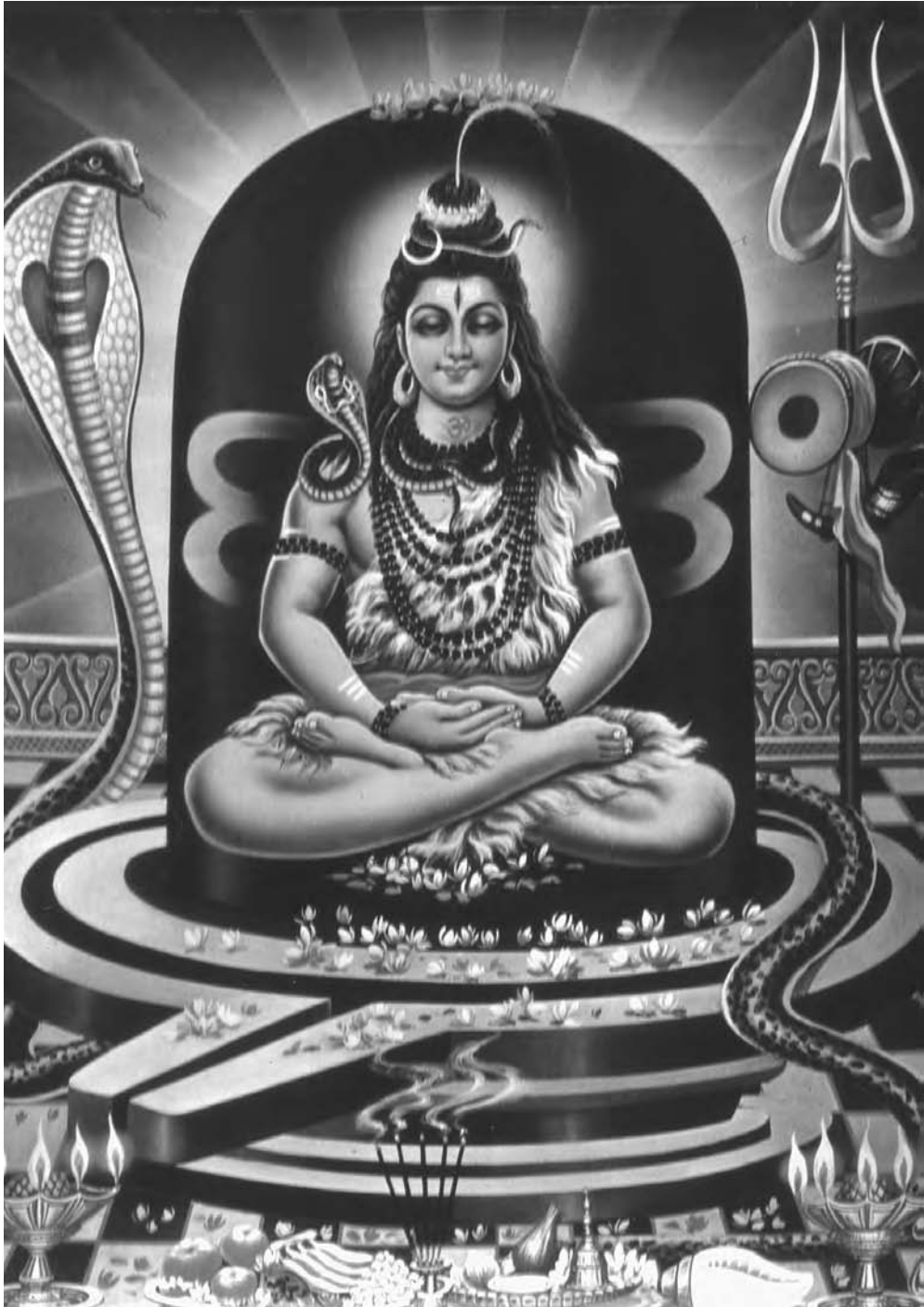
Śiva sitting in front of the Śiva Linga in this common representation (TRIP)