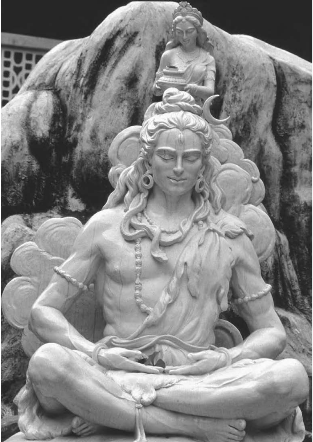
The heavenly Gangâ prepares to flow to earth through Śiva's matted locks.