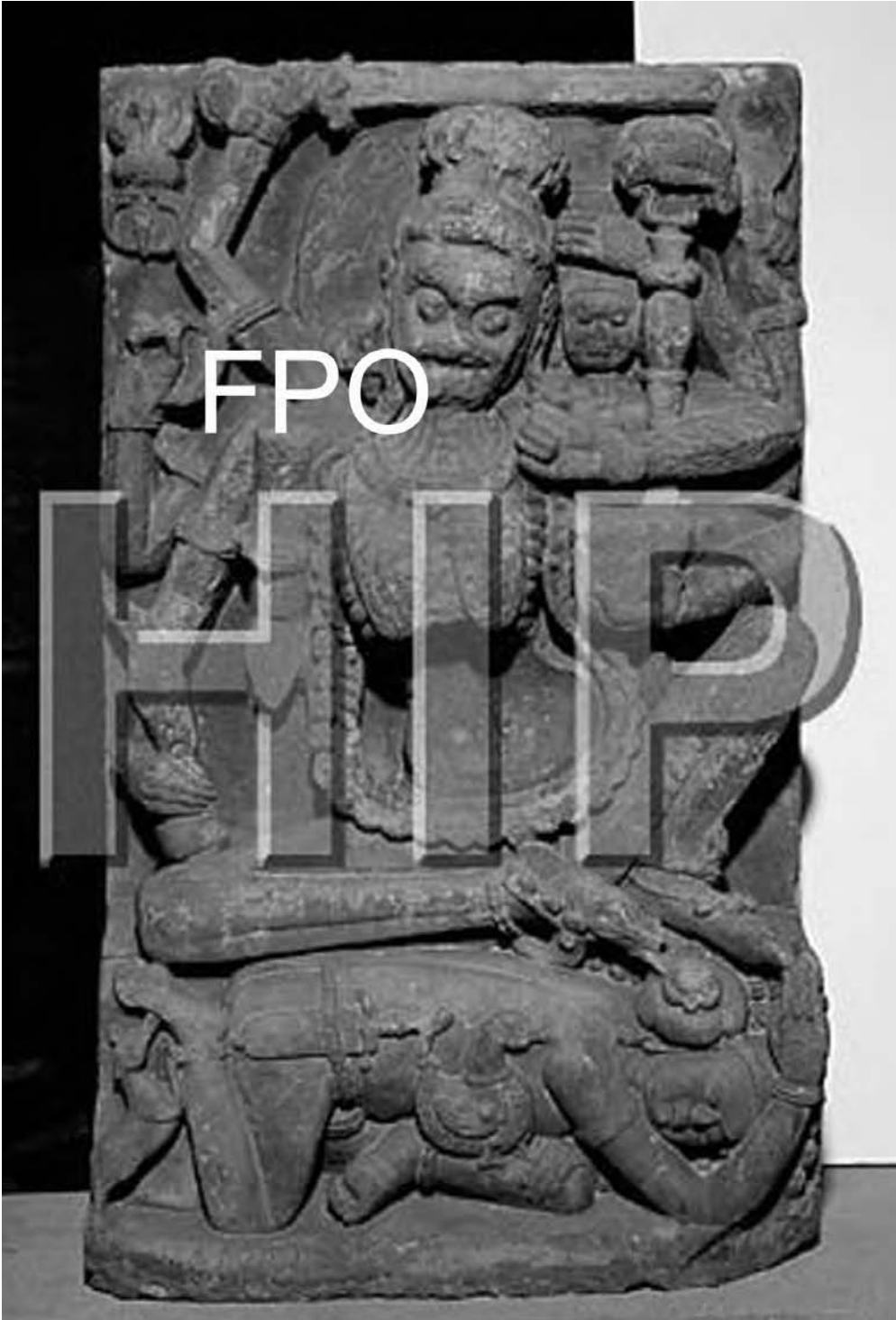
Sandstone figure of Cāmunda, the fierce, protective eight-armed mother, from Orissa, eastern India, ninth century.