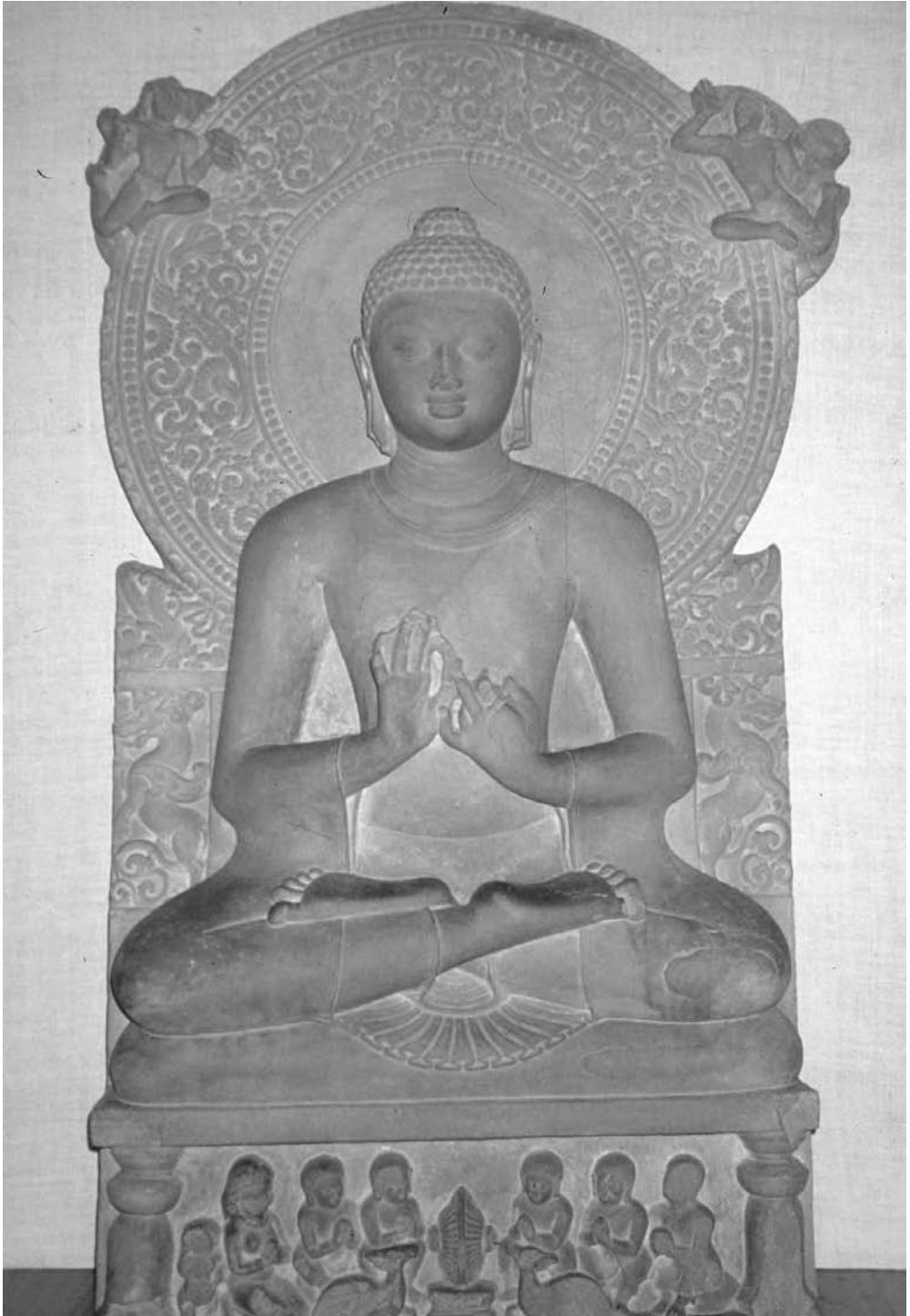
Gautama Buddha becomes merely an avatâra of Lord Vishnu in order to lead sinners astray with false teachings. (TRIP)