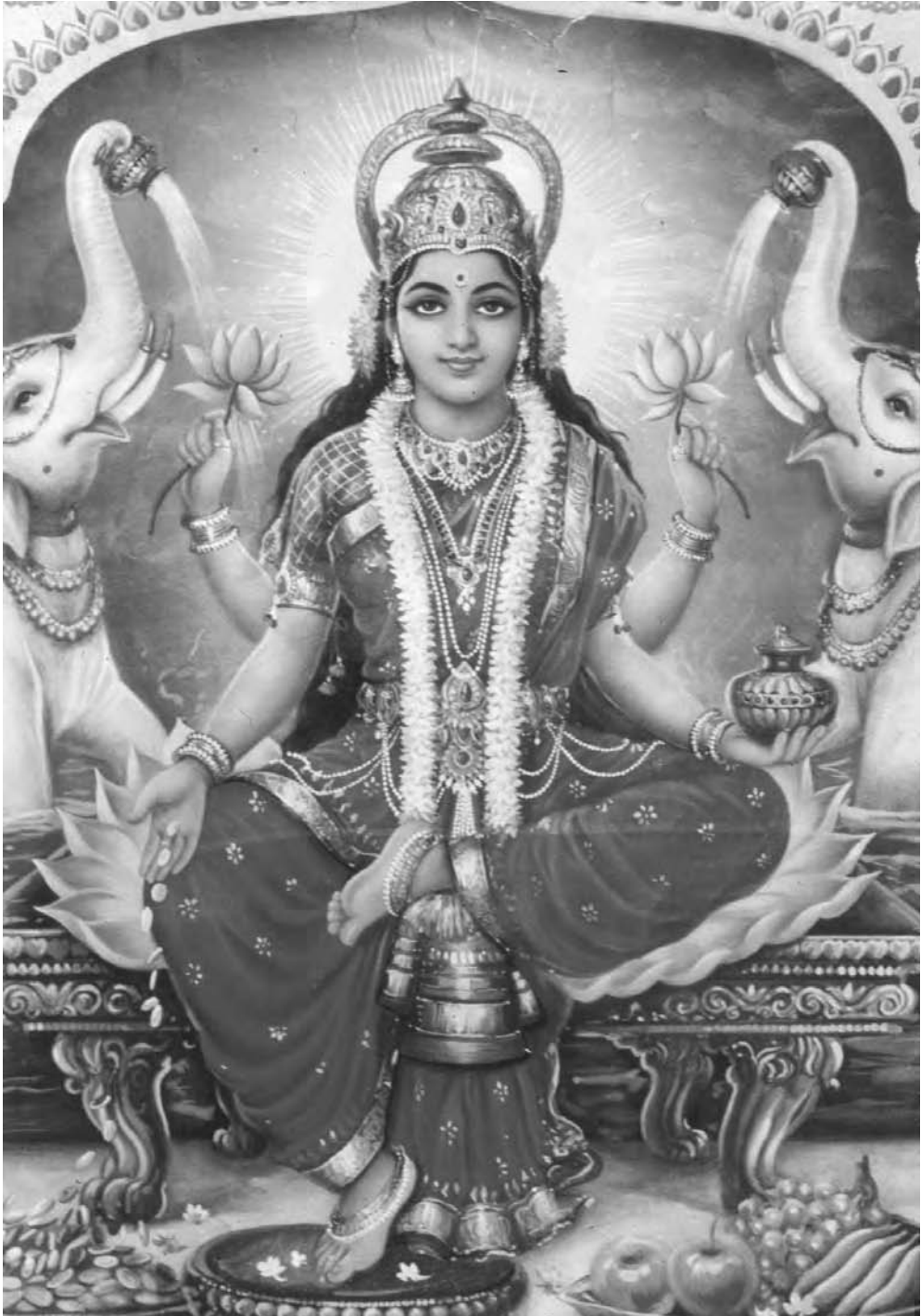
Lakshmi appears as Gajalakshmi, goddess with the elephants, giver of all that is good and bountiful in life.