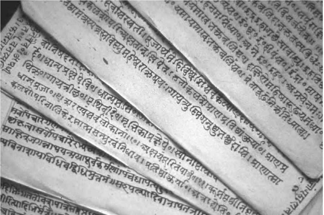
The oral Sanskrit prayers became the holy Vedas.

rifice. (For a slightly dated but elegantly written summary of this culture, see Joseph Campbell, The Masks of God: Oriental Mythology [New York: Viking Press, 1962], pp. 155–171.)