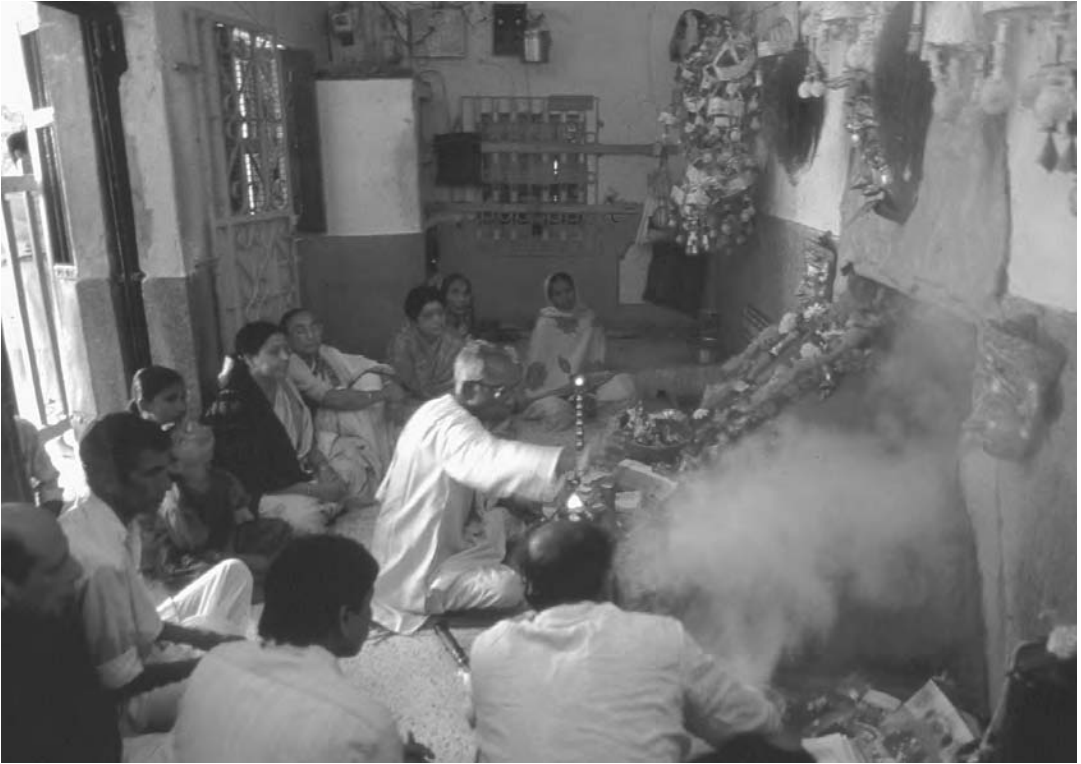
Pûjâ is worship, devotion, service to the divine, and a means to acquiring merit.