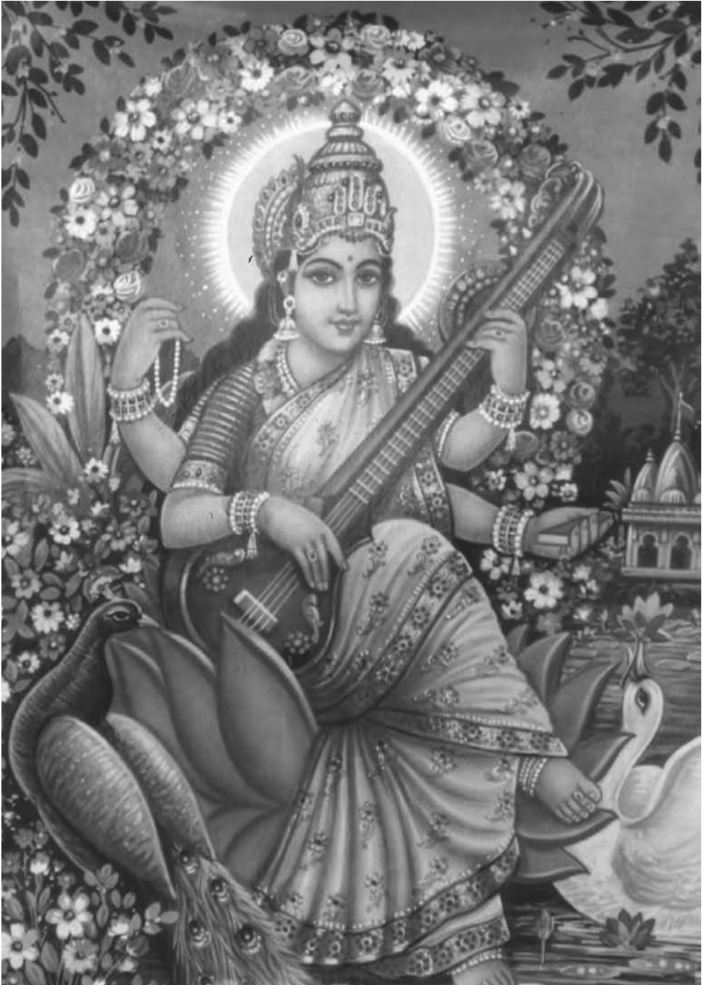
Sarasvatî, goddess of music, literature, and learning, was wife of Brahmâ but increased in popularity and importance. (TRIP)