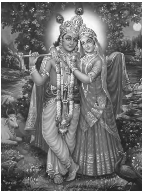
Râdhâ, gopi and favorite of Krishna

Râdhâ is one of the most popular figures in Hindu mythology and is even understood by some to be a manifestation of the Supreme. Râdhâ has many personas and a complex mythology. Râdhâ is the young, innocent maiden coming into the forest at night in response to Krishna's magical flute. Râdhâ is the favorite wife of Krishna (an incarnation of Vishnu) from his many wives among the cowherds of Vrindâvana (Gokula). And Râdhâ is the wife of Adhiratha (or Kalâvati) and the foster mother of Karna (the divine son of Kuntî and Sûrya). Which of Râdhâ's many faces appears in a story is said to be caused by the listener to her myths—she takes the aspects of the listeners' own mâyâ and is born from their projec-