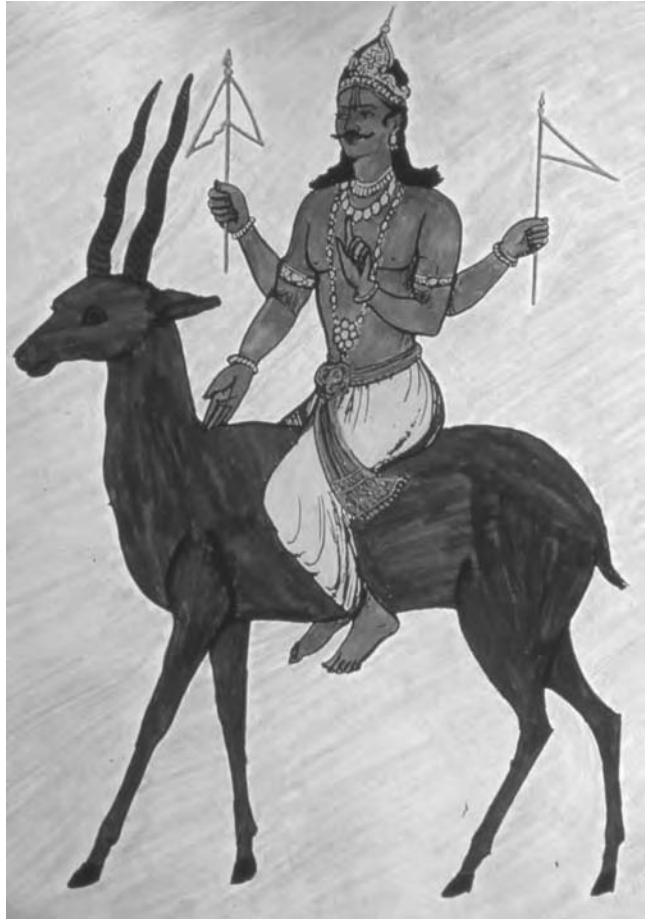
Vâyû, the wind, shown riding his vâhana, the antelope (TRIP)