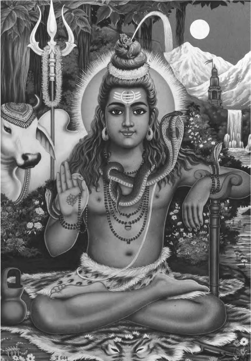
Śiva as Mahâyogi is the master ascetic. (TRIP)