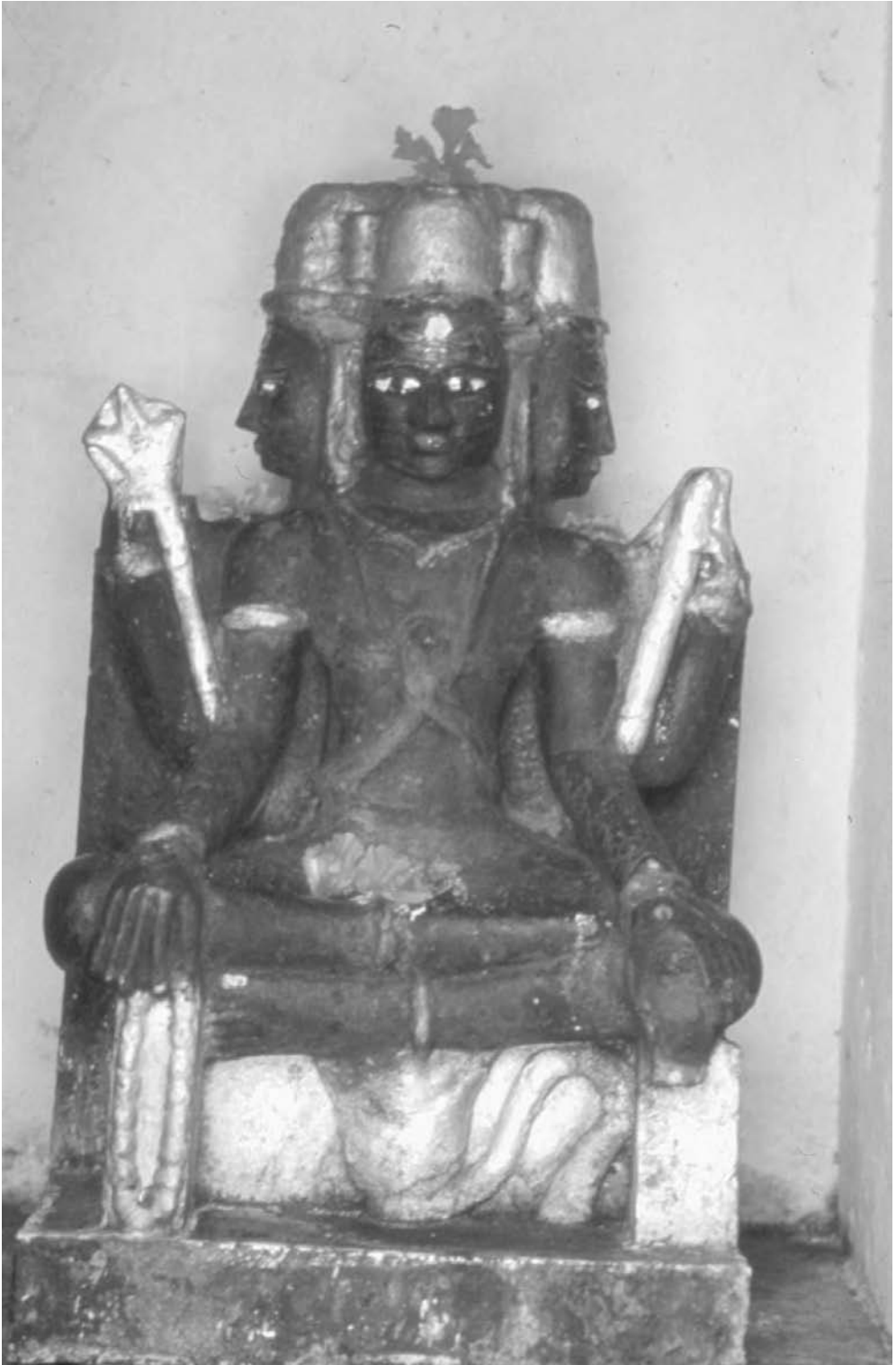
The four-headed Brahmâ is the creator in the Trimûrti or Hindu Triad, which also includes Śiva and Vishnu. (TRIP)