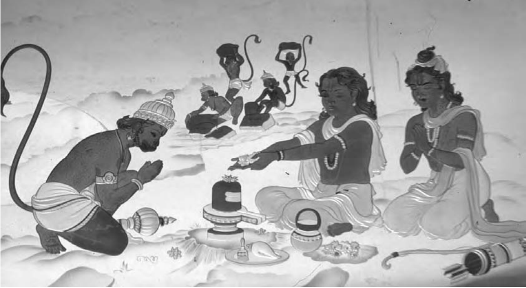
In the epic Râmâyana Hanuman serves Râma with pure devotion. (TRIP)

Bhavabhuti—were more secular than religious, more heroic than ascetic, and all quite tragic. By about the twelfth century the vernacular and regional poets like Ramayanas and Tulsidas had transformed not only Râma into the supreme lord but all elements including Râvana into loving devotion ( prema bhakti ). Everything had become an allegory of devotion, harmony, and bliss.