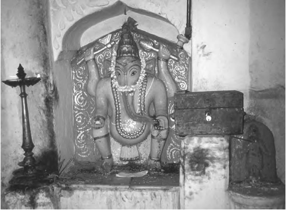
Ganeśa, son of Śiva, is worshipped for protection and as giver of wealth and remover of obstacles.

presided over by her husband Śiva, and presented her son. Śiva promptly apologized to all and gave Ganeśa command of his demon forces ( ganas ), acquiring a role that gained him the title Ganapati. Thus this version accounted for the origin of Vighneshvara, Gajânana, Ekadanta, and Ganapati, all different names of Ganeśa, without compromising Śiva as Lord of Yoga, asceticism. He was both father of Vighneshvara and still chaste.