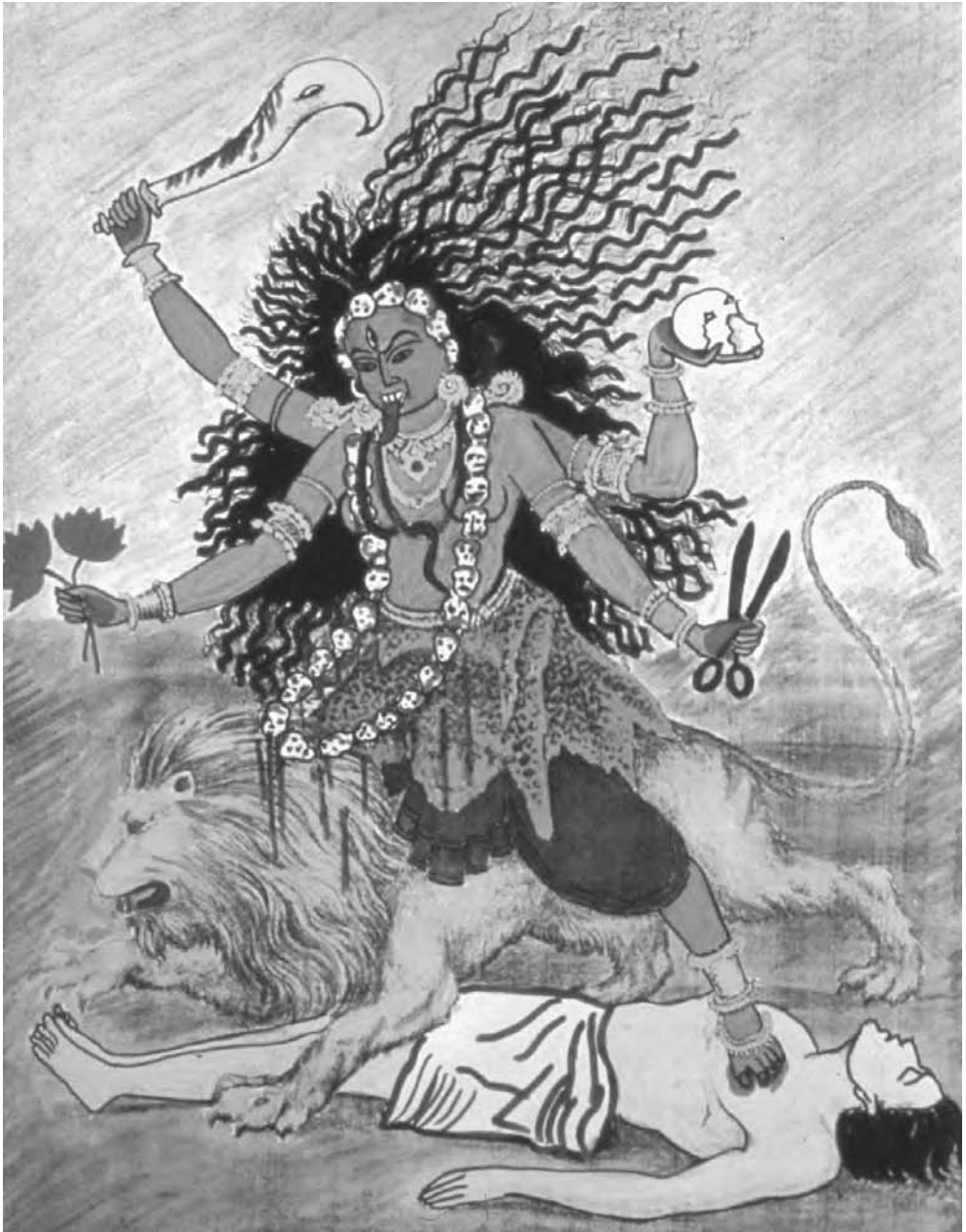
Kâli, wearing a kapâla-mâlin (garland of skulls) and leaving all evil as a corpse, is the destroyer of fear. (TRIP)