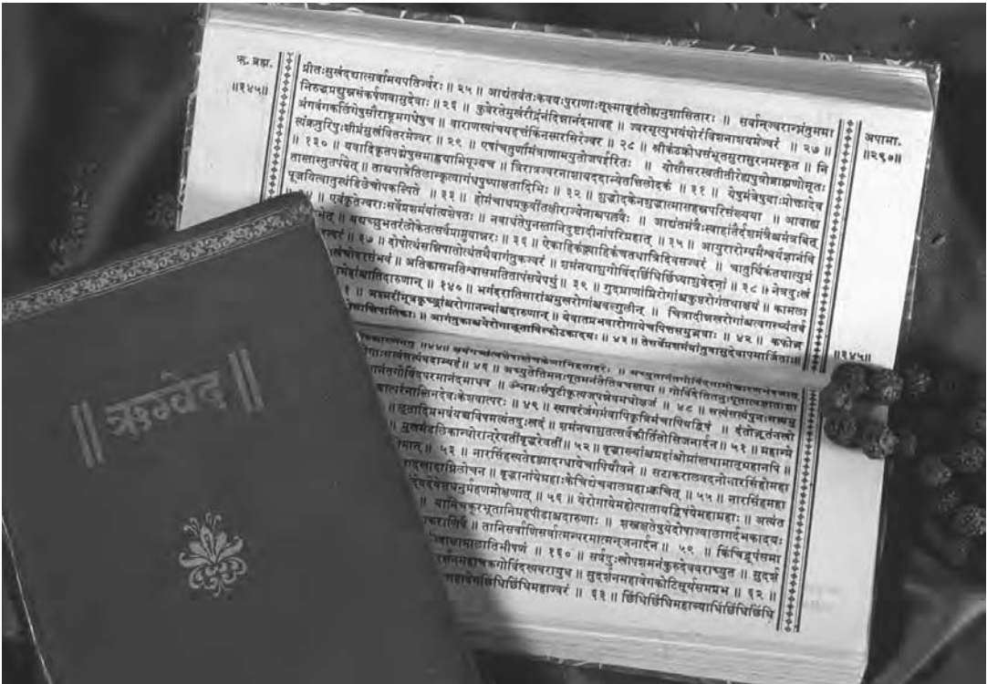
The Rigveda is one of the oldest continuously used scriptures in the world and Hinduism's most sacred.

contain a treasury of mythic themes, which were shaped and reshaped over the succeeding periods. There are several theological-philosophical hymns, such as the Purusha Śukta and the Nāsadiya Śukta , that suggest a high level of reflexive thought, reminding the student of Hindu mythology to look for multiple meanings in the same passage—metaphor, allegory, nonliteral allusions. This flexibility of Vedic thought encouraged later Hindu mythmakers to elaborate, conflate, and exchange quite freely the gods' life stories and personal characteristics, timelines, epithets, achievements, and failings.