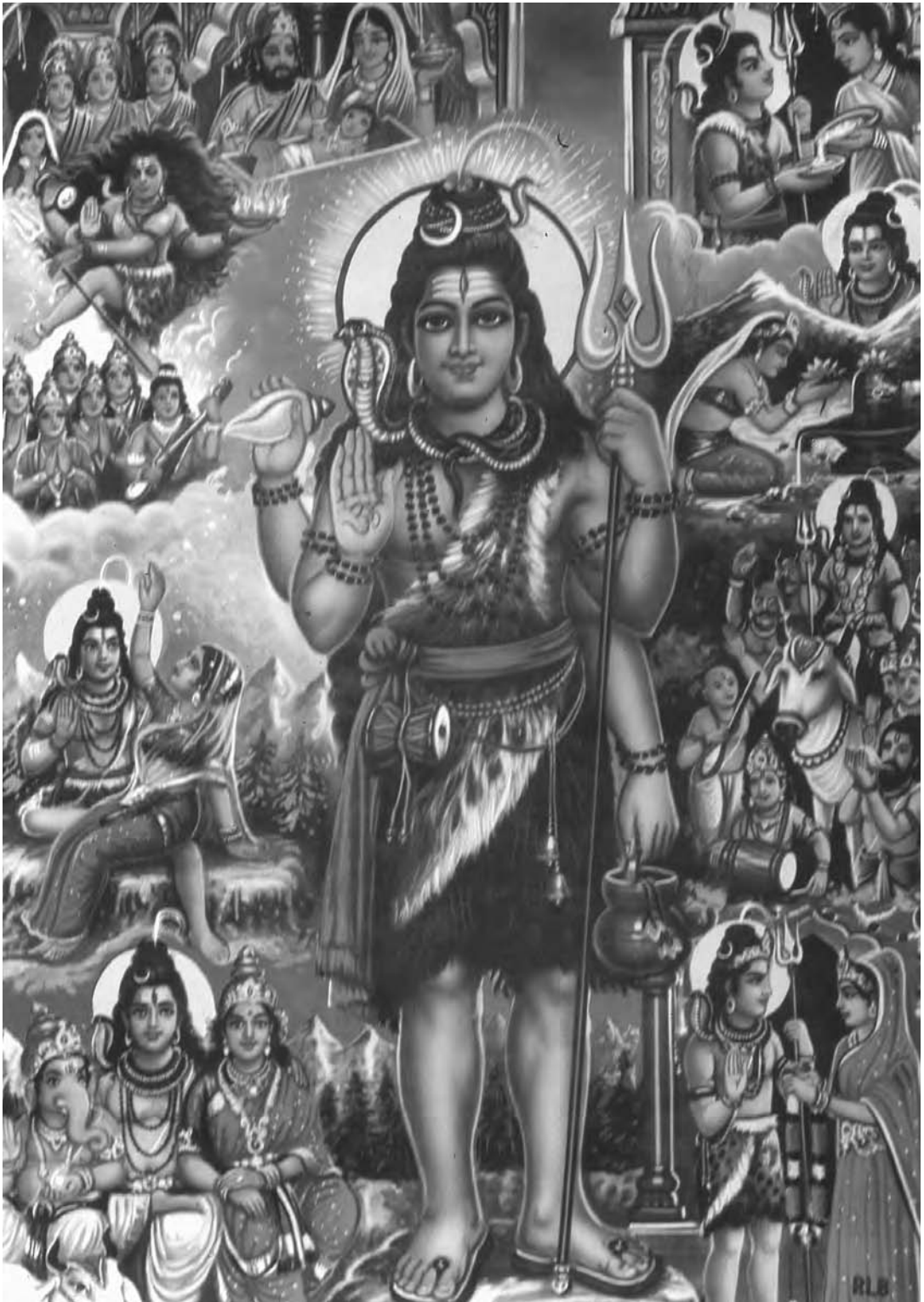
Śiva and key visual elements of his core mythology (TRIP)