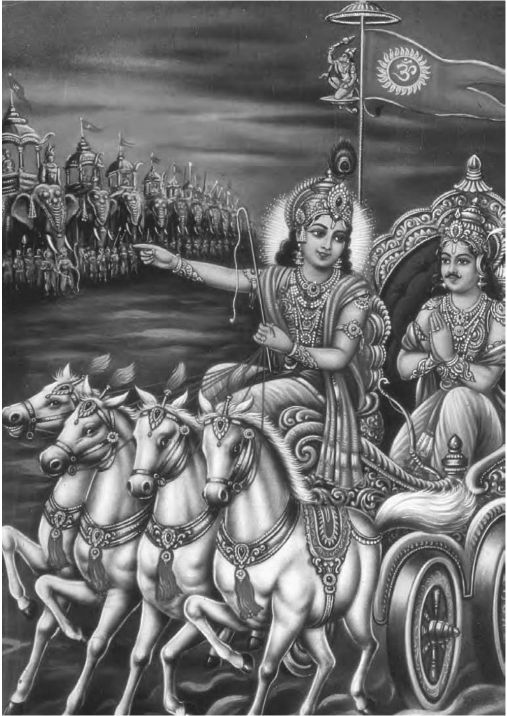
Arjuna is driven into battle by Lord Krishna.