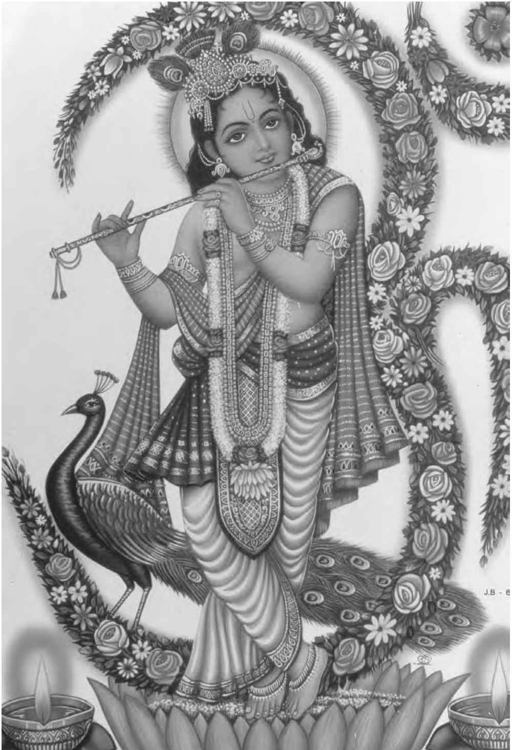
Śrī Krishna manifests in pure love, playing his magical flute in a call to devotion.