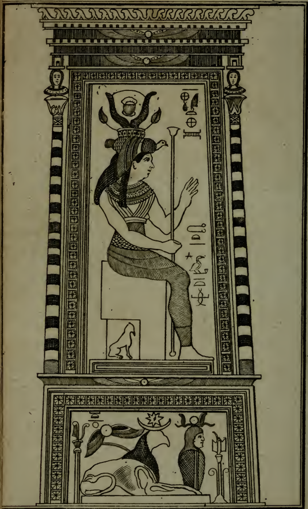
taken from the Isiac or Bembine Table now in the Bodleian Library.