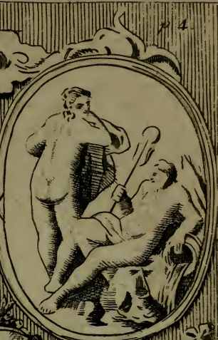
AURORA & TITHONUS