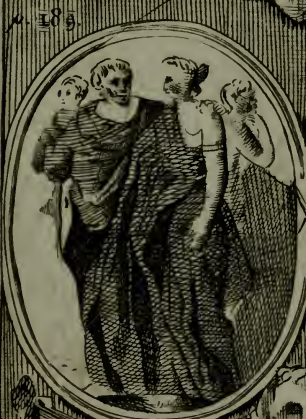
VIRTUES & VICES.