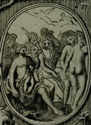
MUSES, GRACES PEGASUS & SYRENS