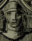
CASTOR & POLLUX.