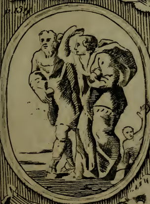
DEUCALION & PYRRA