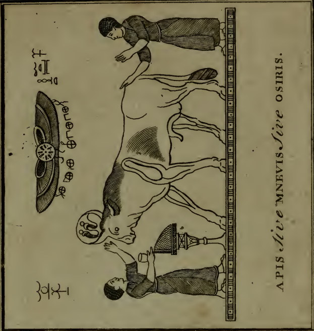
APIS. Sive MNEVIS. Sive OSIRIS.

Taken from the Isaac or Bentine Table now in the Bodleian Library.