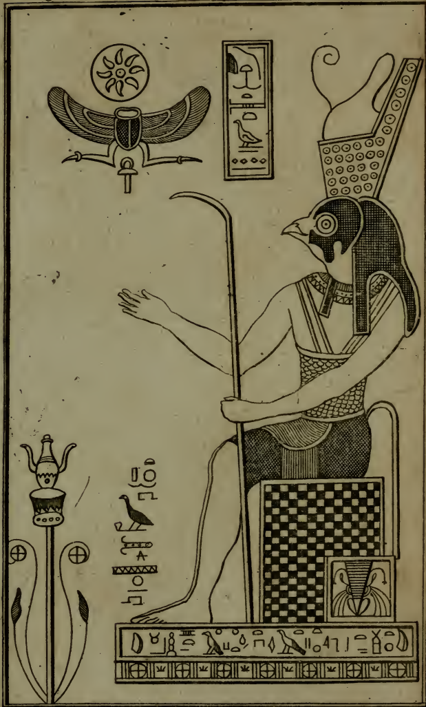
Taken from the Isiac or Bembine Table now in the Bodleian Lib