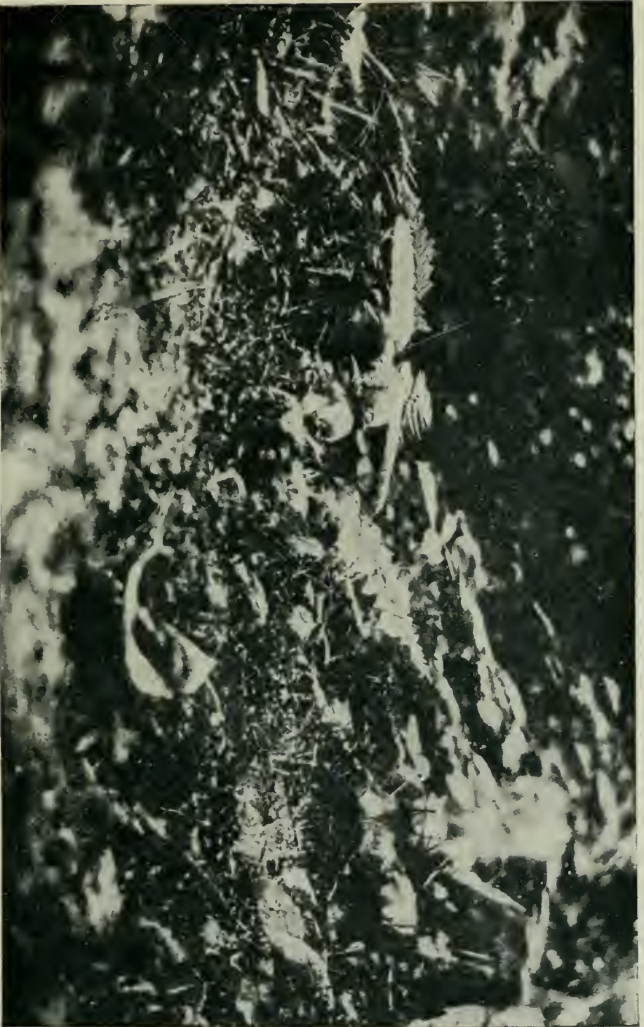
THE PHOTOGRAPH FROM CANADA