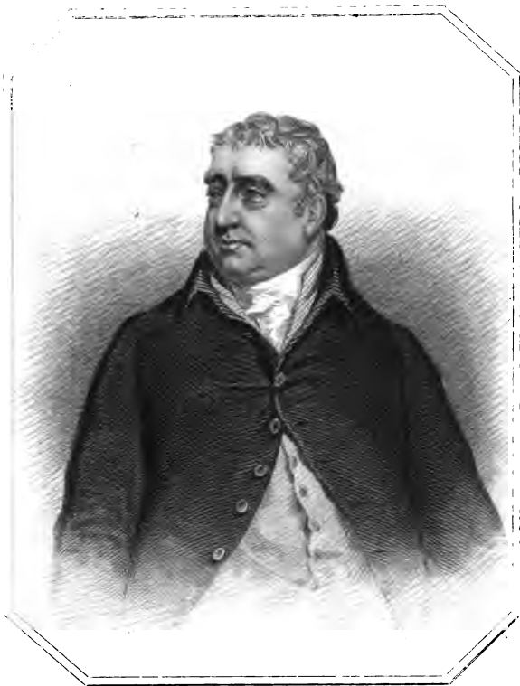
CHARLES JAMES FOX.