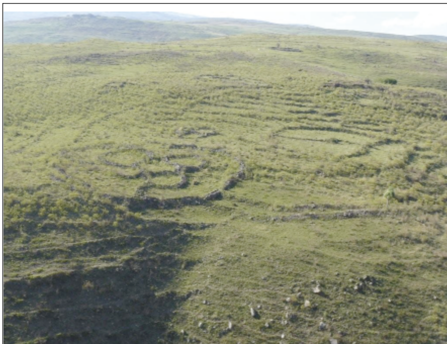
Figure 4: Ancient terraces surround large complex settlements covering more than 450,000 square kilometres in southern Africa. Some sections of these terraces have been estimated to be at least 5,000 years old, based on erosion patterns.

The picture gets even more confusing when you