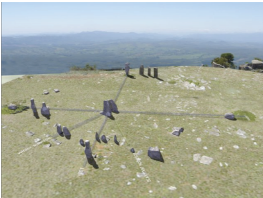
Figure 1: Eastern view of a 3D reconstruction of Adam's Calendar. The oldest version of the Egyptian Horus hawk stands in line with the spring equinox sunrise. To the right are the three aligned stones of Orion. Near the top right corner of the photo can be seen the faint outline of two pyramids, also aligned with Orion's rise.

centre of a larger eroded circular structure right on the edge of a high mountain cliff (figure 1). After dealing with the crashed aircraft and recovering the pilot, who was only suffering from a broken arm, Johan returned to investigate the monoliths. He also brought at least five academics to the site in search of explanations—and this is when he found out how amazingly blind "those who will not see" can be. Not one of them could see the true significance of the discovery, claiming that these were just random stones. This was a big blow to his original excitement, but like a true explorer he did not stop there.