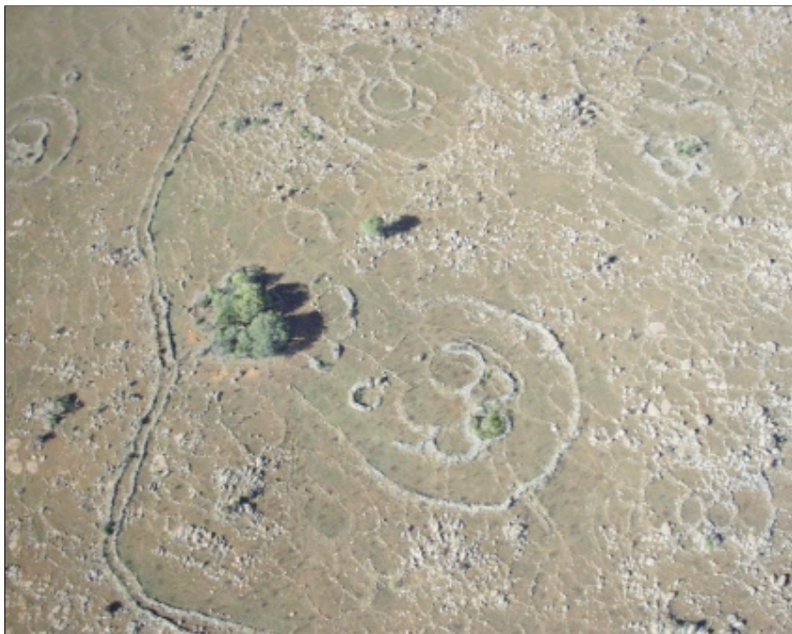
Figure 3: This is a small section of an ancient city that stretches for more than 20,000 square kilometres, linked by ancient roads, one of which can be clearly seen here from the air. This kind of detail is not at all visible to observers on the ground.

Boven, Machadodorp, Carolina and Dullstroom covers around 20,000 square kilometres, which is an area larger than modern-day Johannesburg. Most of the original settlement structures are well buried beneath the soil and can only be seen from the air by a trained observer.