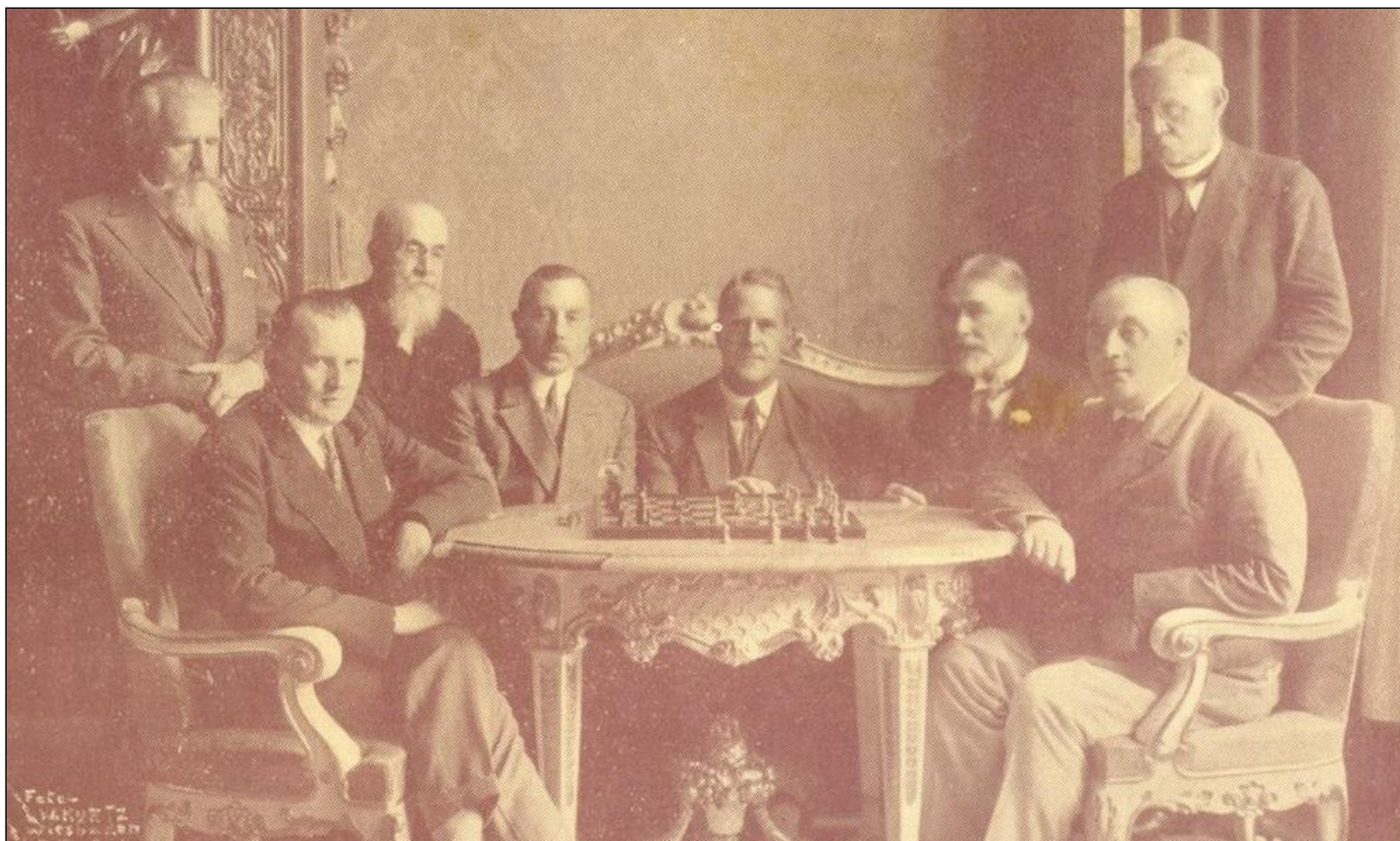
Alexander Alekhine and Efim Bogoljubow with (in the centre) the FIDE President, Alexander Rueb (1929)

As one of the participants in the match, I naturally find it difficult to indulge in a prophecy. As in former matches in which I have competed, I enter this combat with complete faith in myself and hope to retain my title.'