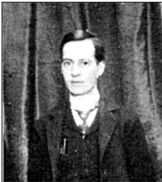
Harry Nelson Pillsbury

vernacular of the professional wrestling circuit if readers are to be kept awake.