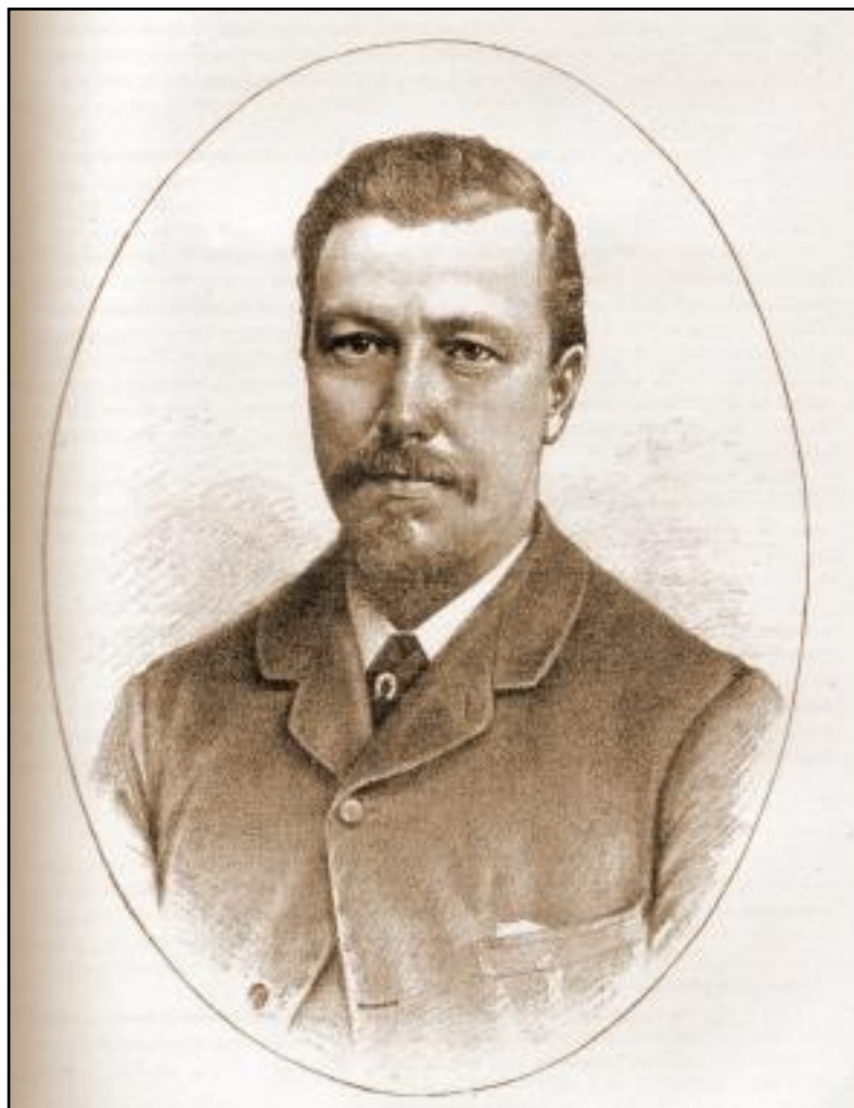
Joseph Henry Blackburne

opponent, Joseph Blackburne. In a rage, Steinitz spat in his face. Blackburne, who was no white knight himself, promptly picked up the short, squat megalomaniac and threw him right out the window.'