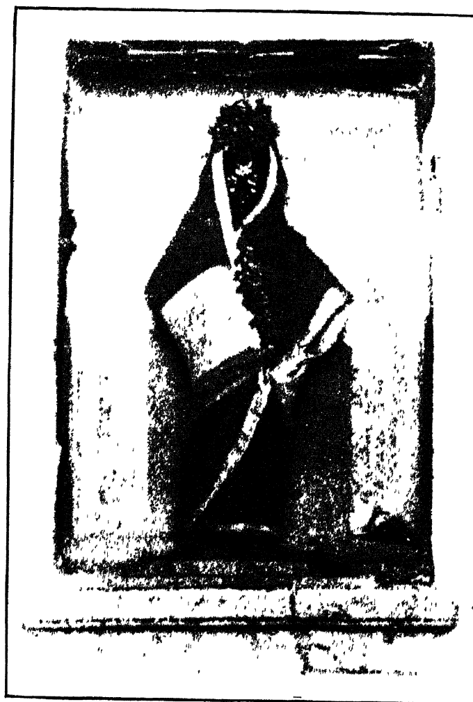
IMAGE OF JIJĀBĀĪ (OR ĀVALĪBĀĪ) TUKĀRĀM'S WIFE, NOW WORSHIPPED AT DEHŪ