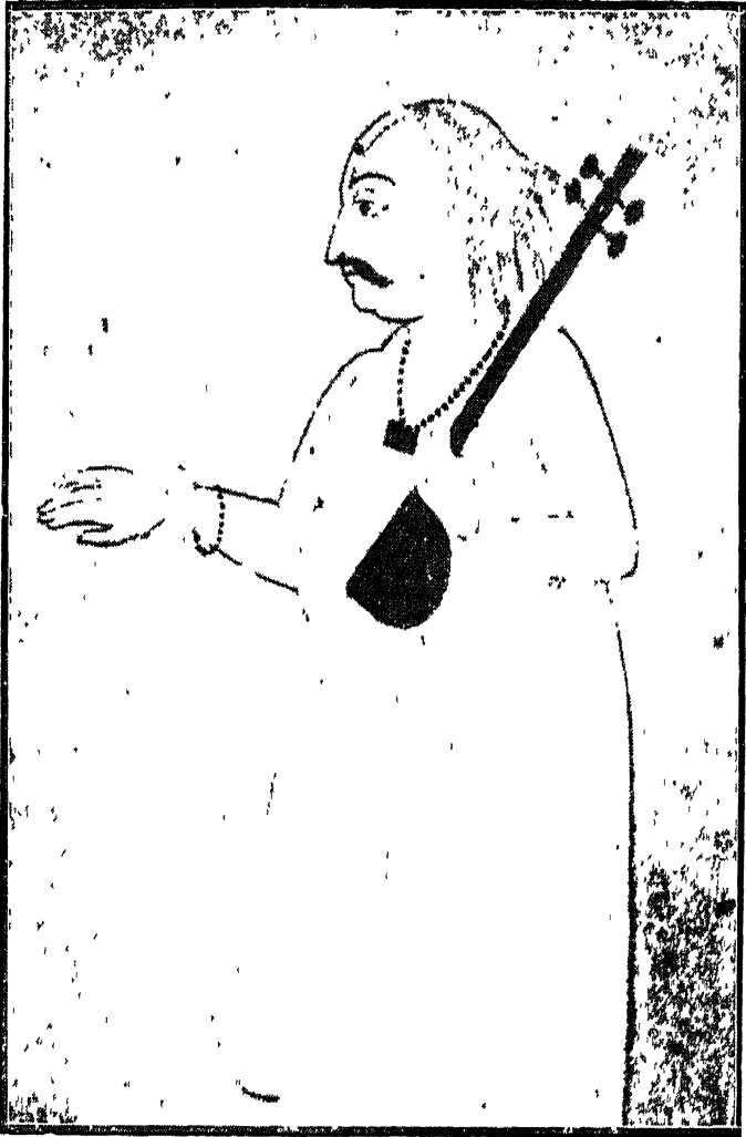
MAHĪPATI, THE BIOGRAPHER OF TUKĀRĀM