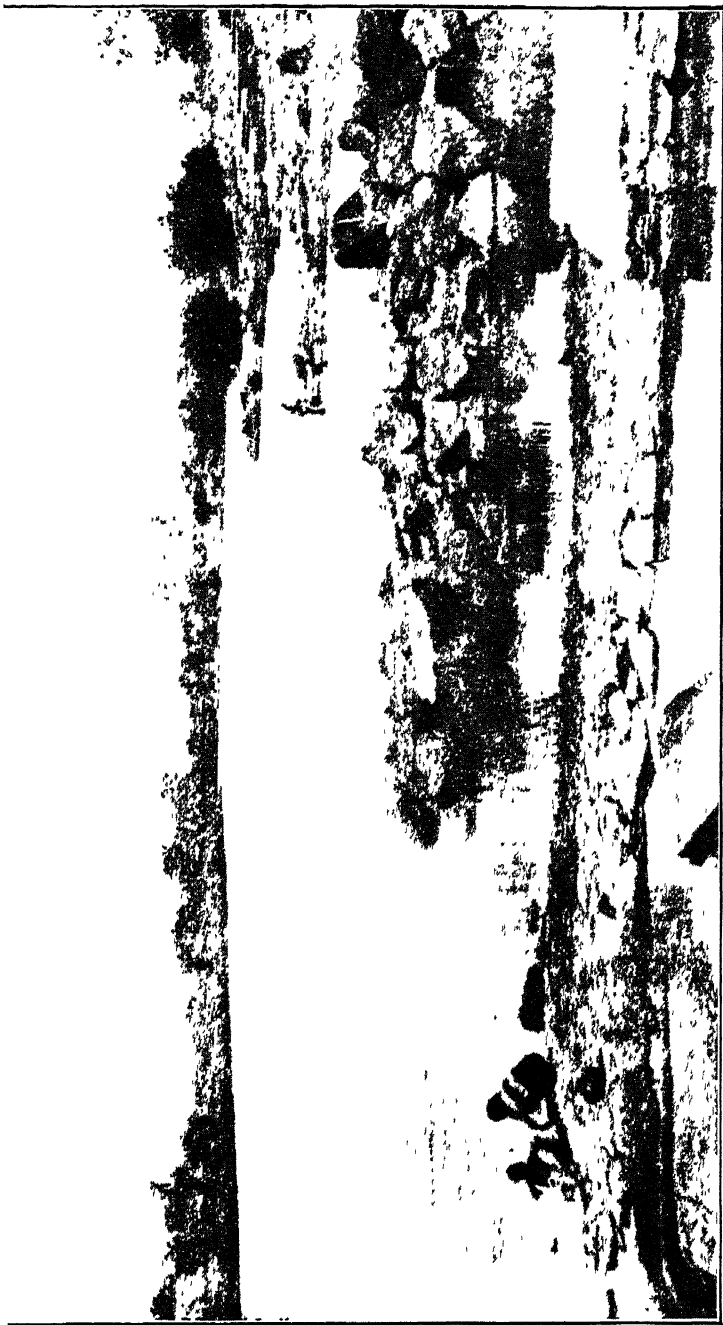
THE RIVER INDRĀYANĪ WHERE TUKĀRĀM THREW HIS POEMS AND WHERE HE 'DISAPPEARED'