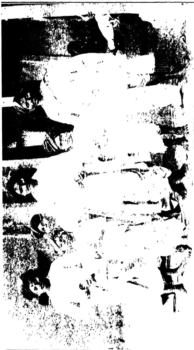
A kirtan band such as Tukārām LED