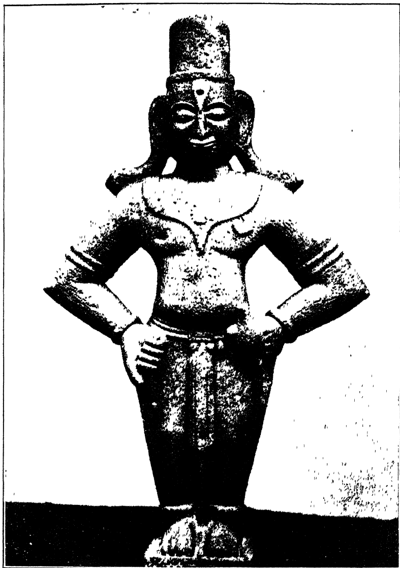
THE 'TĀKRITHYĀ' (IMITATION) VIHOBĀ AT PANDHARPŪR