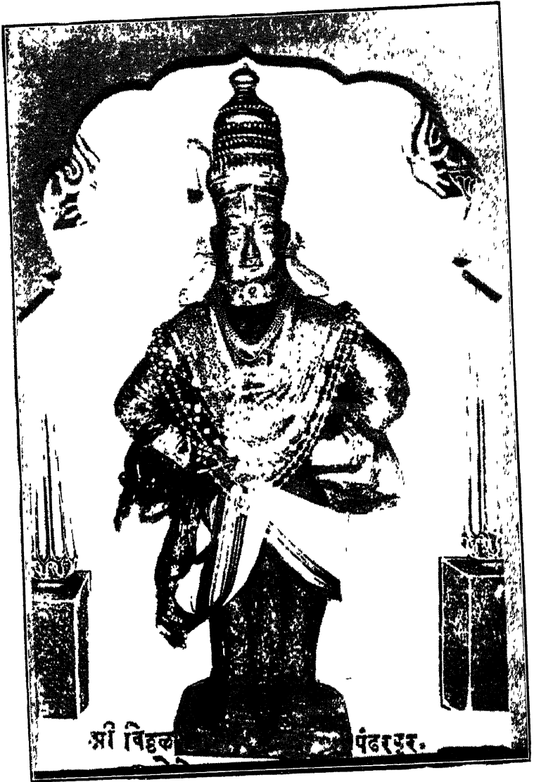
VITHOBĀ OF PANDHARPŪR