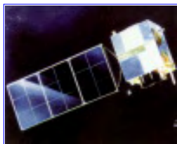
China-Brazil Earth Resources ER-1 Satellite. China has recently made significant improvements to its satellite remote-sensing/reconnaissance capabilities.