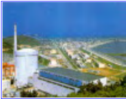
Qinshan Nuclear Power Plant, China's first indigenously designed and constructed nuclear power plant.

'China holds, in view of the complexity of the problems relating to the verification mechanism (for the Biological Weapons Convention), that every country should, in a down-to-earth way, seek effective and feasible verification measures, and formulate concrete steps to prevent abuse of verification, and to protect the rightful commercial and security secrets of the states parties. China considers that, while improving the convention's verification mechanism, international co-operation and exchanges among states parties in the sphere of biotechnology for peaceful purposes should also be strengthened.'