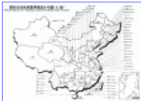
Figure 1.1 Geographical Locations of China's Major Aerospace-Defence Related Centres