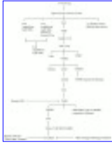
Figure 6.1 Development Linkages of Chinese MBTs

The joint Chinese-Pakistani MBT-2000/P-90 " Al Khalid " project is believed to use technology from the Chinese T-90II MBT (shown above).