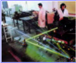
China laser research.

'Based on the significant level of PRC-Russian co-operation on weapons development, it is possible that the PRC will be able to use nuclear reactors to pump lasers with pulse energies high enough to destroy satellites. In addition, Russian co-operation could help the PRC to develop an advanced radar system using lasers to track and image satellites.'