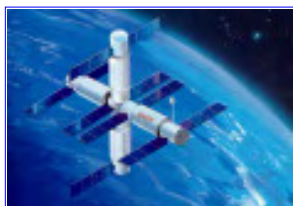
An artist's impression of China's proposed manned space station.