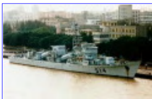
The Jianghu IV-class is China's most current frigate class, although more modern stealth classes may be under development.