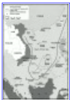
Figure 5.2 China's Vital Regional Strategic Interests