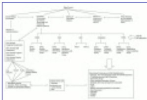
Figure 1.2 Summary of the Overall Organisation of China's Aerospace-Defence Industry