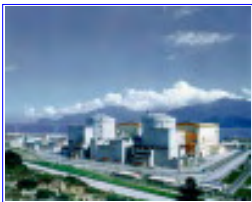
The Dayawan nuclear power plant.