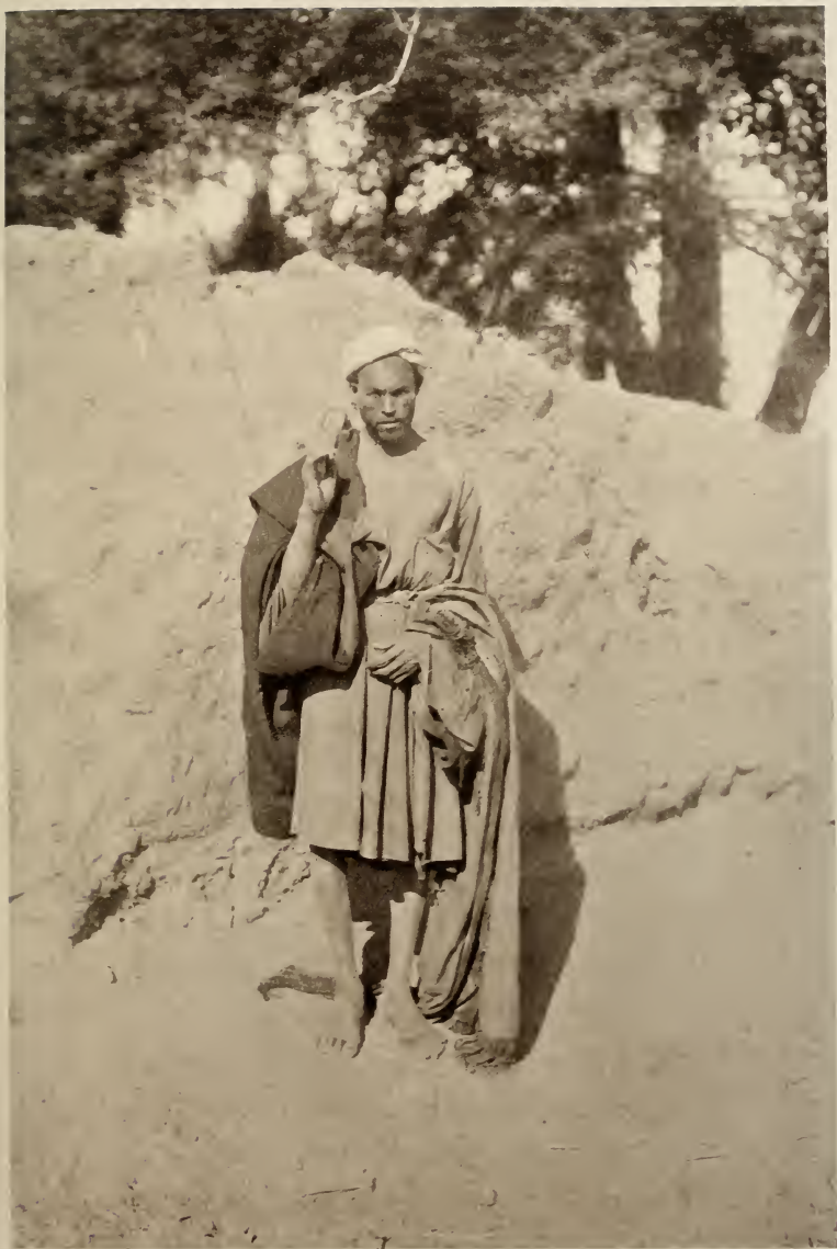
AN UPPER EGYPTIAN PEASANT.