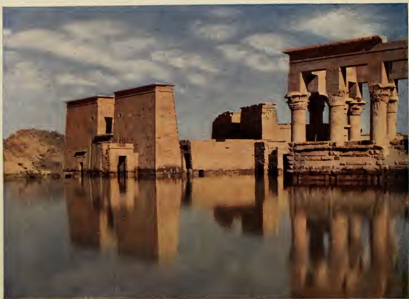
THE RUINS OF PHILAE.