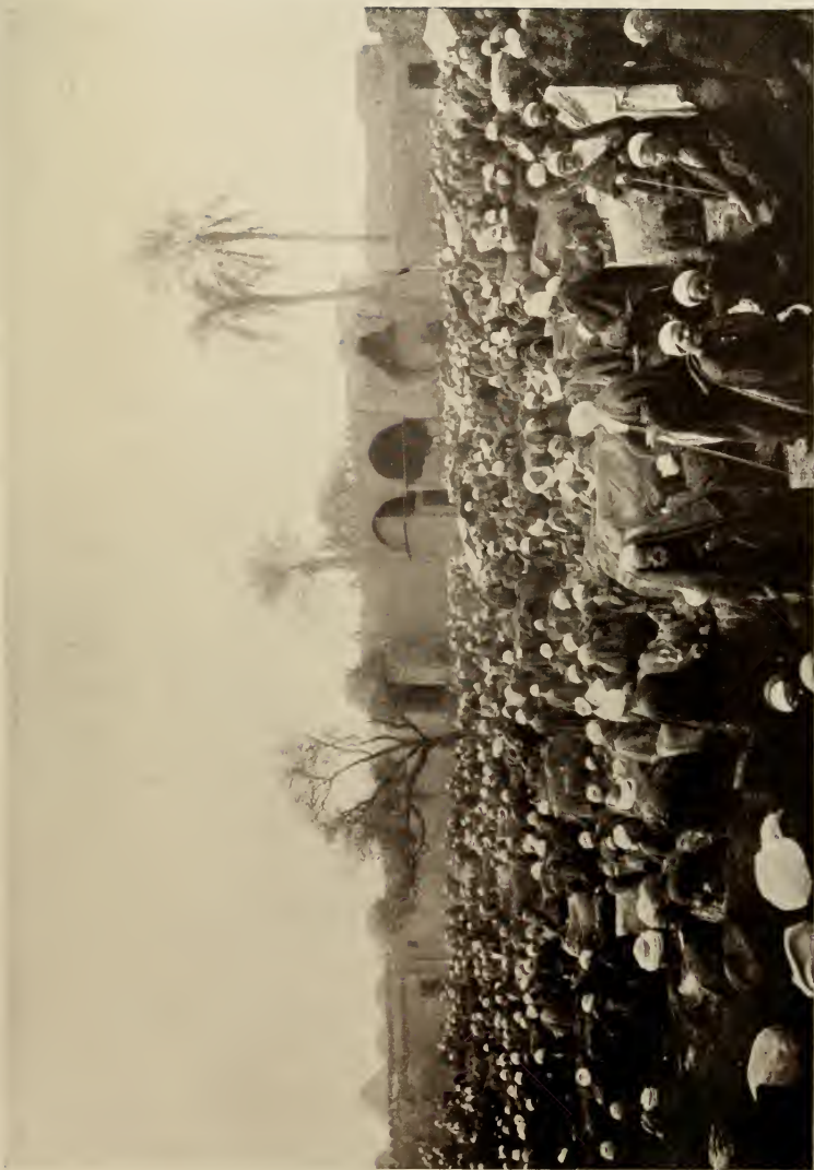
AN UPPER EGYPTIAN MARKET.