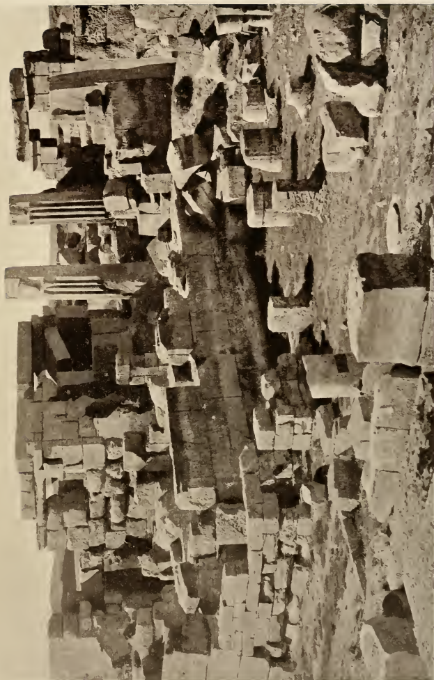
KARNAK. GENERAL VIEW OF THE RUINS NEAR THE SANCTUARY.