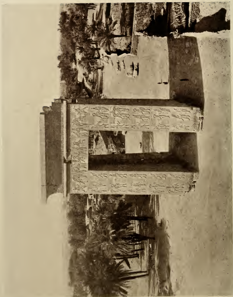
KARNAK. PTOLEMAIC GATEWAY IN FRONT OF THE TEMPLE OF KHONSOU.