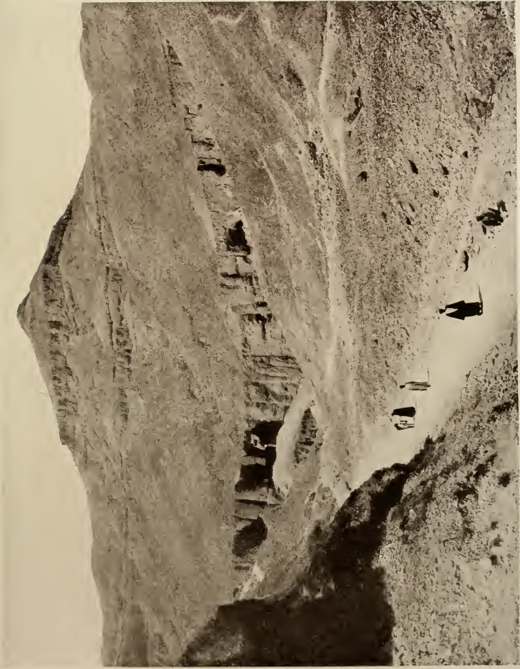
THEBES. THE TOMBS OF THE KINGS.