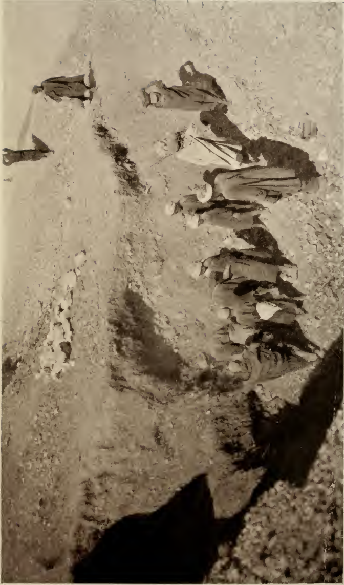
EXCAVATIONS AT KOM-EL-AHMAR.