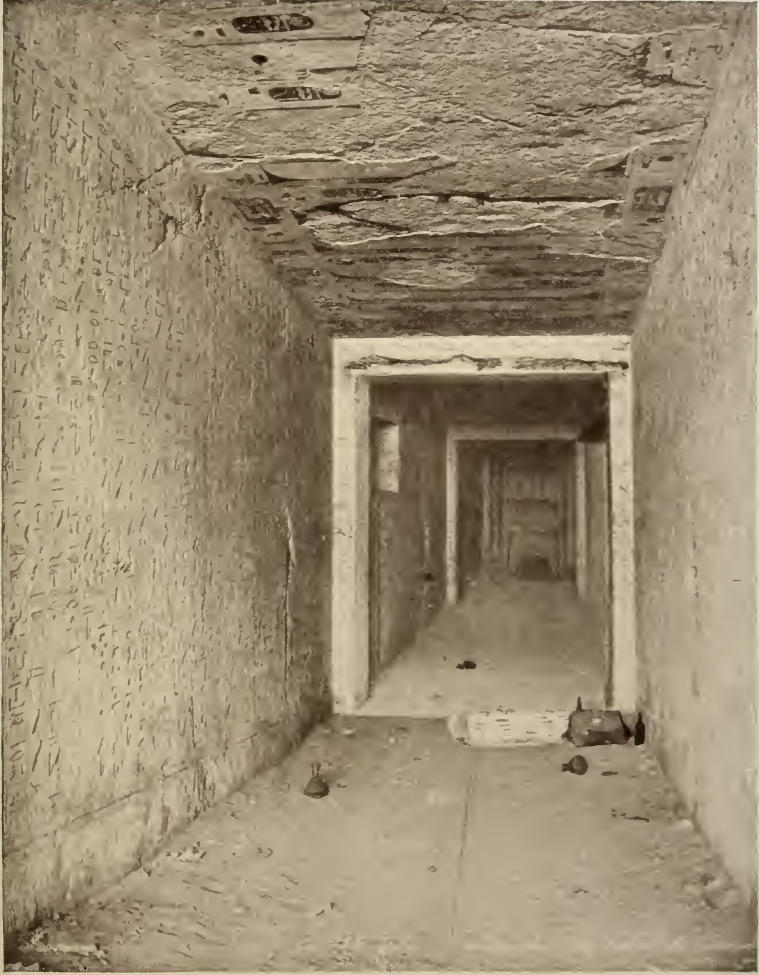
ENTRANCE TO ONE OF THE ROYAL TOMBS IN THE VALLEY OF THE KINGS.