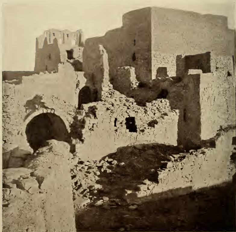
THE CONVENT OF ST. SIMEON, NEAR ASSOÛÂN.