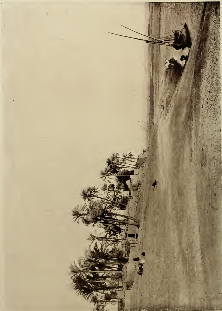
THE NILE, NEAR ASSOUÁN.