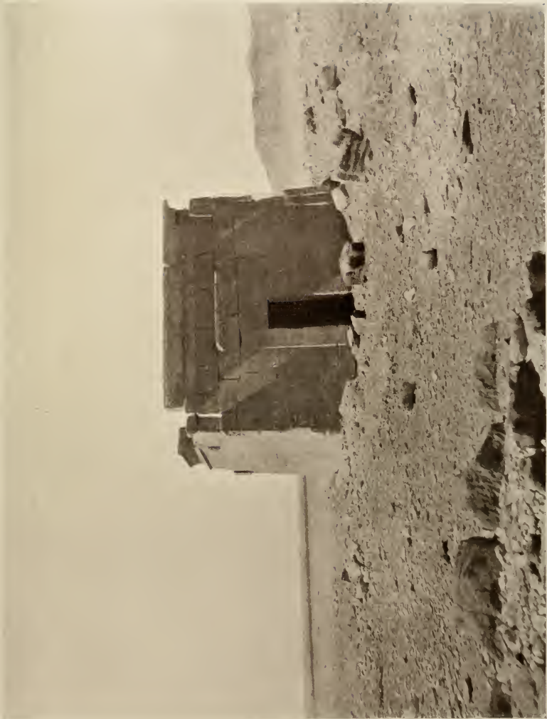
EL-KAB. SMALL TEMPLE BUILT BY THE VICEROY OF ETHIOPIA FOR RAMSES II.