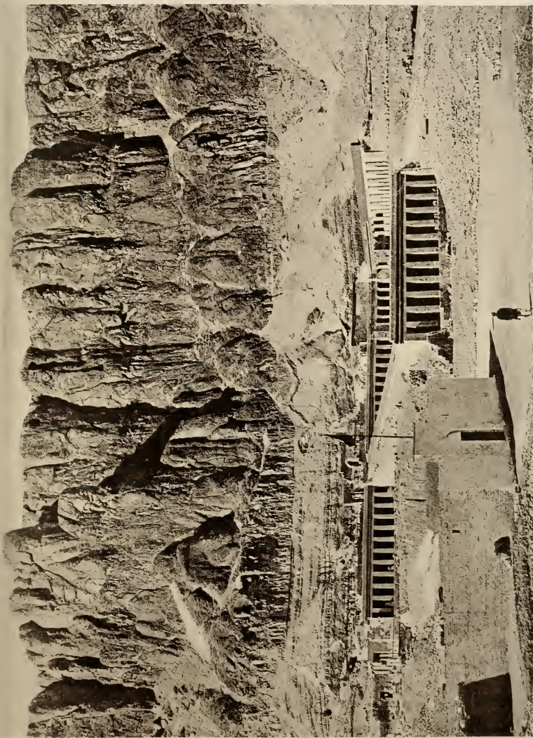
THE HILLS OF THEBES WITH THE TEMPLE OF DEÛR EL-BAHARI AT THEIR FOOT.

(The Temple of Thot is situated on a higher hill behind these cliffs.)