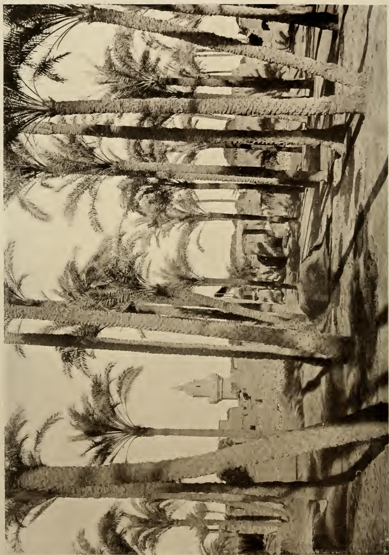
A TYPICAL MIDDLE EGYPTIAN VILLAGE.