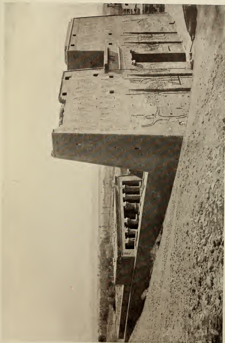
EDFOU. GENERAL VIEW.