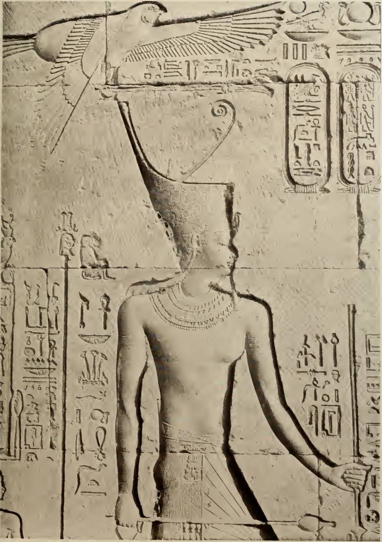
DENDERAH. RELIEF ON THE OUTSIDE WALL.