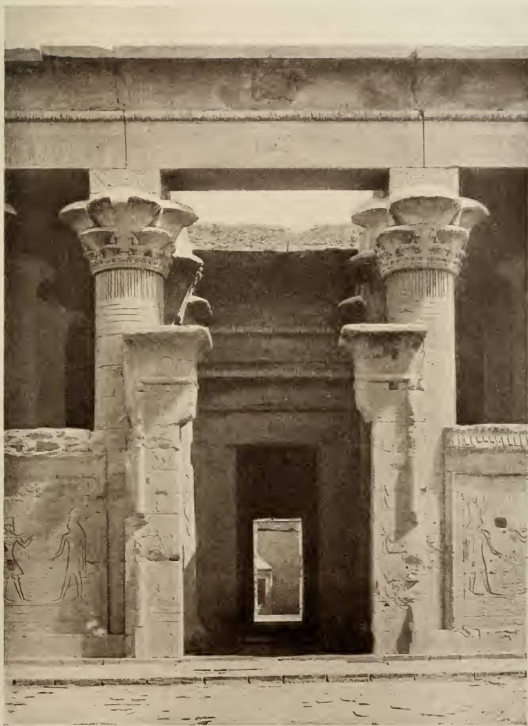
EDFOU. ENTRANCE TO THE MAIN TEMPLE.