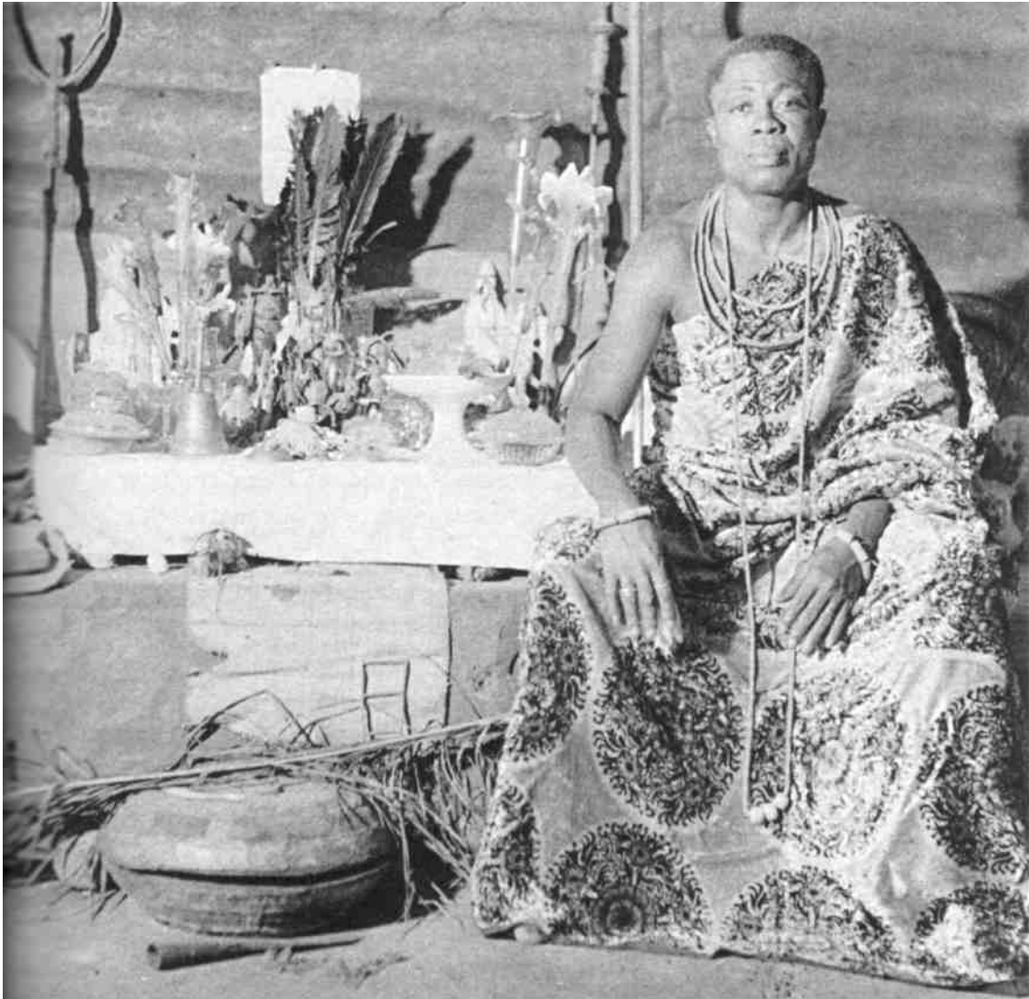
A babalawo from Benin City, Nigeria, c. 1950.

The second method of divination used by the babalawo employs the opele , a chain containing eight halfseed shells that with a single toss will provide the eight symbols necessary to identify the one odu that applies to the client's problems or needs. In common practice, the opele is used for "everyday" problems, whereas the ikin is used for initiation and for serious issues.