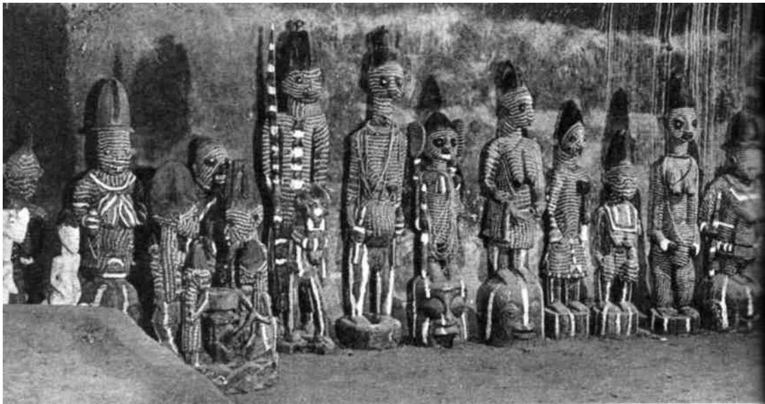
Orisa figures at the main shrine, Oshogbo, Nigeria, 1950.

"First," I replied, "there is no point in fighting with the dead. Second, no matter what kind of an SOB your father was when he was alive, there are two facts you have to understand: first, you wouldn't be here without him, and second, whatever he 'was' he 'isn't' anymore! That trip is over, those experiences simply a small addition to the experiences of previous lifetimes. Now, instead of carrying all that negative energy, which impedes your growth and progress, instead of continuing to deny the love you were never allowed to express, you can make up and go forward with your life. And the way to do that is to finally tell him how much love you had for him and how much love you