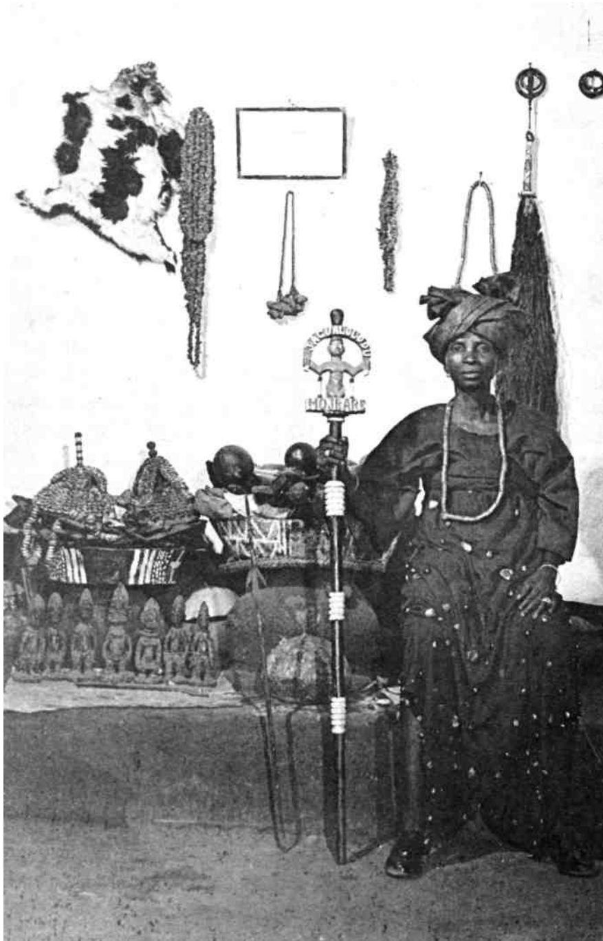
Sango priestess in front of a family altar filled primarily with Ibeji (twin) figures in honor of generation upon generation of twins in her family, 1950.