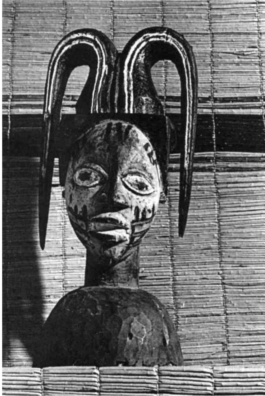
Mask of Ogun in his hunter aspect, worn on top of the worshiper's head, southwest Nigeria, c. 1950.