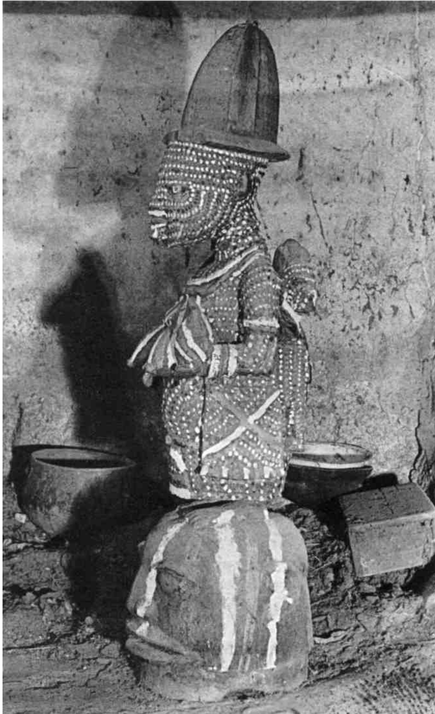
Epa mask with figure of a pregnant Yemonja with baby on her back, from the main shrine of the palace in Oshogbo, Nigeria, 1950.