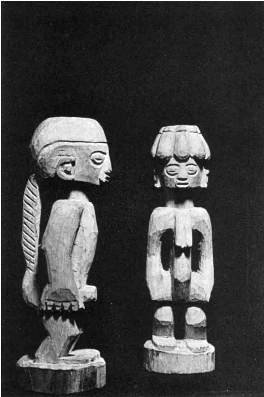
Pair of Esu figures, Imodi, Nigeria. The male figure is Esu as hunter. The female has medicine bottles for a hairdo.