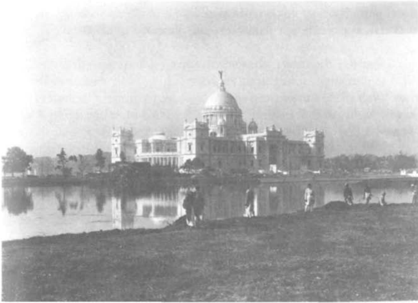
11 Victoria Memorial, Calcutta, designed by William Emerson (1905–21).

Clive, Hastings, and other ‘heroes’ from whose exploits the British could convince themselves that their past in India had been ‘glorious’.