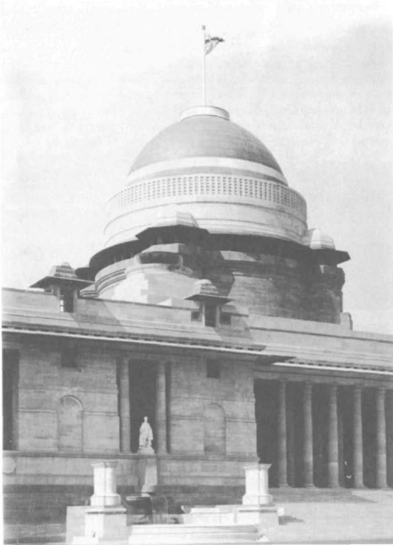
12 Viceroy's House, New Delhi (now Rashtrapati Bhavan), designed by Edwin Lutyens (1913–31). Note the use, together with the European-styled colonnade, of such Indic forms as the horizontal overhanging chajja, clustered chattris (cupolas), and a dome and encircling railing modelled on the ancient Buddhist stupa at Sanchi.