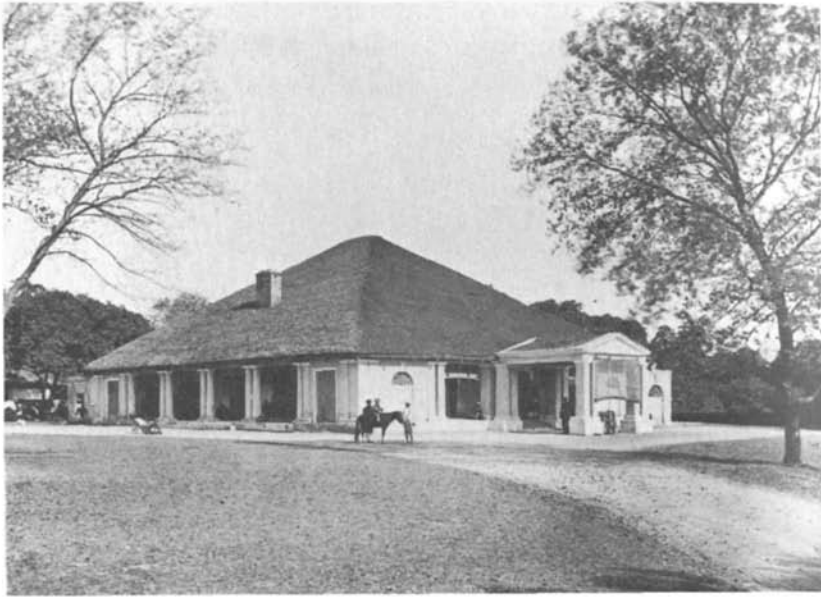
13 Bungalow, Allahabad (1866). Note the expansive thatched roof, encircling verandah, and placement in the centre of a large compound with curving entry way.

impress Indians with the power and authority of the British, while at the same time affording a way of regulating entry. Indians were almost never allowed beyond the verandah, where much business was transacted, and they were at all times at the mercy of uniformed chaukidars and chaprassis who protected the British residents from unwelcome visitors (and themselves often profited in the doing). 11