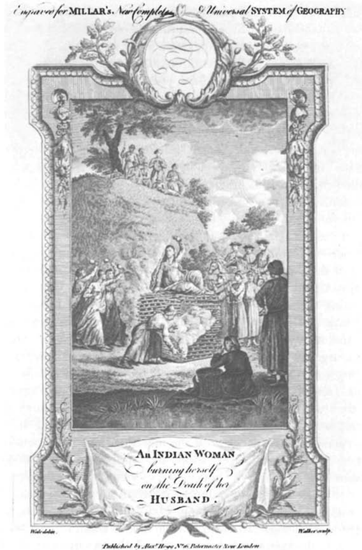
4 An Indian Woman Burning Herself on the Death of her Husband (date and author unknown, but probably c. 1810). A product of the late eighteenth and early-nineteenth-century romanticized depiction of the Hindu widow's self-immolation as a heroic act, this drawing shows the widow, as the funeral pyre is lit, pouring oil over herself, while three British officers calmly watch from on horseback.