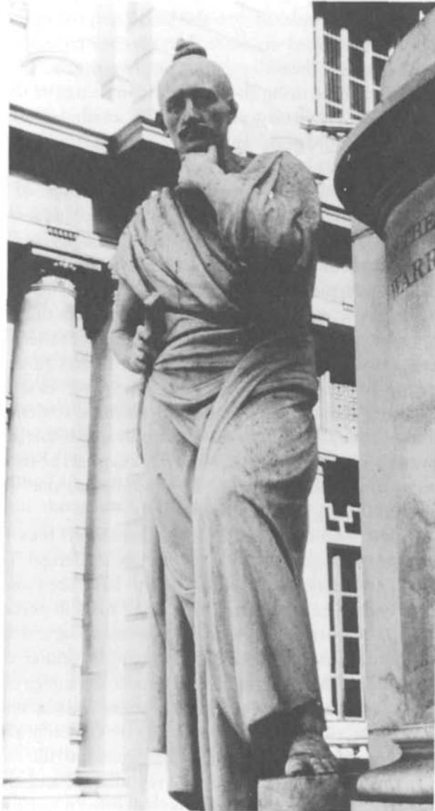
2 A Brahmin, on the Monument to Warren Hastings, by Richard Westmacott (1830). This tall, classically proportioned figure, with shaved head and topknot, represents the heroic image of the Brahmin, as Oriental scholar and Hindu priest, prevalent among the British in the early years of their rule. (See also figure 8.)