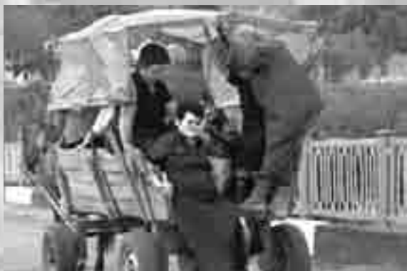
Gali residents cross the Inguri River.