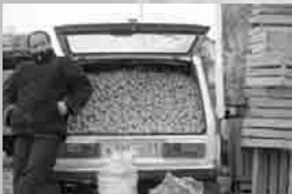
A Russian merchant sells mandarins at the border at Psou.