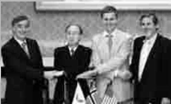
The EU, Japanese, Norwegian and US Co-chairs, May 2006.