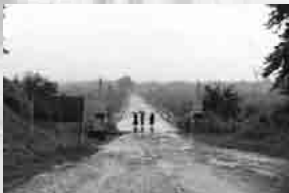
The bridge over the Inguri river.