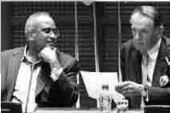
Jan Eliasson (right) with Salim Ahmed Salim, AU Special Envoy for Darfur, October 2007.