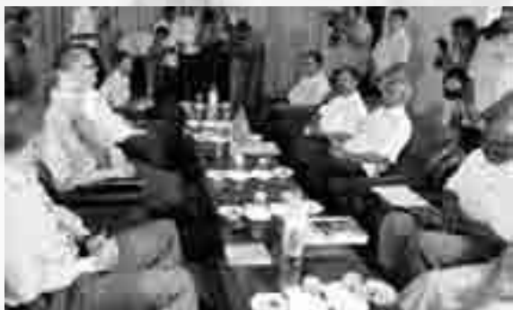
A Norwegian delegation meet LTTE officials in Kilinochchi, northern Sri Lanka, April 2006.