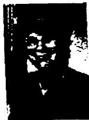
Luncheon, November 17th The Honorable Janet Reno Attorney General of the United States