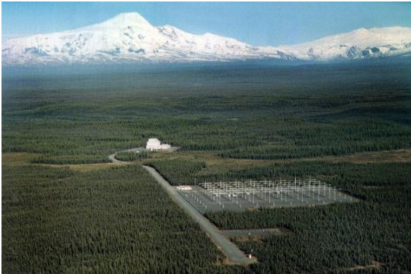
Image 1: Aerial Photo of the HAARP Alaska Site

The newly installed 132 dipole antennas supplied by Phazar vastly increase the size of the HAARP Alaska facility; the new transmitters are supplied and installed by DRS