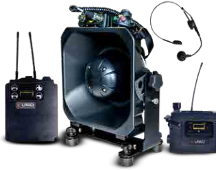
LRAD 100X MAG-HS