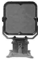
LRAD 500X-RE MMT